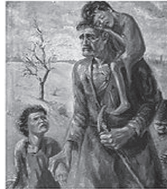
Ismail Shammout, Where to ? (1953)

4.1.1. Ismail Shammout (1930-2006) was born in Lydda. On July 12, 1948, he and his family were expelled from their home in Lydda by Israeli forces, and they moved to the Gaza refugee camp of Khan Younis. Shammout's paintings display Palestinian culture and traditions, and displaced refugees.