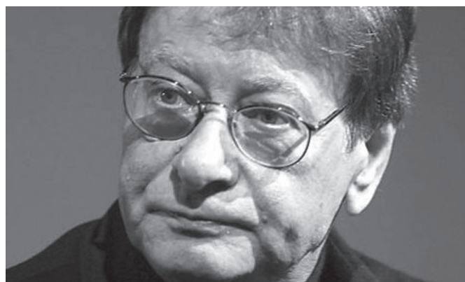
Mahmoud Darwish, February 2008.

3.7.1. Mahmoud Darwish (1941-2008) is perhaps the best known contemporary poet in the Arab world, renowned for his passionate love for his lost country, and regarded as Palestine's national poet. He was born in Al-Birweh, east of Acre in historic coastal Palestine. During 1948 his village was destroyed and his family fled to Lebanon. They returned secretly the following year to their homeland, only to find that their village had been obliterated by two Israeli settlements, and they became internal refugees at Deir al-Asad in the Galilee.