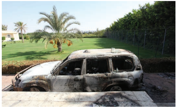
A burnt car in front of the U.S. consulate in Benghazi after an attack that killed four Americans, including Ambassador Chris Stevens, on September 11, 2012. Taken September 13, 2012.

If addressing security is paramount, it is not alone a sufficient condition for realizing the promise of the 2011 revolt. Libya also needs constructive support at both the technical and strategic levels in setting up political and administrative institutions and getting its economy on track. For their part, international actors must ensure that their efforts are coordinated and optimized as much as possible, especially given their limited footprint. They will need to strike a balance between smothering the nascent Libyan state with offers of assistance and standing back as the state struggles to overcome problems that they could help it resolve. Here we identify and explain the major challenges and policy options in four key areas—security, politics, economics, and international assistance. We do not propose to draft a blueprint for Libya's future, but rather set about bringing key issues into sharp focus and helping to set realistic expectations for both Libyans and international actors. A year after Qaddafi was killed, the long-term outlook for Libya is still positive, but the challenges ahead are real; they will require concerted effort by all parties if the natural ups and downs of the postconflict process are to be weathered and Libya is to emerge stable and prosperous. The stabilization process will take many years, but there is no reason that Libya should not become a stable and prosperous