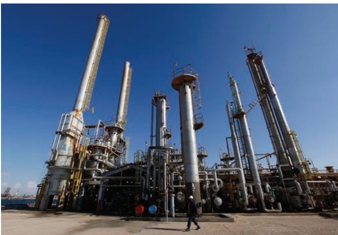
A Libyan oil worker walks in front of a refinery inside the Brega oil complex, in the east of Libya, on February 26, 2011. Production at Brega dropped by almost 90 percent during the war.

Beyond energy, to improve the environment for private businesses, the government must address a wide variety of issues that go well beyond the scope of this paper. The environment for private enterprise under Qaddafi was poor. In fact, Qaddafi actively sought to prevent the emergence of a private sector because it might have threatened his grip on power. Lack of property rights, a poorly educated workforce, an opaque and inefficient bureaucracy, and corruption all made establishing a business in Libya prohibitively expensive, further impeding the emergence of a private sector. Qaddafi meanwhile created perverse incentives for workers by offering higher than market wages for government jobs, while impeding the development of the private sector.