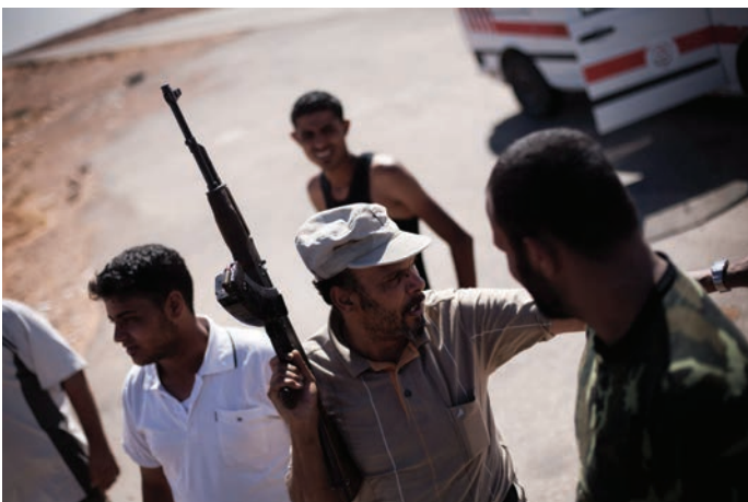
A Libyan militia man gives orders to his comrades at a random checkpoint in the Bir Doufan area, on the border between Misrata and Bani Walid, Libya, on July 14, 2012.

While foreign military forces can and should support these activities with, for example, training, expertise, logistics, and mediation, they do not have a kinetic role except in the most