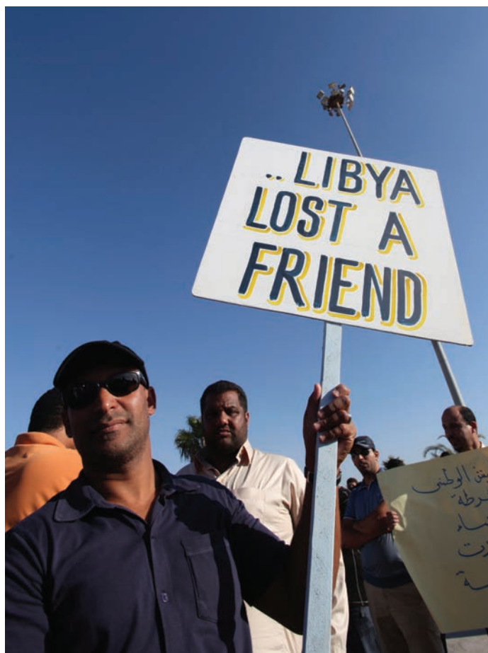
A Libyan man participates in a protest against Ansar al-Shariah, a militia of Islamic extremists, and other Islamic militias in Benghazi, Libya, on September 21, 2012. Hundreds of protesters stormed the compound of one of Libya's strongest armed Islamic extremist groups, evicting militiamen and setting fire to their building as the attack that killed the U.S. ambassador and three other Americans sparked a public backlash against armed groups that run rampant in the country and defy the country's new, post-Muammar Qaddafi leadership.

Unfortunately, in its first four months, the newly elected parliament was unable to come to consensus on a government to tackle these tasks. The difficulties Libya's parliament has faced in establishing a government, however, are themselves intertwined with the security problem, with anticipated new Defense and Interior Ministry appointments creating some of the biggest rifts.