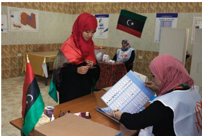
A Libyan woman receives her ballot in a polling station on July 7, 2012, during the first democratic elections after 42 years of dictatorship. The strong voter turnout for the elections suggests that Libyans can overcome the legacy of a regime that consciously depoliticized society.

On July 7, 2012, Libya held historic elections that enabled the handover of power from transitional authorities to the Libyan General National Congress (GNC). Despite significant obstacles, Libya, acting with the support of the United Nations and other actors, held an election that was relatively well organized and judged free and fair. Turnout was over 60 percent, and the parliament that resulted was composed predominantly of moderates,