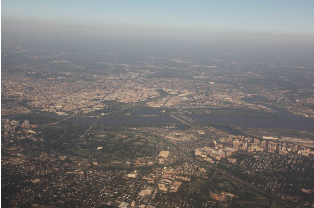
Washington, DC , seen across the Potomac River from the Northern Virginia suburbs, October 2011 (Elvin Wyly).

‘urbanism as a way of life’ that Wirth penned from the context of the south side neighborhoods near the University of Chicago so many years ago. But the fundamental tension of community -- the relations between the individual and society, personal autonomy and intimate social bonds -- may not be so different after all in city and suburban neighborhoods.