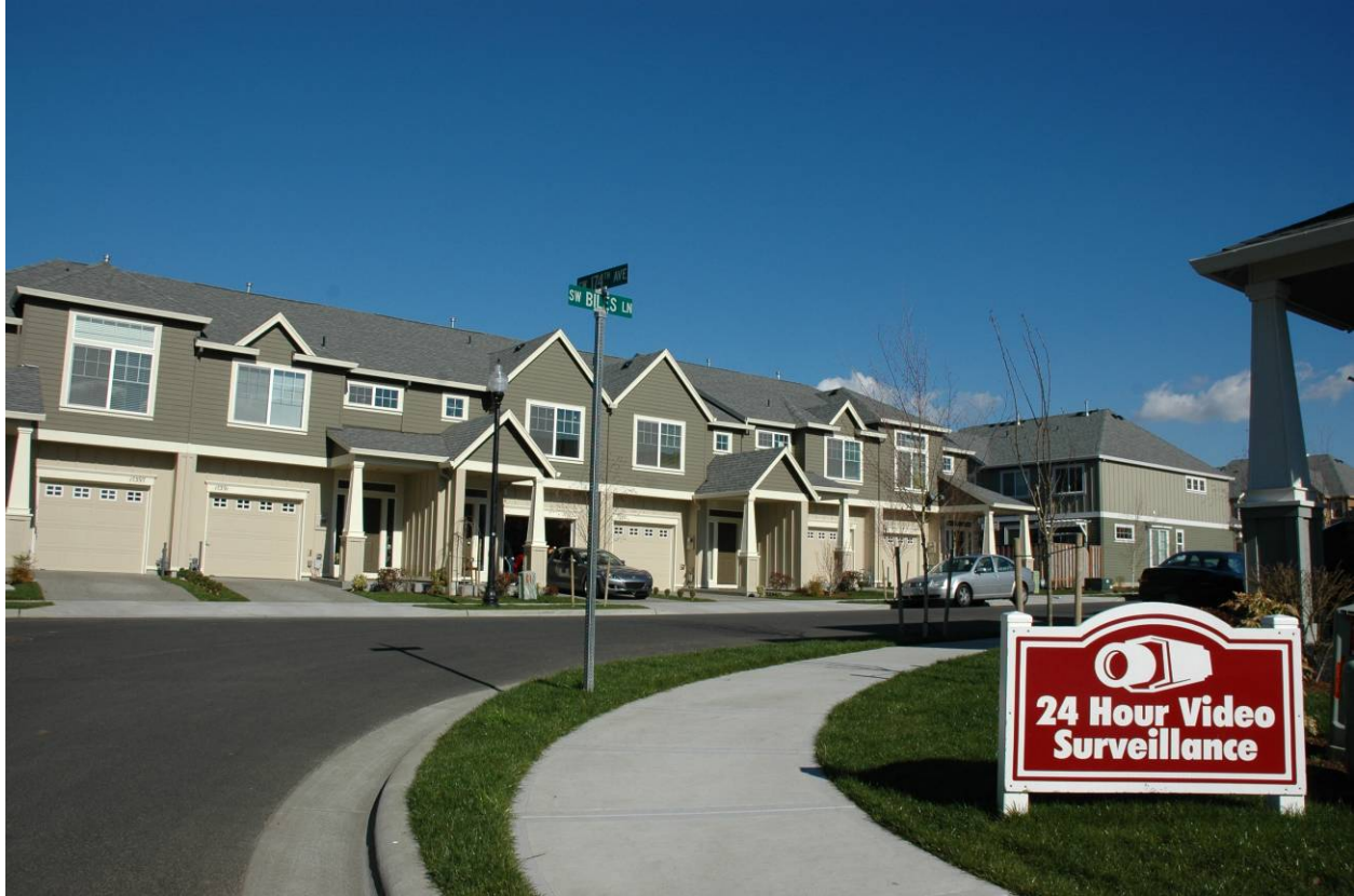
Surveillant Suburb. Beaverton, Oregon, just west of Portland, February 2006. In suburbs with insufficient wealth to create full-fledged gated communities, inexpensive video technology is often used to warn outsiders.