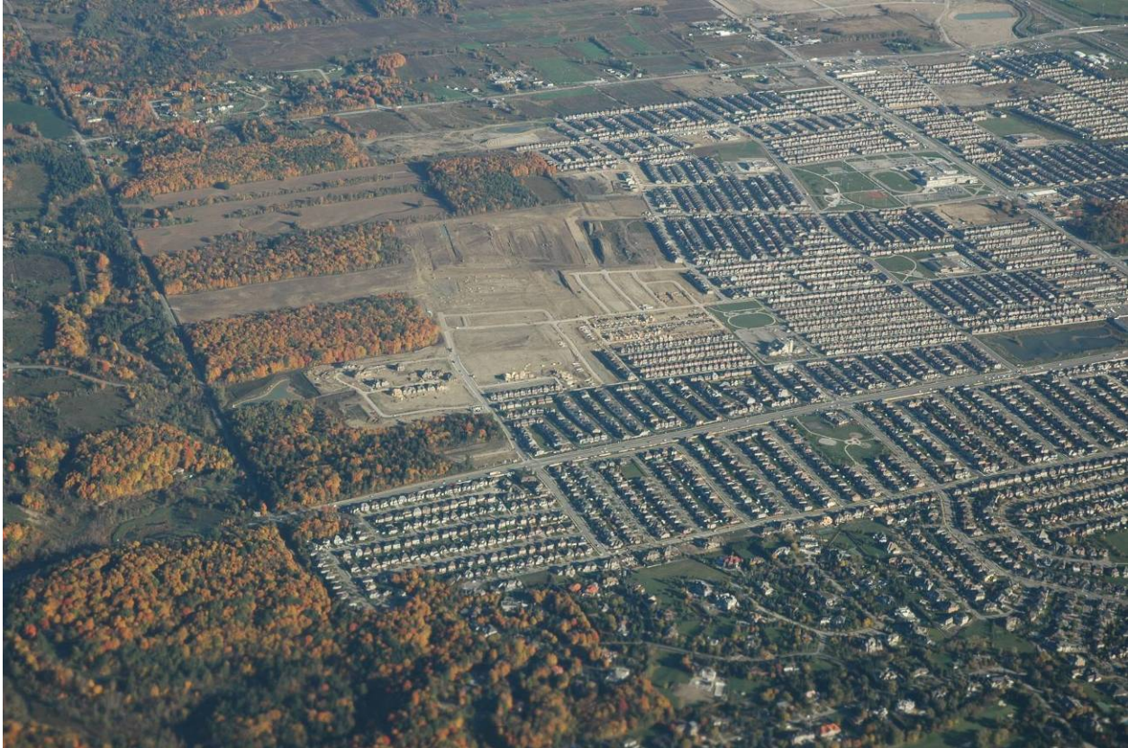
Community on the Edge? Southern Ontario, north-west of Toronto, October 2005 (Elvin Wyly).

Environmental determinism is now seen as a very risky kind of reasoning -- a simplified approach that often slips into unfair stereotypes about people and places. But automobile-oriented landscapes do have some serious problems, and so it is worth considering the way that these machines seem to determine certain aspects of social life in the suburbs.