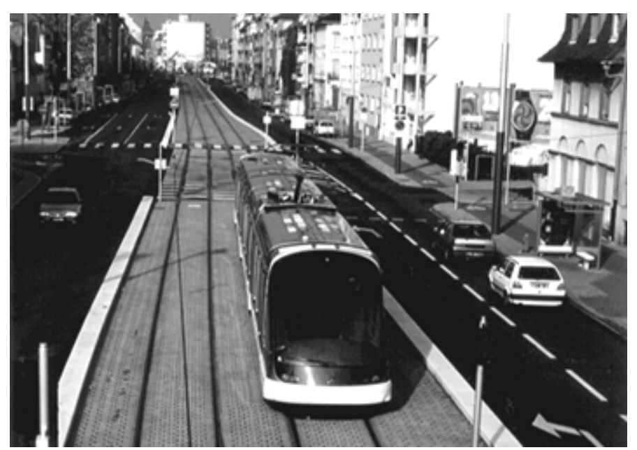
Tramway in Strasbourg

due to the very small numbers of rolling stock and to the high cost of incorporating the system in the urban infrastructure (special pavements, landscaping, street remodelling, etc.,). The Strasbourg system (10 km) cost FFr194 million per km, including rolling stock (20 vehicles).