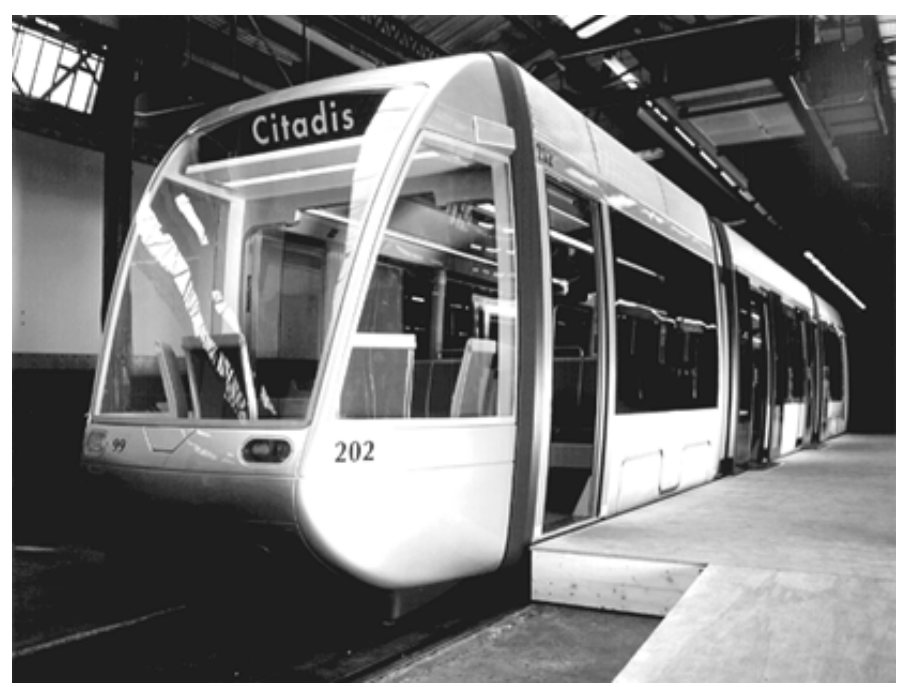
CITADIS guided LRT system