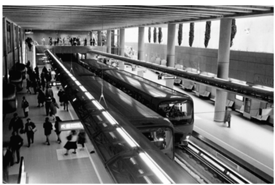
Line D underground metro in Lyon

Paris (Saint-Denis North, Issy/La Défense), Lille, and Strasbourg soon followed suite. The Strasbourg rolling stock has very large windows and a panoramic driver's cab