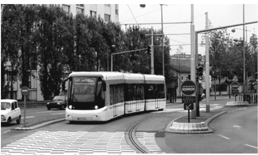
LRT on tyres (TVR), running on RATP network near Paris

Another programme consists of the socalled France Intermediate Transit System, an intermediate system between a bus and a guided LRT. All three types under development consist of articulated carriages on tyred axles with electric motors on wheels, but are guided in different ways. They are being tested on a 1.4-km track south of Paris, which is part of a bus route with curves and gradients. Each system