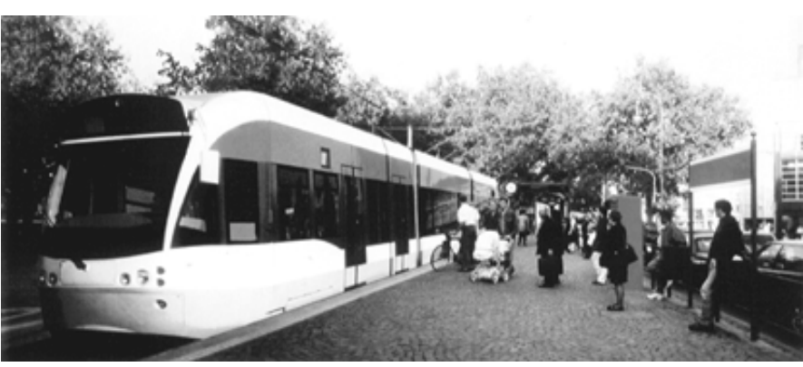
Tram-train between Sarreguemines and Saarbrücken

The challenge is immense, but I am sure that French industry will succeed in developing its share of this global market.