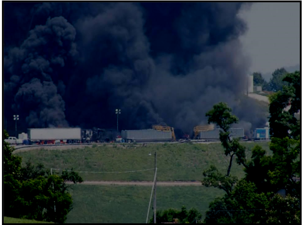
The Eisenbarth well fire, photo by Sardis Volunteer Fire Department