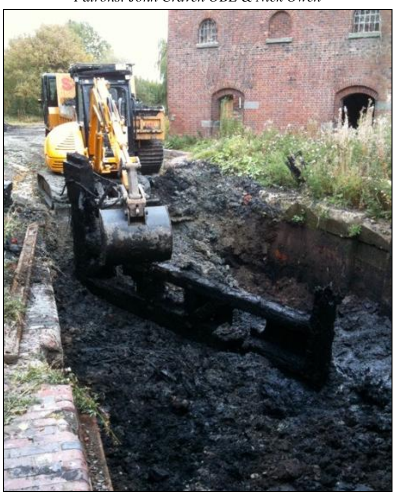
Excavation at Wappenshall (see page 6)