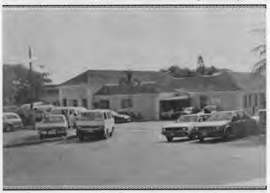
View: Western and Southern side of Out Patient and Casualty Dept. in 1953, Princess Margaret Hospital, formerly known as Bahamas General Hospital.