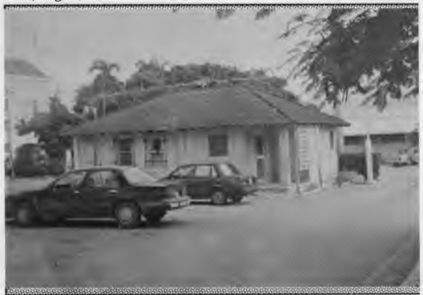
Gate House at Shirley Street Entrance of the Princess Margaret Hospital

Female Lunatic Ward, Crazy Hill, Princess Margaret Hospital Compound. Male Lunatic Ward was located on the Crazy Hill sight of Chief Medical Officer residence on the Crazy Hill. (See Birds Eye View, Page 2).