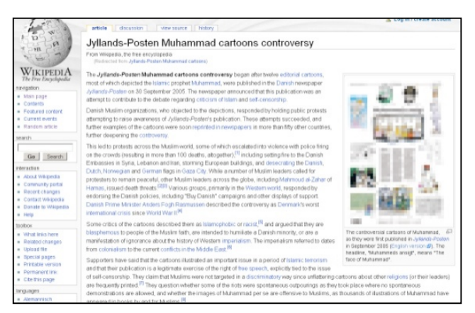
Figure 1: The Jyllands-Posten Muhammad Cartoon Controversy in March 2009.

in editorial discussions on controversial topics, where achieving consensus or compromise solutions can prove difficult.