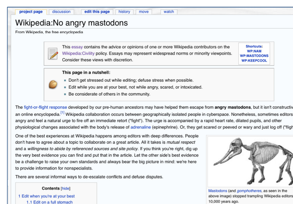
Figure 2: 'No Angry Mastodons' is a humorous essay with a serious message about proper editor behavior.

Our hypothesis is that, like policies, popular essays address issues that are important to Wikipedians, such as behavioral norms, community values and editing practices. However, the type of regulatory work that these essays perform has not been explored.