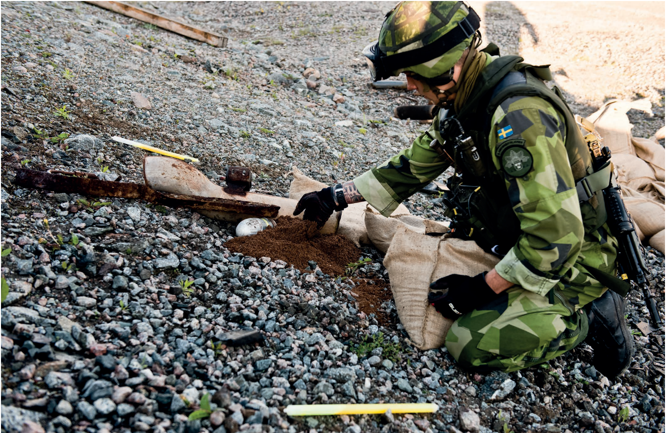
Bomb disposal during the exercise SWENEX.