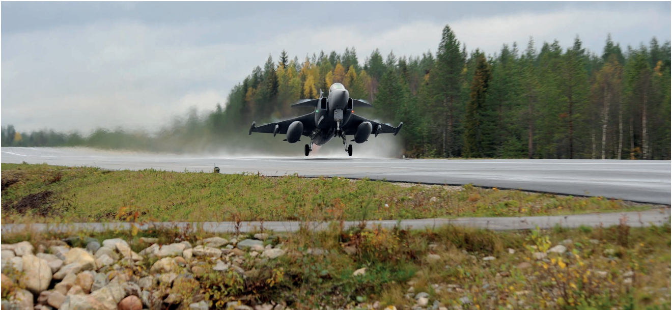
In September 2015, two F-18 Hornet from the Finnish Air Force and two JAS 29 Gripen from Norrbotten Air Force Wing landed on a Finnish highway strip and then conducted a joint training mission within the framework of Cross Border Training.