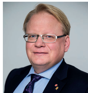
Peter Hultqvist Minister for Defence Chairman NORDEFECO 2015 Sweden

at Policy Steering Committee (PSC) level. The purpose was to emphasise certain areas of cooperation as laid out in the Vision 2020 from december 2013. A number of action plans were developed within the areas policy, capabilities, international operations, armaments and training and exercises. To highlight a few focus areas this year, the Nordic Military Coordination Committee (MCC) looked into possibilities of closer cooperation within air surveillance, which will proceed next year. Within the concept on alternate landing bases, a technical agreement has been drafted that, once signed by all participating nations, will enable our air forces to increase the effect of their exercises. The next step is to examine whether the concept can be extended to also include armed aircraft. The MCC has conducted an initial report on what would be required to establish a high intensity Air Combat Flag Exercise (Northern Flag).