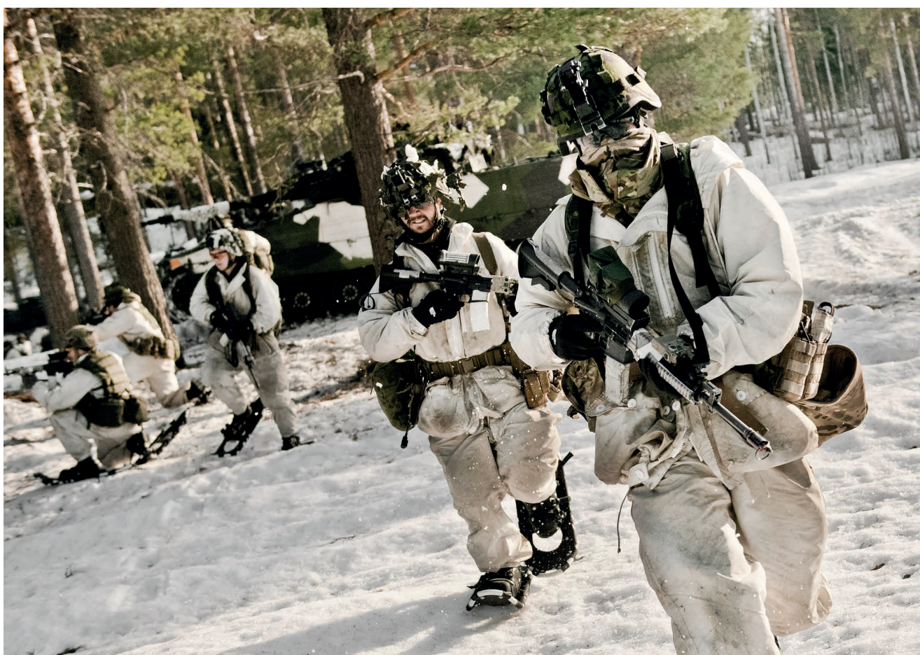
100 Danish soldiers from the Jutland Dragoon Regiment acted as the enemy in the exercise Vintersol.

“We plan to develop Nordic cooperation through bilateral agreements and present a new concept of Nordic cooperation, through easy access declarations.”