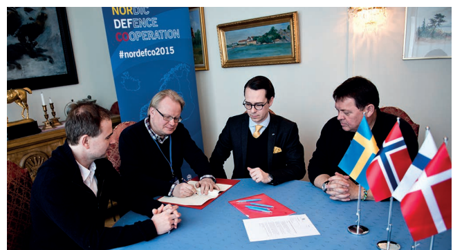
During the Defence Ministerial in March 2015, the Ministers signed the Agreement concerning support for industry cooperation in the defence material area.

The Nordic Ministers and Chiefs of Defence have for several years worked to strengthen and develop Nordic cooperation on air surveillance. Exchange of data on air surveillance will facilitate for improved situational awareness in the