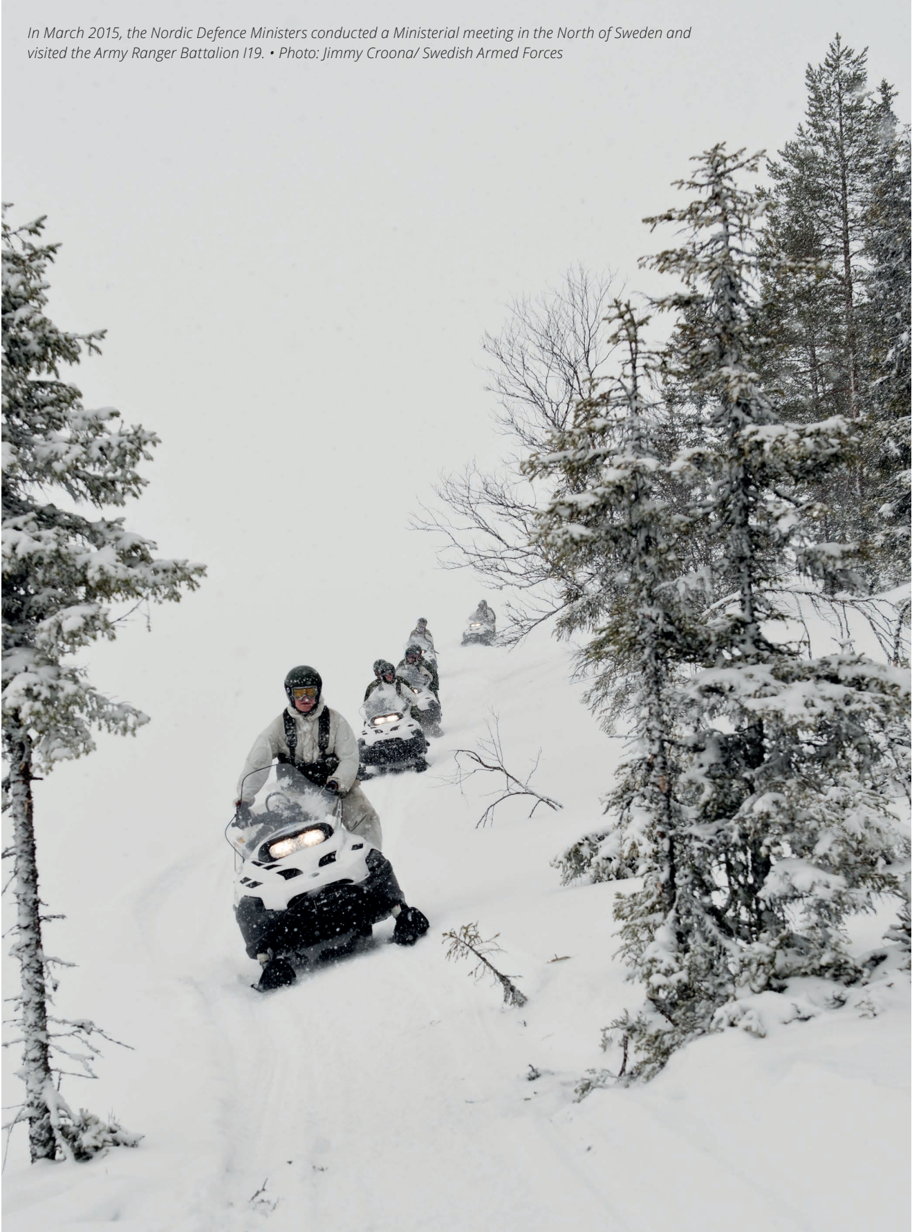
In March 2015, the Nordic Defence Ministers conducted a Ministerial meeting in the North of Sweden and visited the Army Ranger Battalion I19.