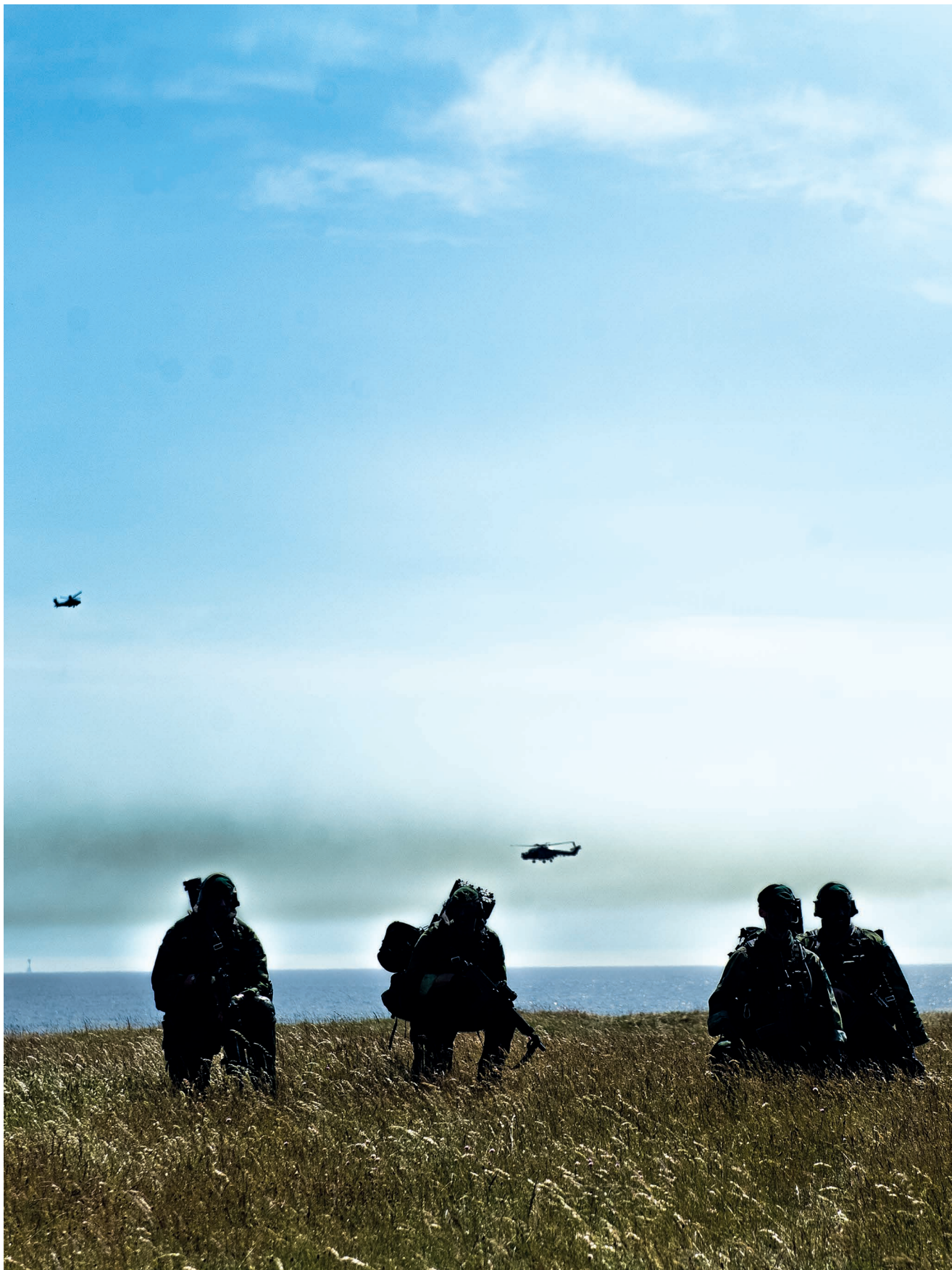
Swedish soldiers participating in the annual NATO exercise BALTOPS.