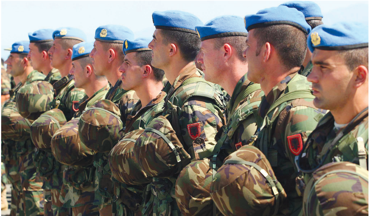
Albania has an unbroken record of service to blue-helmet peacekeeping