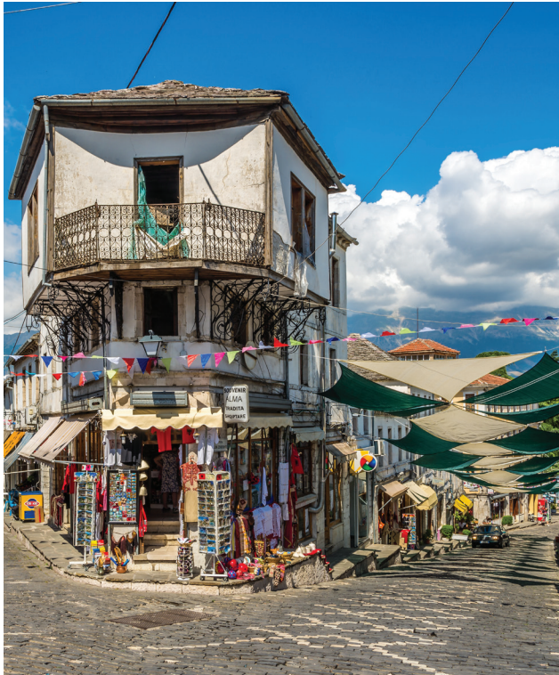
Gjirokastra, UNESCO World Heritage Site