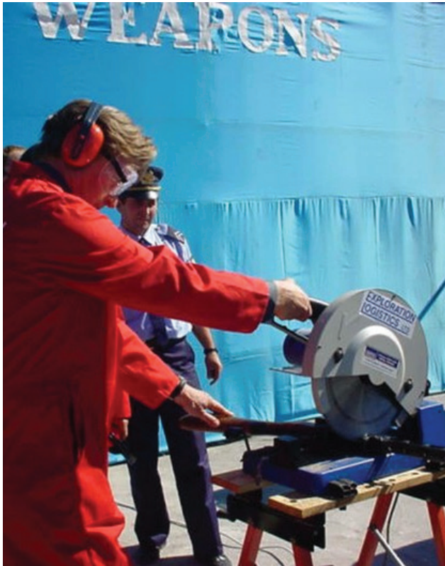
Hollywood actor Michael Douglas acting in his capacity as a UN Messenger of Peace 'Weapons in exchange for development', Albania 11-12/10/99

2001-2004: UNDP in partnership with the Government of Albania, launched a program to support the security sector reform (SSSR) in Albania. The programme was a grassroots community based policing initiative that aimed to improve public order at the local level, strengthening police capacities, promote a positive police image and the role of the police as a provider of public services, as well as to enhance mutual trust in social cohesion.