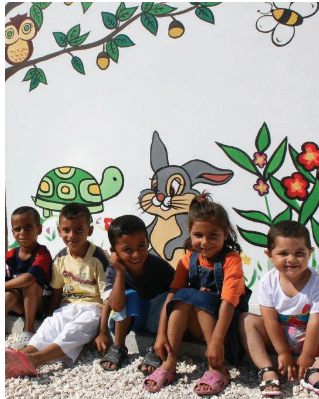
Children enjoying their new kindergarten in Berat

October 21, 2014: Albania was elected member of the UN Human Rights Council for the term 2015-17 and Vice-President of its Bureau for the year 2015. As a member of the Human Rights Council, Albania strongly supports the respect for human rights and their universality. This membership is an expression of Albania's achievements based on the principles of freedom, human rights and democracy that almost a quarter-century ago seemed impossible. It inspires Albania to firmly continue this path, as our only alter-