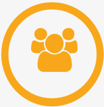
Other payments / any biller