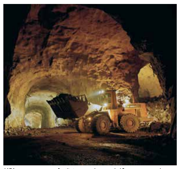
KB's new storage facilities are located 40 meters under the Humlgården park and built in the early 1990's

Early in the 1990's more thorough changes were begun to KB's storage and other facilities. In early summer of 1997, two large underground caverns were excavated under the Humlegården park.