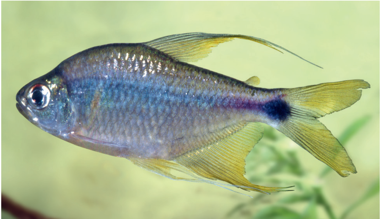
Fig. 5. Nematoharax venustus WEITZMAN, MENEZES & BRITSKI, 1986. Uncatalogued, live.