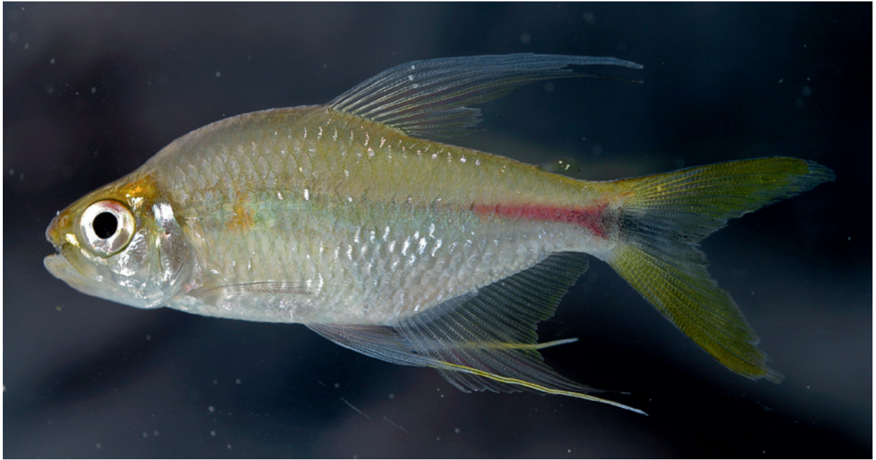
Fig. 1. Nematocorax costai new species, UFRJ 8216, live holotype, male, 49.8 mm SL; Brazil: Bahia: Iguai.