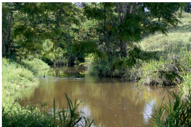
Fig. 4. Type locality of Nematocharax costai new species. Cambiriba Stream, Balneário Guaíra, Contas River basin (Brazil: Bahia: Iguaí).

beyond caudal-fin base; fifth unbranched anal-fin ray and first to sixth branched anal fin rays forming major part of anal-fin lobe; in males fifth branched anal-fin ray usually longest. Males with small bony spinules present on fifth unbranched and first to fourth branched rays, more developed in fourth branched ray (Fig. 2). Spinules small, one or two per ray segment. Spinules numerous, approximately 10 on each ray. Spinules distributed on median portion of rays.