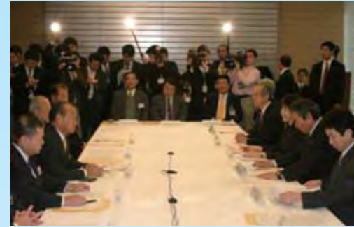
Council Meeting on Measures for Relocation of Futenma Air Station