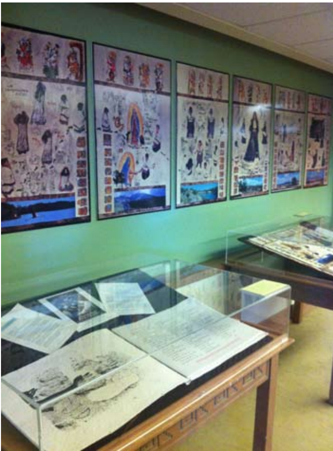
University of New Mexico's Illustrated Identities exhibit with Codex Delilah on the wall and Crickets in my Mind in display cases.