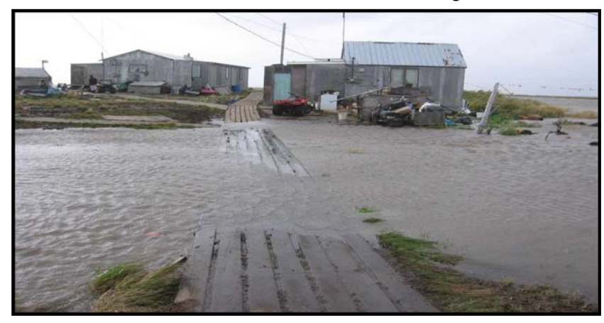
Photo 5: Flooding during coastal storm in Newtok.

94 miles northwest of Bethel. The community lies at approximately 60.942780° North Latitude and -164.629440° (West) Longitude. (Sec. 24, T010N, R087W, Seward Meridian.) Newtok is located in the Bethel Recording District. The area encompasses 1.0 sq. miles of land and 0.1 sq. miles of water. Newtok is located in a marine climate. Average precipitation is 17 inches, with annual snowfall of 22 inches. Summer temperatures range from 42 to 59, winter temperatures are 2 to 19.