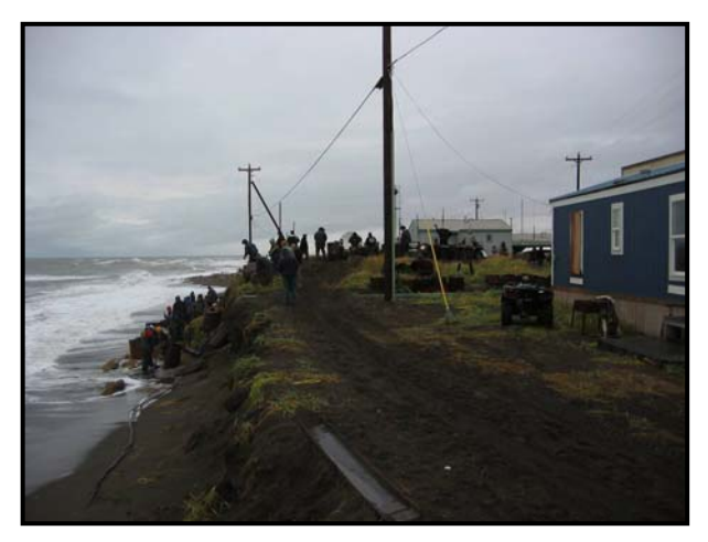
Photo 2: Work crew at eroded shoreline in Kivalina.

Kivalina is at the tip of an 8-mile barrier reef located between the Chukchi Sea and Kivalina River. It lies 80 air miles northwest of Kotzebue. The community lies at approximately 67.726940° North Latitude and -164.533330° (West) Longitude. (Sec. 21, T027N, R026W, Kateel River Meridian.) Kivalina is located in the Kotzebue Recording District. The area encompasses 1.9 sq. miles of land and 2.0 sq. miles of water. Kivalina lies in the transitional climate zone which is characterized by long, cold winters and cool summers. The average low temperature during January is -15; the average high during July is 57. Temperature extremes have been measured from -54 to 85. Snowfall averages 57 inches, with 8.6 inches of precipitation per year. The Chukchi Sea is ice-free and open to boat traffic from mid-June to the first of November.