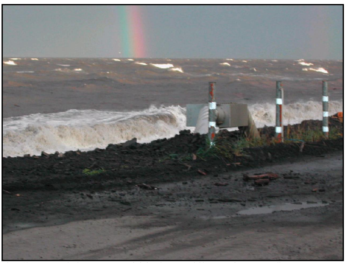
Photo 13: Remains of infrastructure at eroded shoreline in Unalakleet.

Unalakleet has a State-owned 6,004' long by 150' wide gravel runway which recently underwent major improvements; and a gravel strip that is 2,000' long and 80' wide. There are regular flights to Anchorage. Cargo is lightered from Nome; there is a dock. Local overland travel is mainly by ATVs, snowmachines and dogsleds in winter.