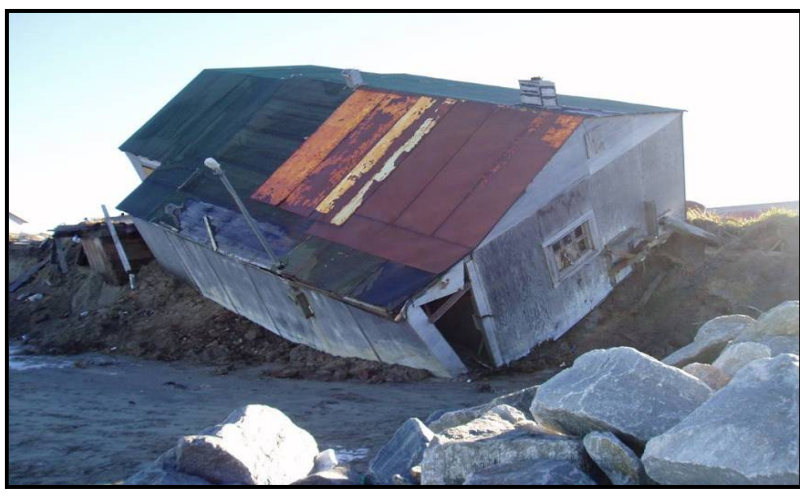
Photo 9: Home falling over eroded bank in Shishmaref.

66.256670° North Latitude and -166.071940° (West) Longitude. (Sec. 23, T010N, R035W, Kateel River Meridian.) Shishmaref is