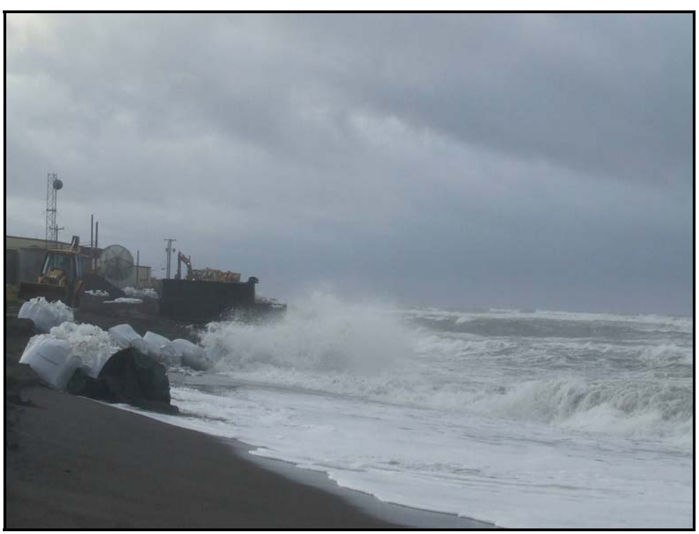
Photo 3: Coastal storm threatens critical infrastructure in Kivalina.

The major means of transportation into the community are plane and barge. A State-owned 3,000' long by 60' wide gravel airstrip serves daily flights from Kotzebue. Crowley Marine Services barges goods from Kotzebue during July and August. Small boats, ATVs, and snowmachines are used for local travel. Two main hunting trails follow the Kivalina and Wulik Rivers.