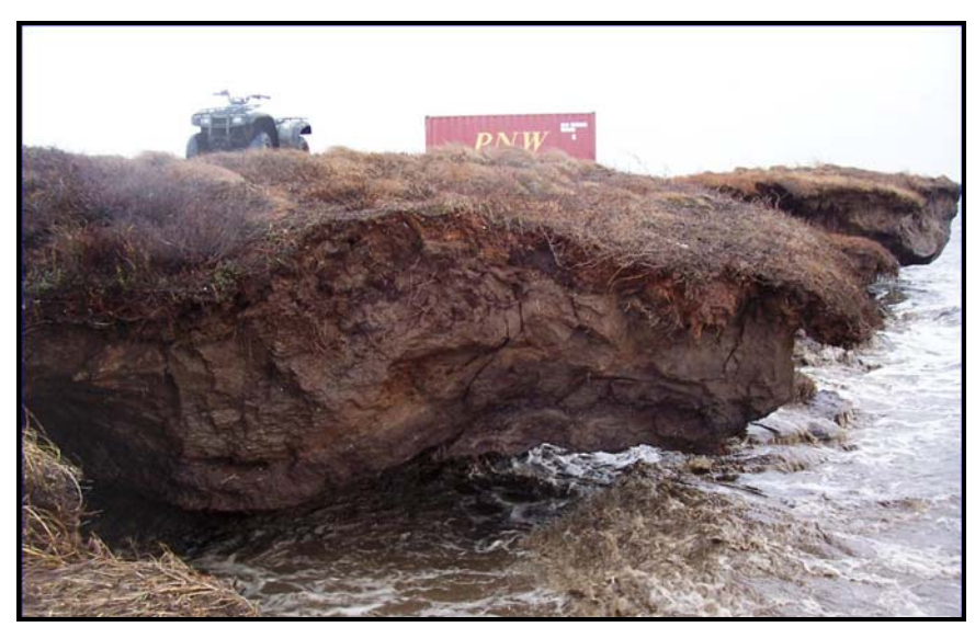
Photo 1: Undercutting of river bank in Newtok.

Detailed community descriptions can be found on pages 12 - 24.