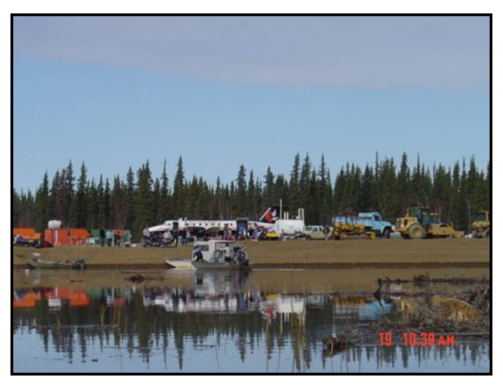
Photo 4: Runway located in the floodplain in Koyukuk.

Koyukuk is located on the Yukon River near the mouth of the Kovukuk River, 30 miles west of Galena and 290 air miles west of Fairbanks. It lies adjacent to the Koyukuk National Wildlife Refuge and the Innoko National Wildlife Refuge. The community lies at approximately 64.880930° North Latitude and -157.701030° (West) Longitude. (Sec. 17, T007S, R006E, Kateel River Meridian.) Koyukuk is located in the Nulato Recording District. The area encompasses 6.2 sq. miles of land and 0.1 sq. miles of water. The area experiences a cold, continental climate with extreme temperature differences. The average daily high temperature during July is in the low 70s; the average daily low temperature during January ranges from 10 to below