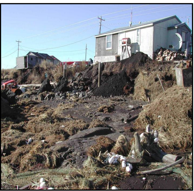
Photo 11: Shoreline erosion at Shishmaref.

Shishmaref's primary link to the rest of Alaska is by air. A State-owned 5,000' long by 70' wide paved runway is available. Charter and freight services are available from Nome. Most people own boats for trips to the mainland.