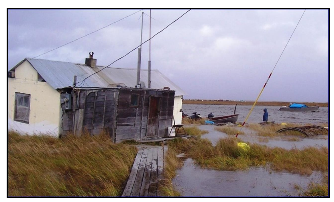
Photo 6: Flooding during coastal storm in Newtok.

The school, clinic, village services, and commercial fishing provide employment. Subsistence activities and trapping supplement income. Twenty-seven residents hold commercial fishing permits. A State-owned 2,202' long by 35' wide gravel airstrip provides chartered or private air access year-round; major improvements are under construction. A seaplane base is also available. Boats, skiffs, andsnowmachines are used for local transportation and subsistence activities. Winter trails are marked to Chevak (50 mi.), Tununak, Toksook Bay, Nightmute, and Manaryarapiaq (33.8 mi.) Barges deliver cargo during the summer months.