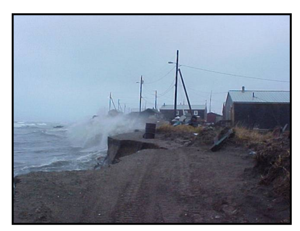
Photo 10: Shoreline erosion during coastal storm in Shismaref.

located in the Cape Nome Recording District. The area encompasses 2.8 sq. miles of land and 4.5 sq. miles of water. The area experiences a transitional climate between the frozen arctic and the continental Interior. Summers can be foggy, with average temperatures ranging from 47 to 54; winter temperatures average -12 to 2. Average annual precipitation is about 8 inches, including 33 inches of snow. The Chukchi Sea is frozen from mid-November through mid-June.