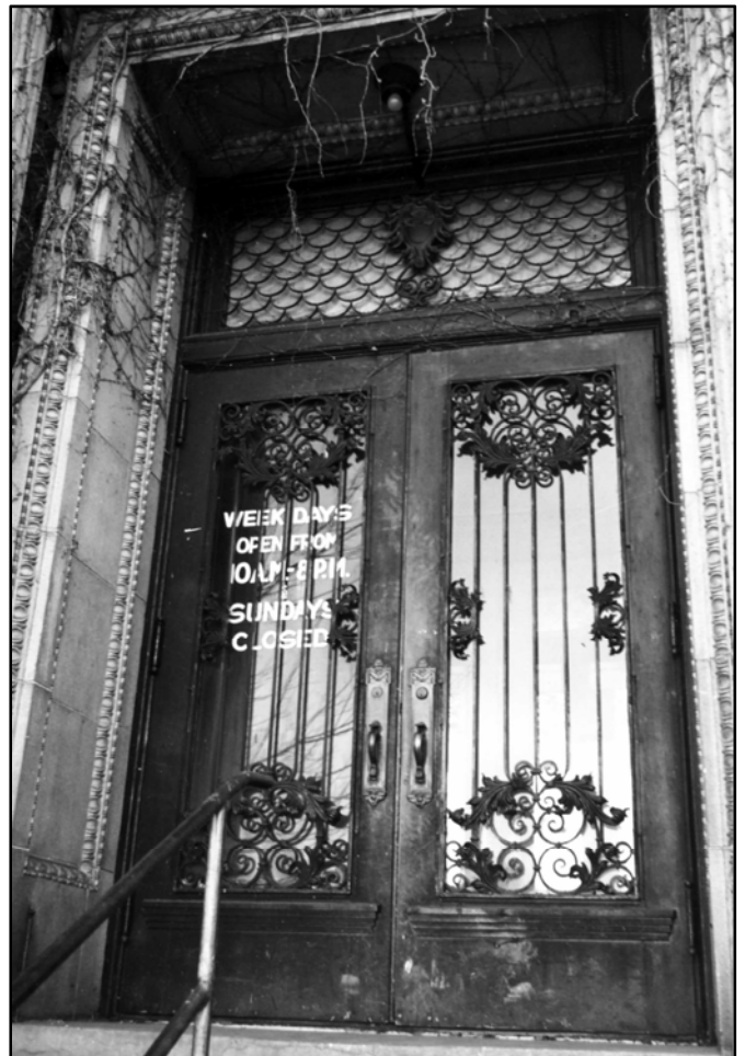
Detail of main (north) entry, showing double doors with iron grille-work