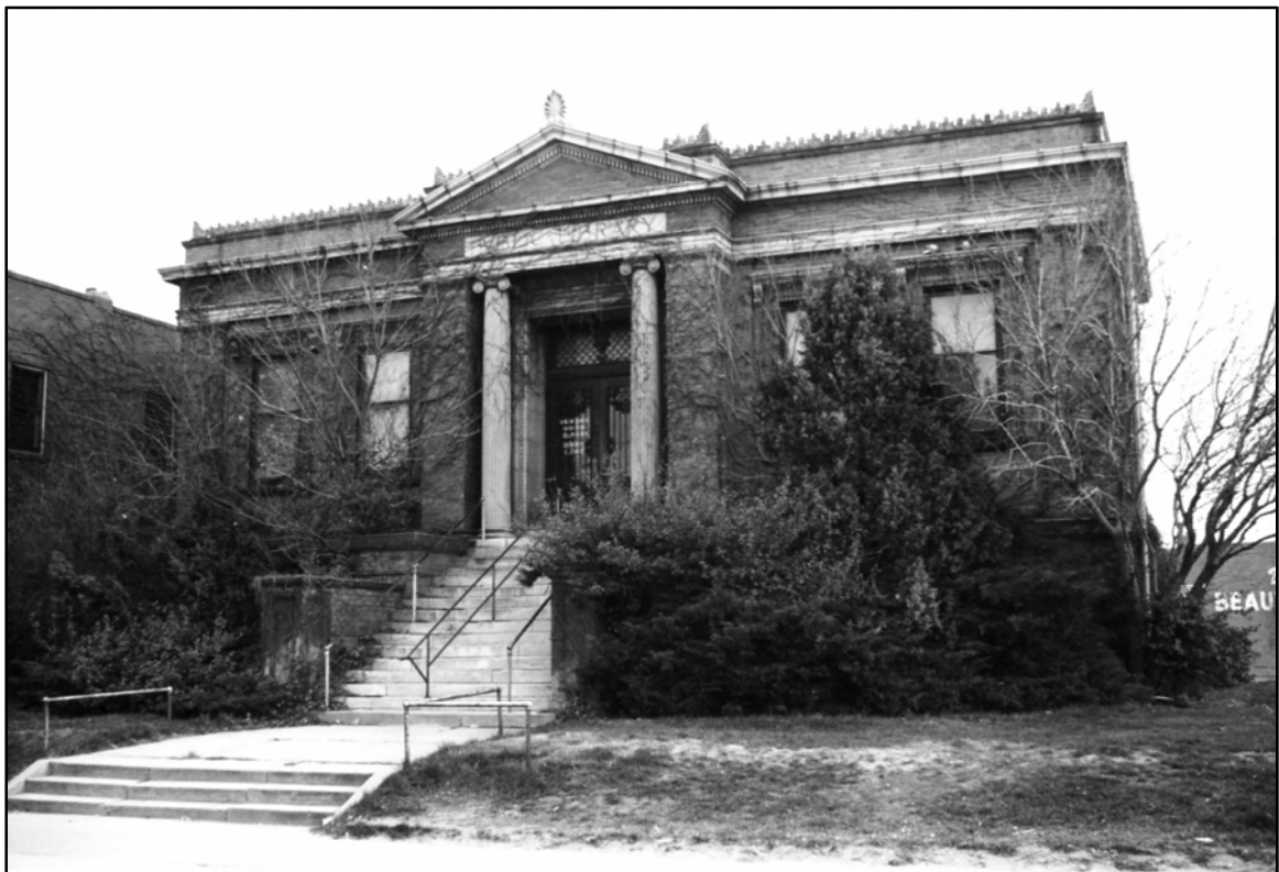
View of main entrance (north) façade