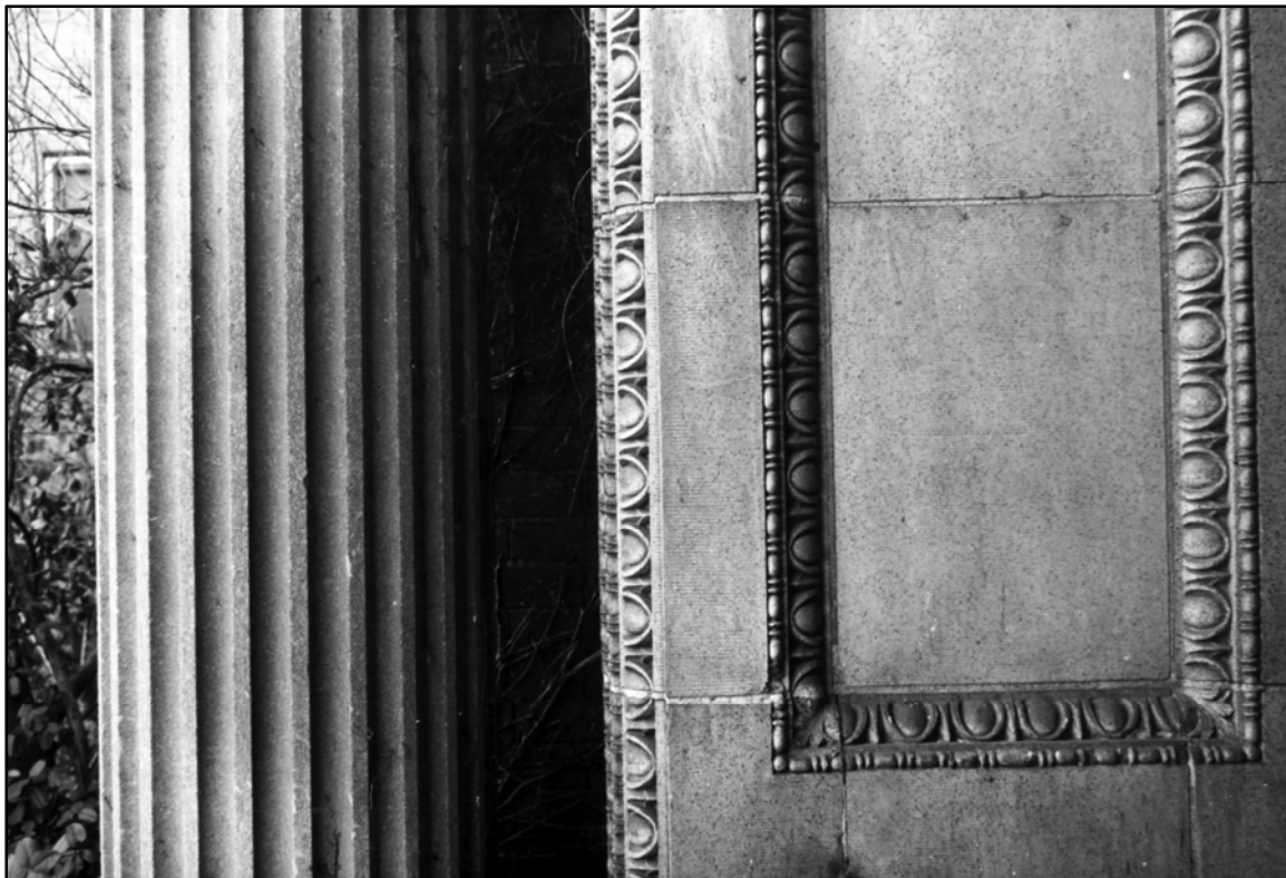
Detail view of stone work at main (north) entrance, base of jamb, looking east, Nov 1974 (7411/18:12)