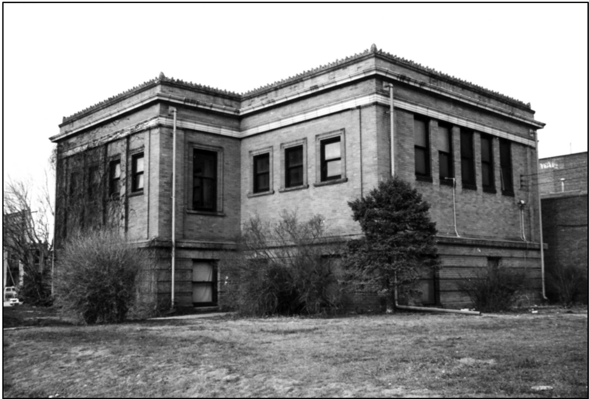
General view of west and south facades