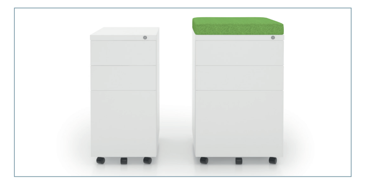
Standard & slimline pedestals