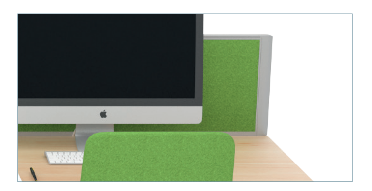
Desk mounted screens

To make working ergonomic and environments comfortable.