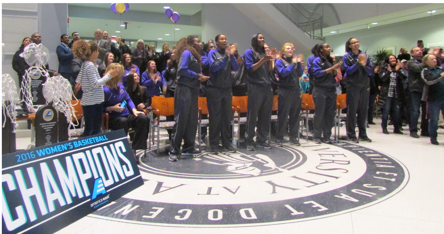
2016 UAlbany Women's Basketball NCAA Selection Show