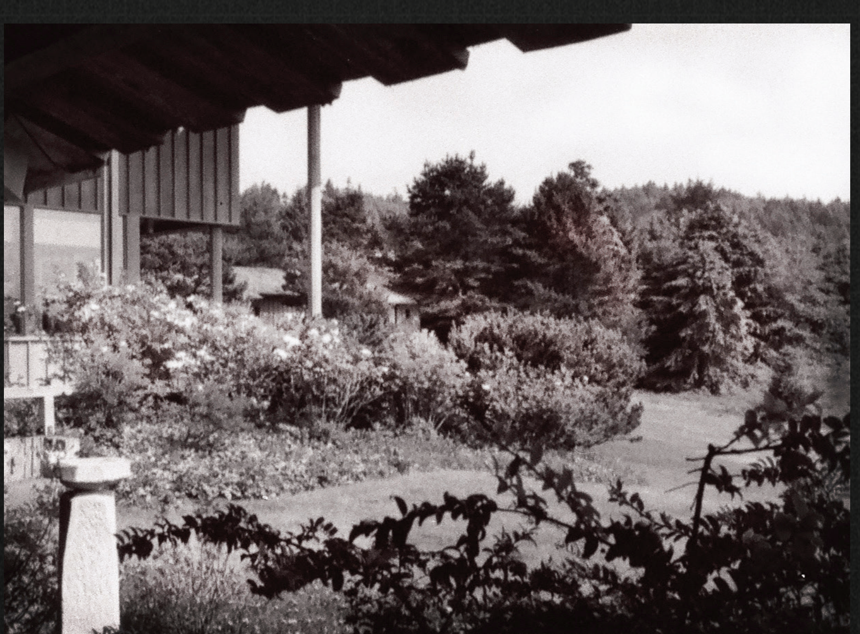
College of Optometry, Pacific University Forest Grove, Oregon

"You've heard a tune where the notes were all there, but it wasn't music? You add the harmony and the arrangements; there are crescendos and obbligatos. I have a friend who is a musician and she's been wanting me to help her make a garden. I said, 'This is what we're trying to do. We're playing music out here'."