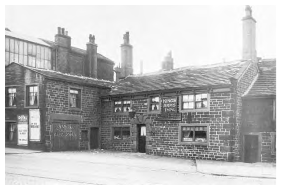
1 The Kings Arms Inn , Great Horton , near Bradford : this building dates from 1739, when it was a small village inn, but was photographed here at the beginning of the twentieth century, by which time the erstwhile village had been absorbed into the city of Bradford.

In a previous article in The Local Historian , I examined a particularly full set of records generated as part of the administration of the liquor licensing system, those stemming from the Licensing Act of 1904.<sup>1</sup> In this second article, I look at a similarly rich survival, the records relating to the licensing of inns and alehouses in the second half of the eighteenth and the first quarter of the nineteenth centuries. The liquor licensing system may be defined simply as that body of regulation concerned with the consumption of alcoholic drinks and the public places in particular in which they are enjoyed. I begin by tracing the historical development of that system down to, and including, the important Act of 1753. The operation of the system from that date is then examined, ending with an equally significant piece of licensing legislation, the consolidating statute of 1828. The location and contents of the records themselves are then described. There follows an attempt to portray how the system worked, giving flesh, so to speak, to the records as we encounter the individuals taking part and