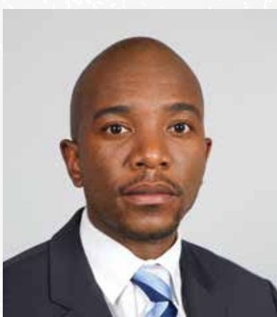
Mr Mmusi Maimane, Democratic Alliance (DA)

Honourable President, we proudly join all ANC Members of Parliament who have welcomed your State of the Nation Address, in particular your emphasis on fundamentally changing the ownership patterns of the means of production of the South African economy in favour of Africans in particular, and blacks in general. The time is indeed now for our government to use our political authority to advance the radical economic transformation in our country. We have not been negligent in pursuit of this transformative goal, and many who have previously benefited took it as a given that black people will never ascend to the point of economic control and ownership.