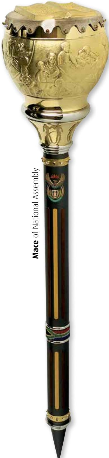
Mace of National Assembly

PARLIAMENT OF THE REPUBLIC OF SOUTH AFRICA