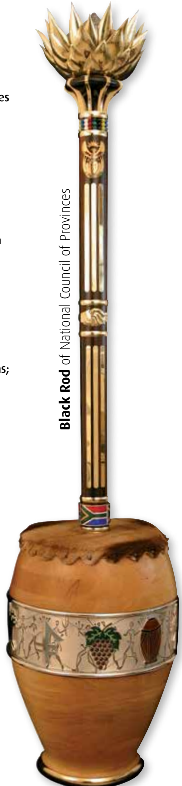
Black Rod of National Council of Provinces