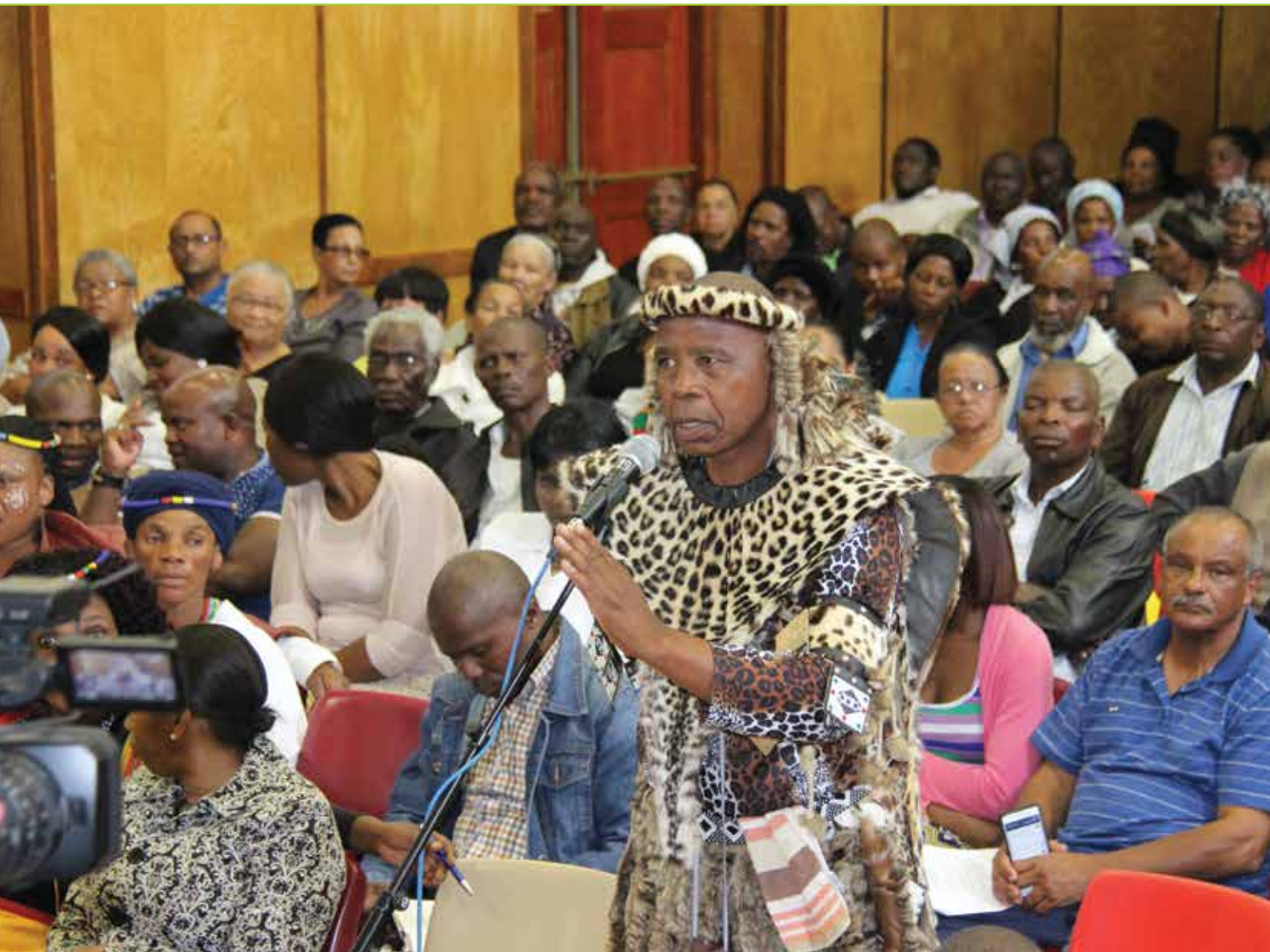
MAKING THEIR VOICE HEARD: The citizens of Kokstad in KwaZulu-Natal attended public hearings on the Traditional and Khoi-San Leadership Bill to share their views on the proposed legislation.