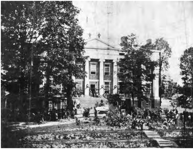
School for the Deaf/Knoxville City Hall

178901 Classroom building. The final addition was made in 1904 to the Romanesque Chapel.