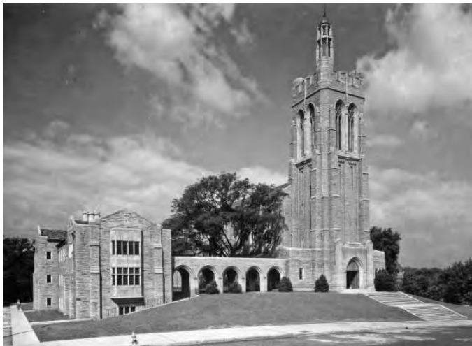
Church Street Methodist Church

Church Street Methodist Church, 900 Henley Street (1930). Barber & McMurray, with John Russell Pope of New York as consulting architect, designed this distinctive Gothic Revival structure.