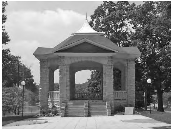
Chilhowee Park Bandstand

Chilhowee Park Bandstand (1897). The bandstand was built of Tennessee marble, and its construction and design were overseen by the marble producers. It served as a centerpiece for the expositions held in Knoxville, and is still a highlight of Chilhowee Park.