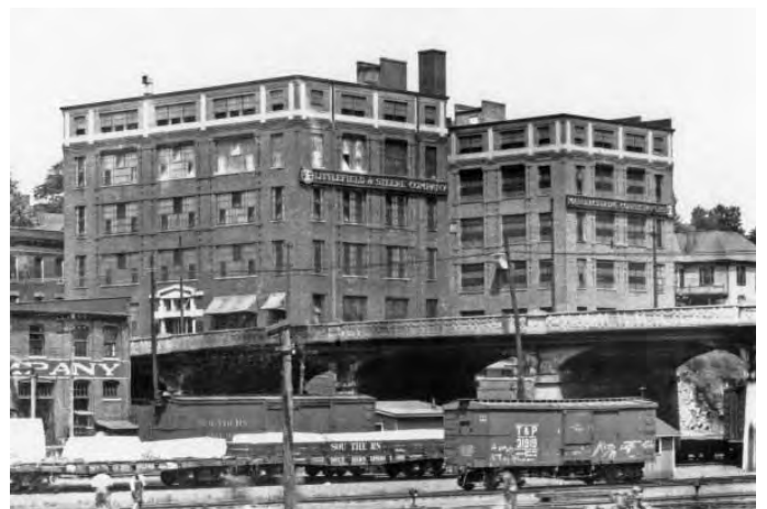
The Candy Factory

Candy Factory, 1060 World's Fair Park Drive (c.1925). This brick building was built as the manufacturing building for Littlefield & Steere, a candy company. The building utilized the Art Deco and Commercial Vernacular styles, elements of which can still be seen.