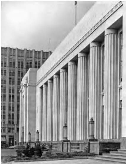
Knoxville Post Office and Federal Building

Knoxville Post Office and Federal Building, 501 Main (1934). This Baumann & Baumann building contains elements of both Art Moderne and Art Deco styling, and is clad in East Tennessee marble.