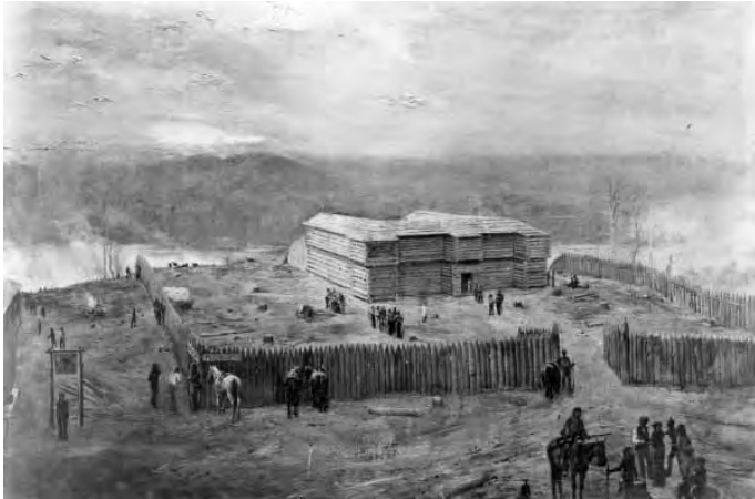
In 1793, U.S. troops established this log military blockhouse at what is now the intersection of Main and Gay Streets.

Tennessee River. In 1793, U.S. troops established a log military blockhouse on the present site of the Knox County Courthouse (Main at Gay). James White operated a mill on First Creek, and lived on the block between present day State and Central Avenues and Clinch and Union Streets. Colonel David Henley, for whom the Henley Bridge is named, probably lived near the Tennessee River and Second Creek.