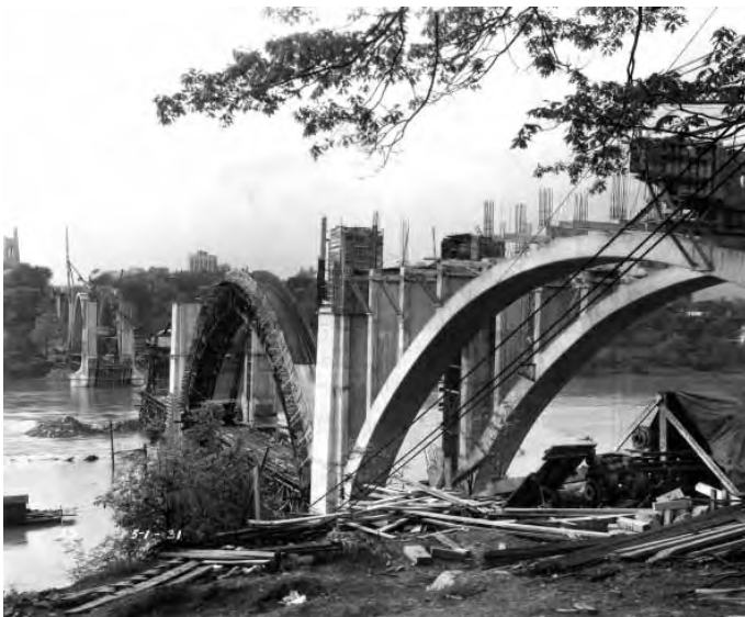
Henley Street Bridge, under construction

Henley Bridge (1932). Designed by Marsh Engineering of Des Moines, Iowa.