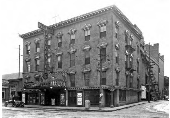
Lamar House/Bijou Theater

Lamar House/Bijou Theater, 803 S. Gay (c.1818, 1837, 1900-1909). The building that houses the Bijou Theater was built as a private residence prior to 1818, and became a hotel known as the Lamar House in that year. The building was extensively altered in 1837, when Gay Street was regraded, making it possible to incorporate entrances at what had been the basement level. The 1900-1909 renovations resulted in the Bijou Theater.