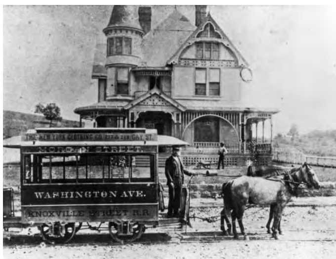
This horse-drawn streetcar that served Washington Avenue was eventually electrified.

Some folks say that the Dummy can't run, But I done seen what the Dummy done done. It left Fountain Head at half past one, And pulled into Knoxville with the settin' sun.