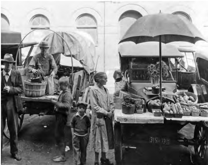
Market Square gave local farmers a place to sell their produce in the city.

The Warehouse District, along Jackson, Central and Gay Street north of Union became a regional wholesaling and retail center.