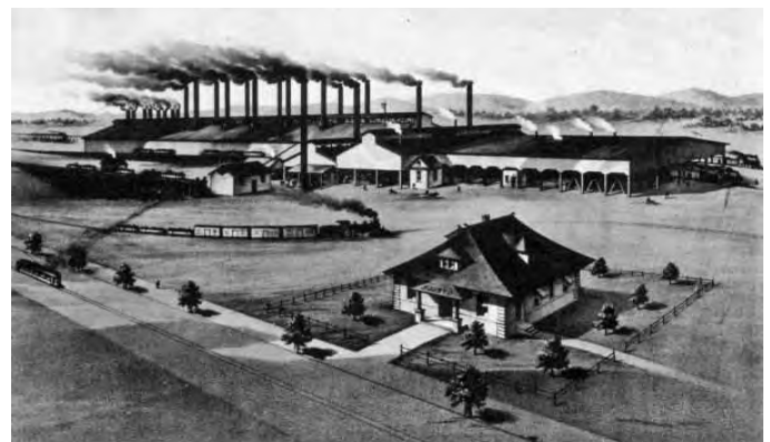
Much of Knoxville's industrial growth occurred in the 1880s.

Knoxville's greatest percentage of industrial growth occurred in the 1880s. Between 1880 and 1887, ninety-seven new factories were built. The population grew through immigration and as it did, the demand for housing also grew. Advances in public facilities -including transportation (streetcars), a water system, sewage disposal, street lights, electrical distribution, telephones – all affected the form of new construction taking place during this era. One of the first expansions was to the west, in Fort Sanders, which was within walking distance of downtown. Other suburban expansion was triggered by construction of streetcars (North Knoxville, parts of Oakwood-Lincoln Park, Fountain City, and Island Home to the south). Still other expansion occurred near the