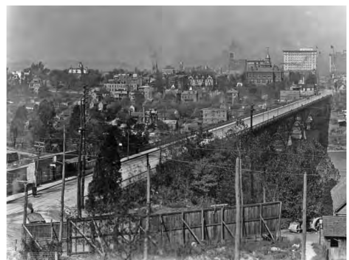
The Gay Street Bridge, built in 1898, was the fourth bridge built in that general location since Knoxville's founding

Neighborhood schools were widely distributed throughout the city, but until the 1950s, Knoxville High School provided the central high school facilities for all of Knoxville. Churches and commercial establishments not located in downtown Knoxville were along the major streetcar lines, with some isolated commercial development in neighborhoods. Downtown Knoxville, which had developed retail and wholesale trade north of the original downtown, developed into three distinct commercial areas—