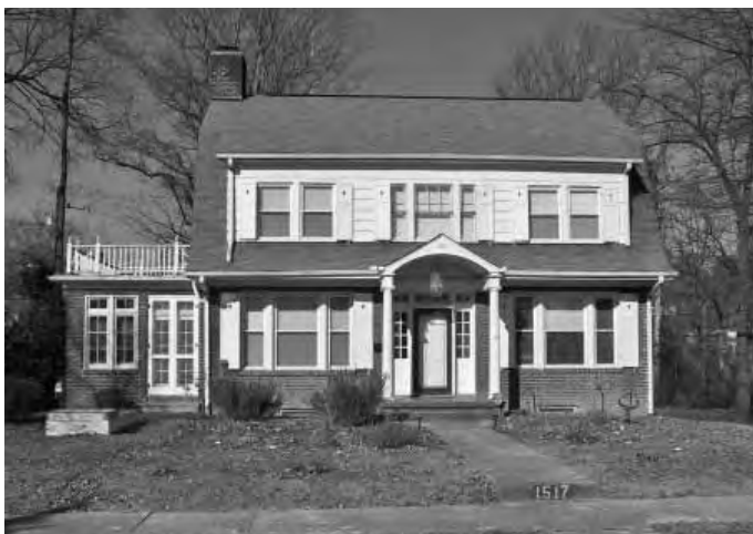
Dutch Colonial Revival

Art Moderne and Art Deco: Very few examples of the Art Moderne style exist in Knoxville. There is one residential example