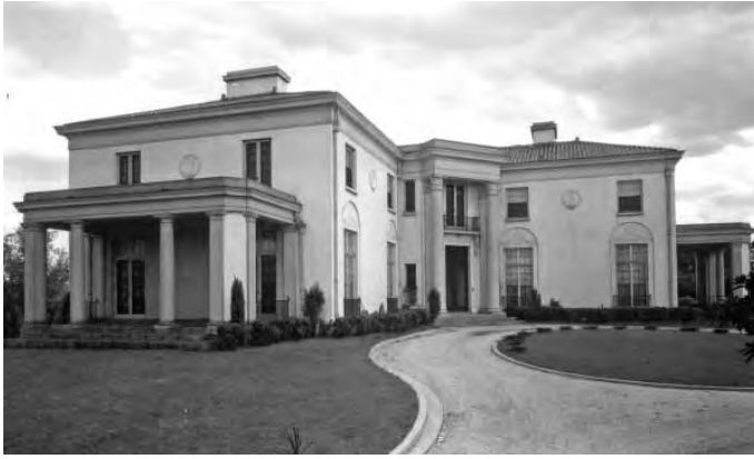
The Dulin House is part of the Kingston Pike Historic District.