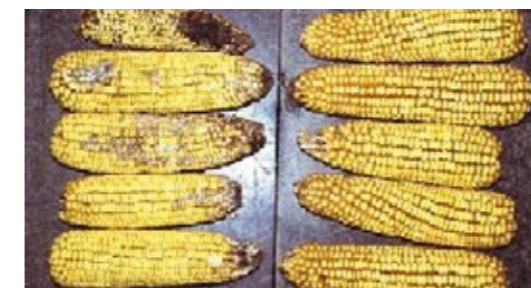
Conventional maize (left) damaged by maize borers, while Bt maize (right) is resistant against these insects.

Just as weeds can become resistant to herbicides, insects can also adapt to plant protection products or even to cultivation practices that keep them under control. The corn rootworm ( Diabrotica virgifera ) causes great damage to maize in the United States. The larvae feed on the roots of maize plants, causing damage and loss of yield, while the beetles that grow from the larvae feed on the maize leaves and cobs. In the United States, the corn rootworm is kept