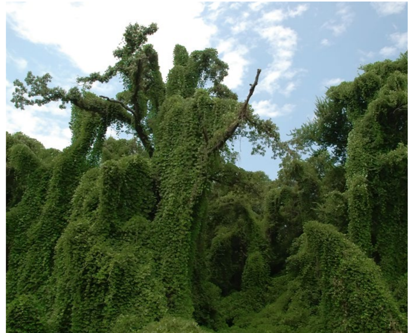
Kudzu, a climbing plant native to Asia, overgrows local vegetation in the United States.

To correctly estimate the risk of invasiveness, it is important to also take into account the area of origin of the crop. Maize, for example, was introduced from South America. In our region, there is no wild maize. Therefore, there is no risk whatsoever of GM maize influencing the natural maize populations in Europe. The same applies to potatoes and other crops from other continents. In countries such as the United States, Argentina, and Brazil with considerable soy plantations, again there are no wild soy varieties, because the plant originally came from Asia.