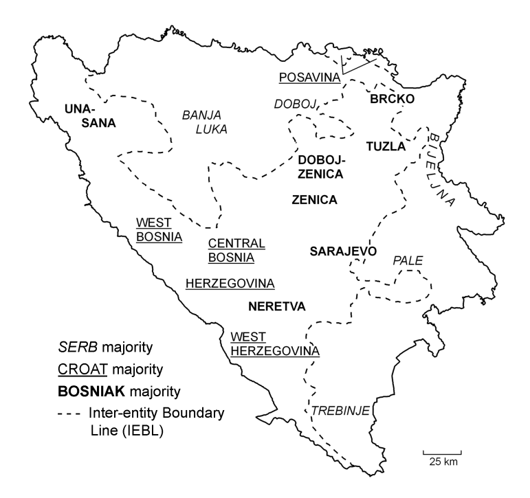
Fig. 2. Sample regions in Bosnia-Herzegovina.

negative, attitudes presumably linked to the fact that it institutionalized two and not three entities.