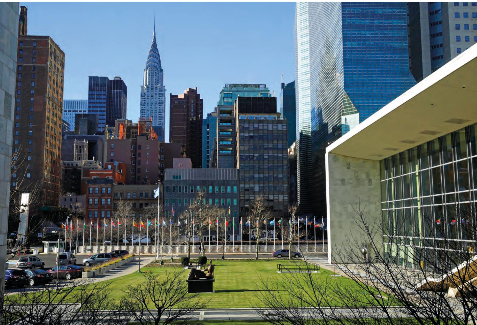
United Nations Headquarters, New York