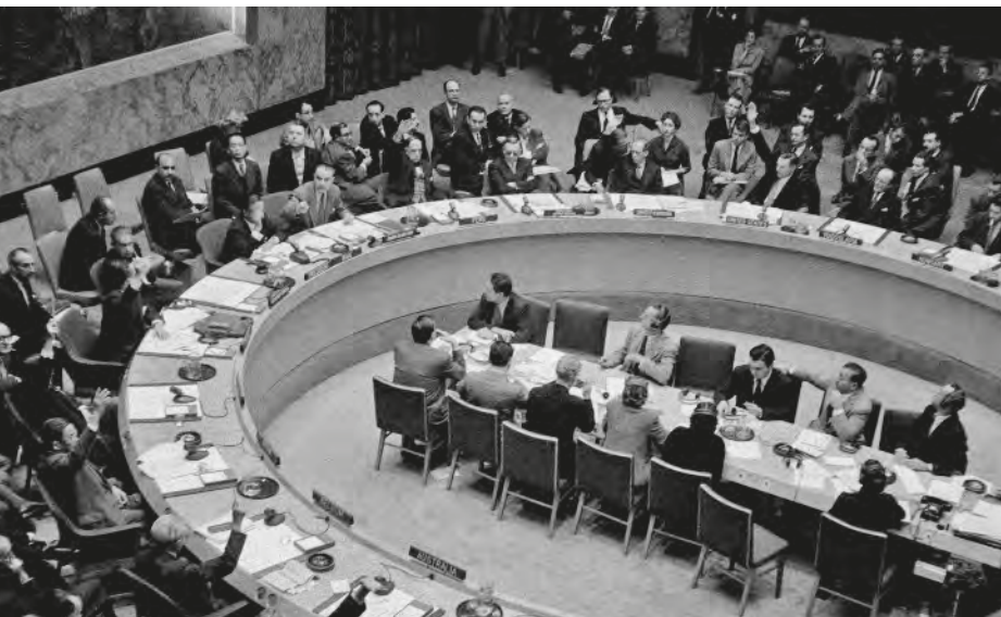
On November 4, 1956 the Security Council voted on the Hungarian Question.