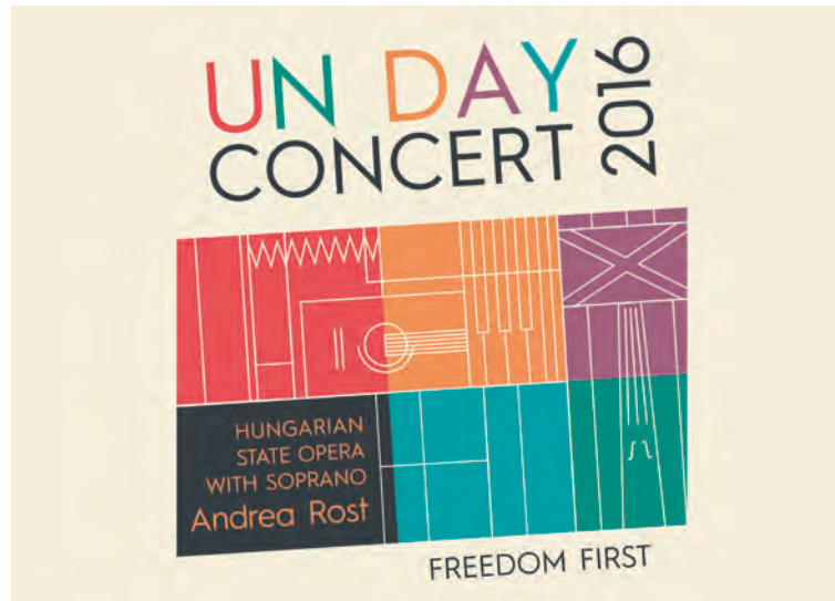
Designed by the Graphic Design Unit, Department of Public Informations, United Nations

UN Day gala concerts celebrate and reflect the work of the United Nations through the universal language of music. It is a great honor for the Permanent Mission of Hungary to co-host the UN Day Gala Concert in 2016.