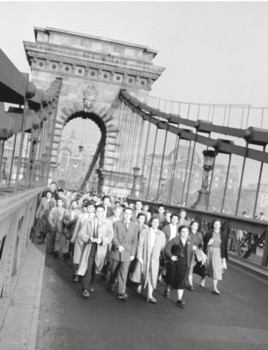
Budapest, October 23, 1956 March on the Chain Bridge

statements, such as “Summary and Conclusions” or “The Findings.” Accordingly, instead of conventional procedures of material collection for data analysis and hypothesis testing. I seek to decipher, unravel and resolve the progression, the evolution and even anterior information bundles. The events and facts of causation that spread illumination and disseminate insight.