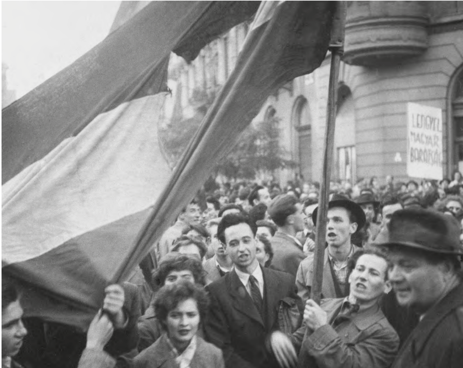
Budapest, October 23, 1956 Hungarian flag with a hole in the middle, the symbol of the Revolution.