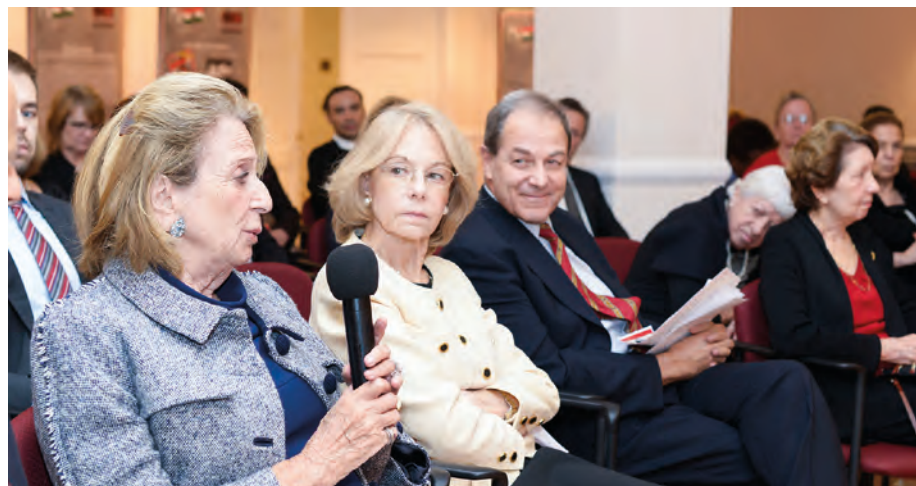
Interactive dialogue.

SPEAKER1 (commenting from the audience): I would like to ask something, if I may. I arrived in the US two years before all this happened. At the time, however, the way we all saw it was that the Americans had promised assistance to the Hungarians and they let them down. I remember telegrams sent to President Eisenhower requesting he do what had been promised. If he had, there would have been an entirely different outcome. I would love to hear your opinion of what you think would have happened if they really had kept their words?