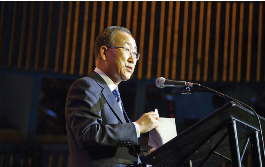
H.E. Ban Ki-moon at the UN Day Concert on October 24, 2016.

“This year’s observance of the United Nations Day occurs at a time of transition for the world and for the United Nations.