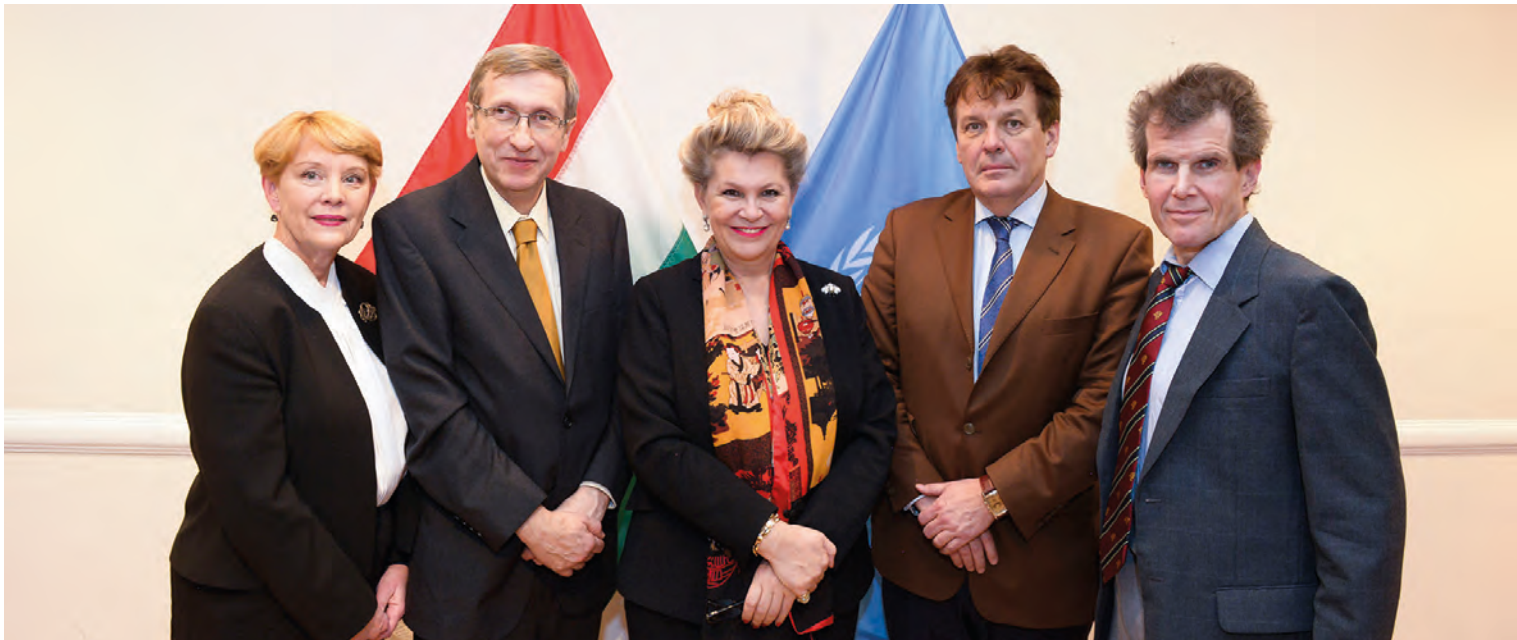
Members of the Panel Discussion.