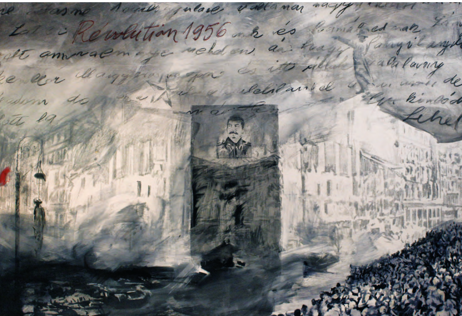
Prise de Conscience by Lehel Ürményi-Hamar