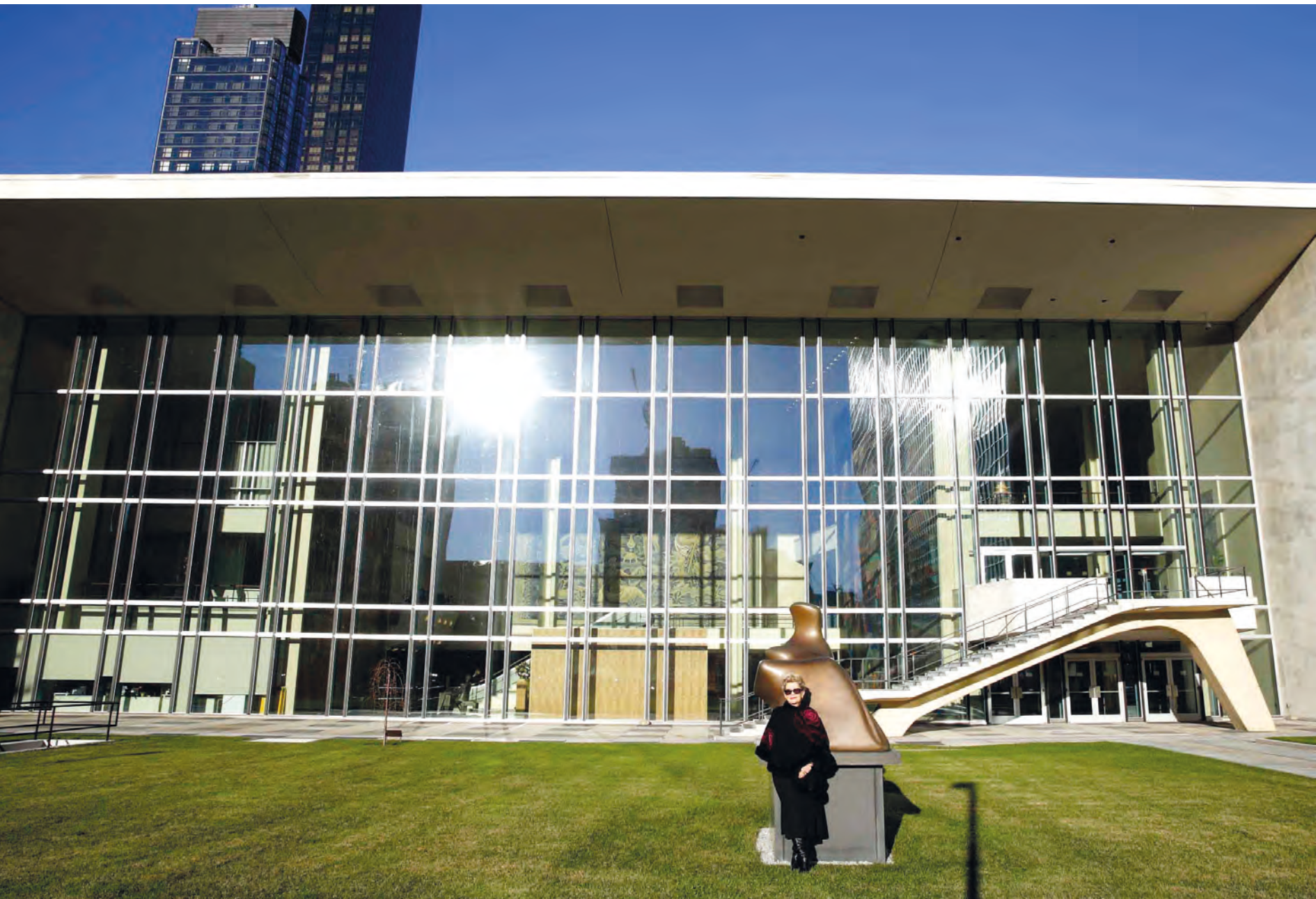
General Assembly Building United Nations Headquarters, New York