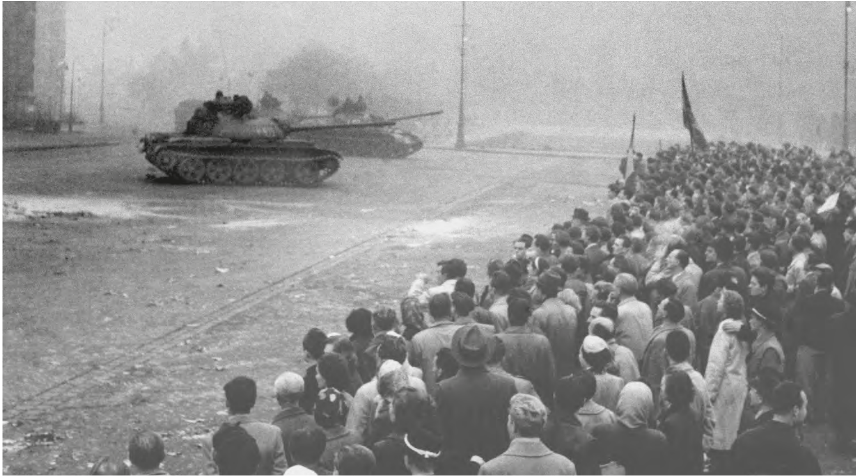
Budapest, October 23, 1956 Peaceful protesters in front of the Hungarian Parliament.

What kept motivating detailed scrutiny and elaborated descriptions were the surrounding situations, and by all means, the immediate background. The Committee, composed of ambassadors representing countries on each of the five continents, brought together intellectuals of geopolitical competence.