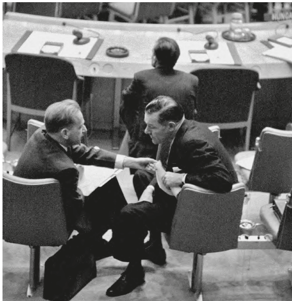
On November 3, 1956, UN Secretary-General Dag Hammarskjöld conferred with the U.S. representative, Henry Cabot Lodge, as the Security Council debated the Hungarian situation.

It was particularly painful for the Hungarians to compare the inaction of the UN in Hungary with its effective actions in the Suez at the very same time. The Soviet military machine was addressed by the UN rhetorically, while in the Suez, a whole army was organized in no time and shipped to the crisis location. The conflict in the Middle East was solved both politically and militarily, even though two members of the Security Council, Britain and France, were involved, unlike in the crisis in the middle of Europe. Hungary was in the Soviet bloc and