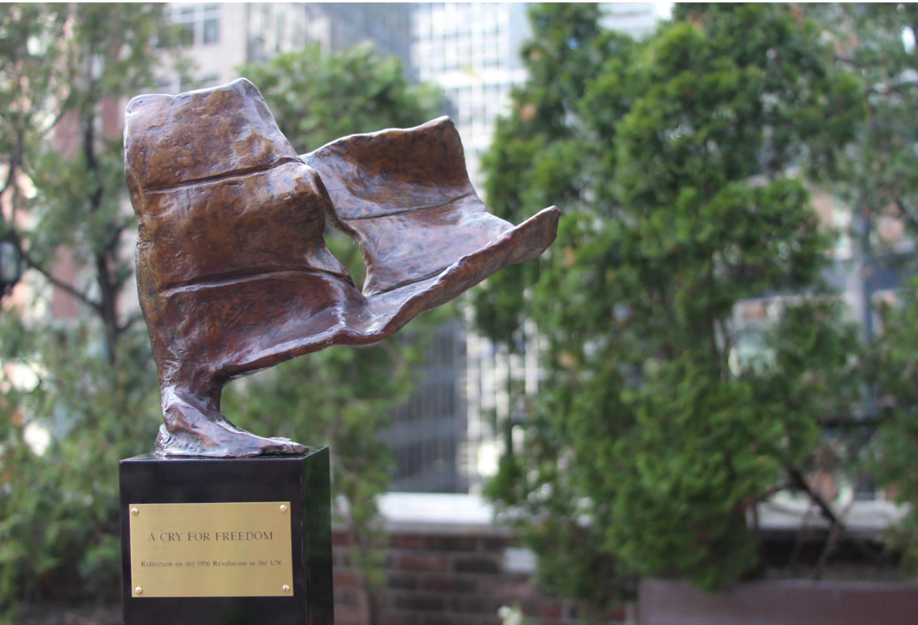
A CRY FOR FREEDOM: the Statue.