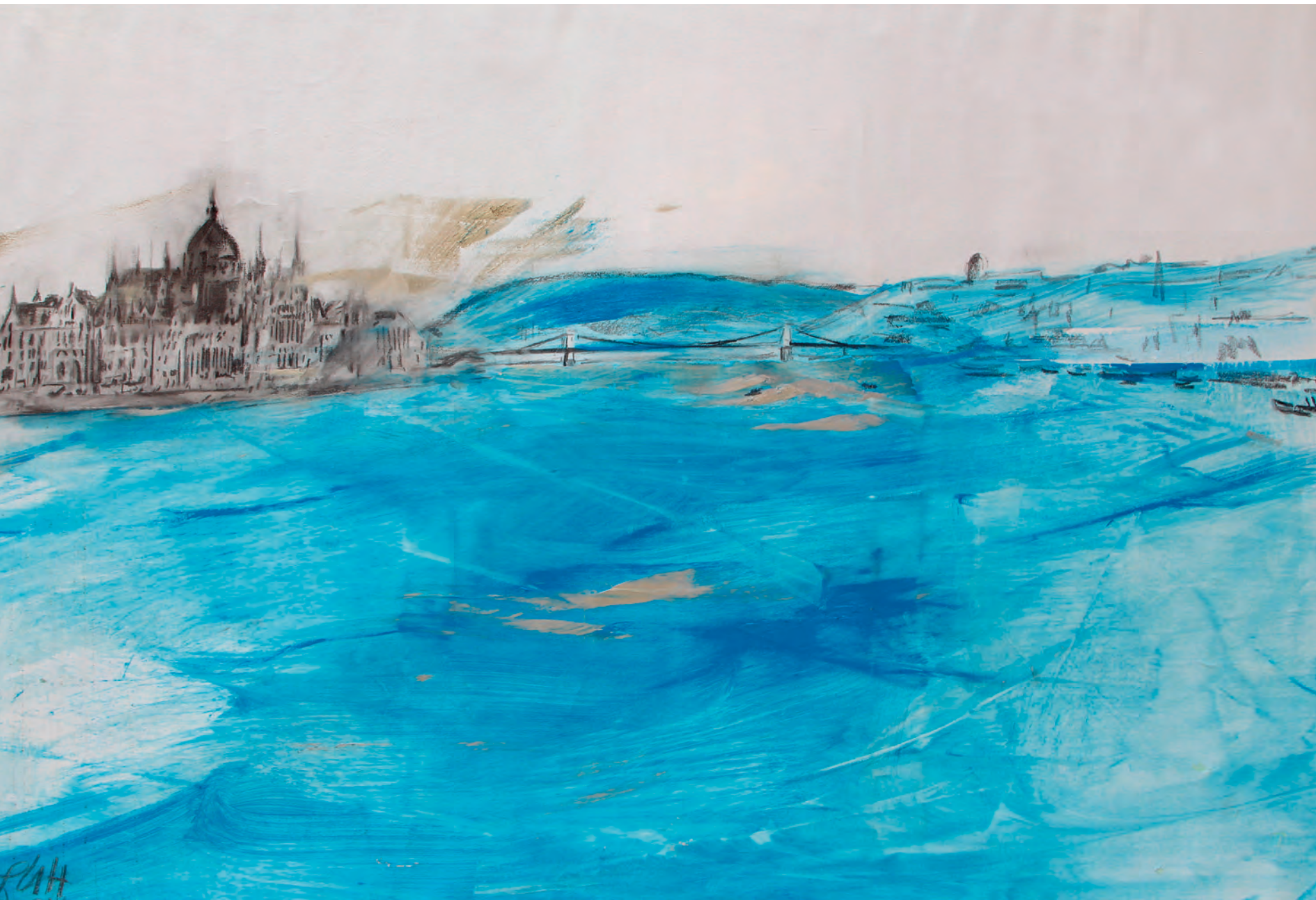
Budapest by Lehel Ürményi-Hamar