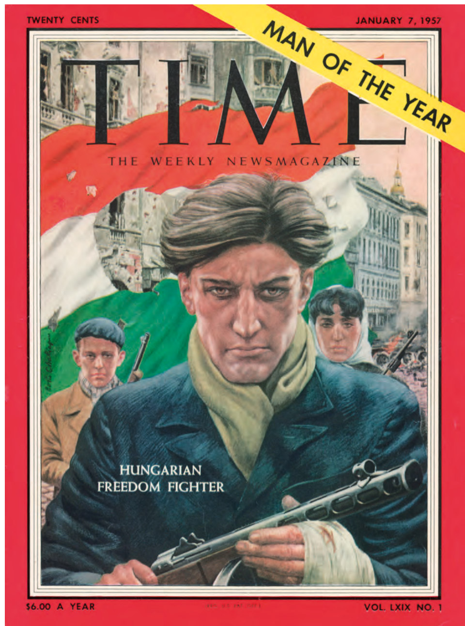
TIME Cover © 1957 Time Inc. TIME and the Red Border Design are trademarks of Time Inc., registered in the U.S. and other countries. Used with permission.