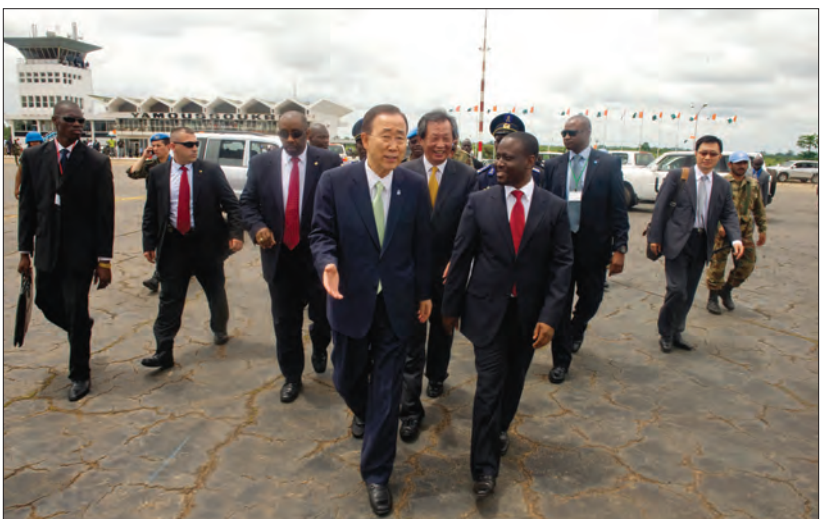
Secretary-General Ban Ki-moon arrives at Yamoussoukro Airport to attend the inauguration ceremony for Alassane Ouattara, president of Côte d'Ivoire, 21 May 2011. He was met at the airport by Prime Minister Guillaume Soro.

Subsequently, on 30 March, in the face of the hostile operating environment and the widespread use of violence against civilians and peacekeepers, the Security Council granted UNOCI a more robust and deterrent posture, through Resolution 1975, by authorizing it to prevent the use of heavy weapons against the civilian population. The resolution also imposed sanctions on Gbagbo and his associates.