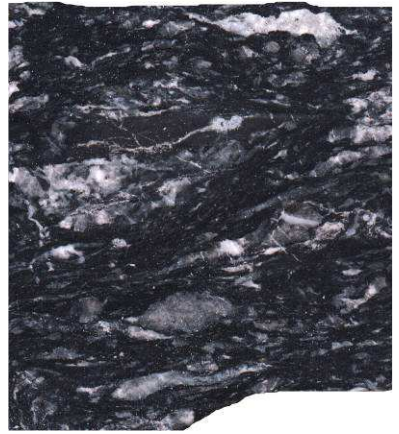
Figure 3. Hand sample showing a gneiss texture with melanocratic bands, compose by white micas, and leucocratic sectors domain by quartz and feldspars, and affected by metamorphism.

They are mainly composed of quartz and alkali feldspars which sizes ranging from 0.2 to 1.4 millimeters. In some samples quartz ribbons usually appear following the foliations of the rock. Garnets, zircons and opaque minerals only occur as subordinated species.