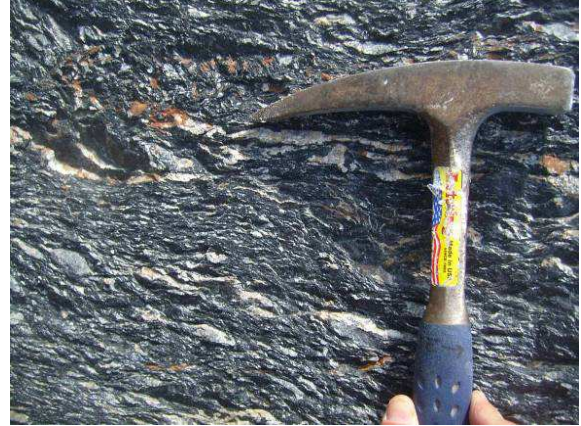
Figure 2. The outcrop shows a gneiss texture affected by weathering on the surface (orange patch), affecting the leucocratic minerals and was affected by glacier erosion and plucking.

The outcrops show sedimentary heterolitic units that could be assigned to turbiditic sequences, and are strongly affected by isoclinal folding. The studied samples display different metamorphic degrees. Most of them can be classified as gneiss or schist due to their macroscopic textures (Figure 2 and 3).