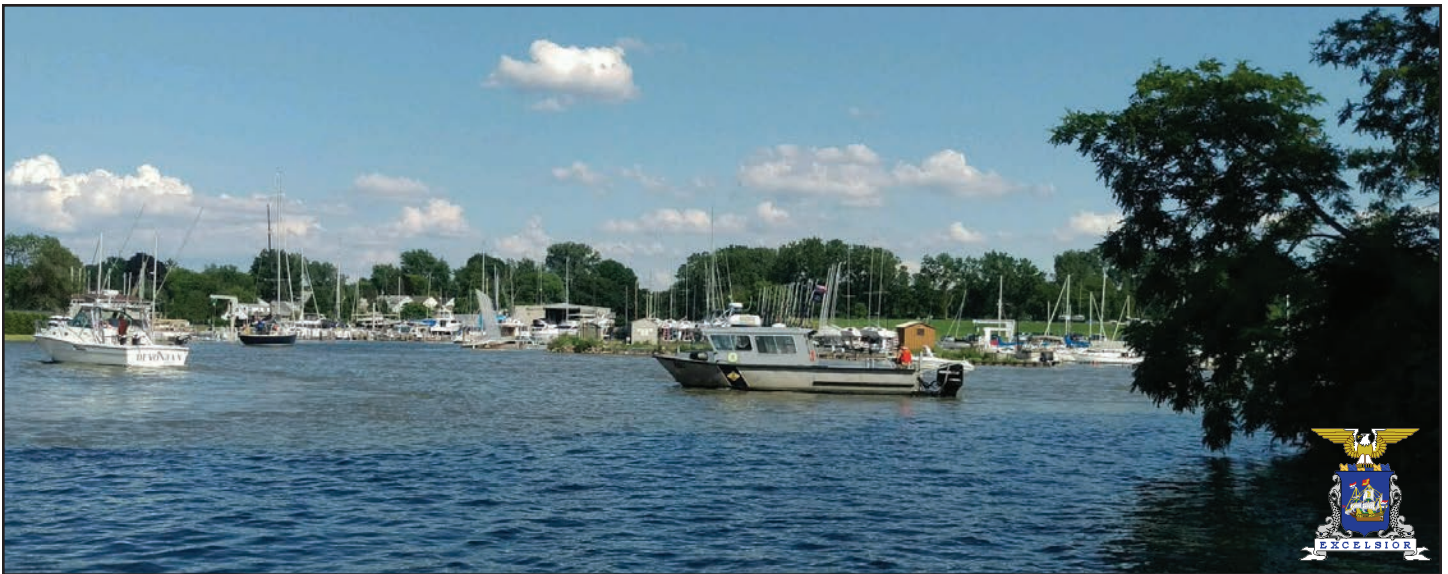
GREECE, N.Y. -- New York Naval Militia Patrol Boat 280 heads out onto Lake Ontario on a presence patrol here July 2, 2017. Two boats and crews were dispatched to make pleasure boaters aware that they should reduce speeds in areas adjacent to the shore line to prevent flooding. See our related story on page 12.