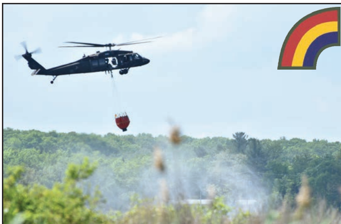
New York Army National Guard aircrew from the 3rd Battalion, 142nd Aviation prepare to fill a Bambi Bucket with water from Round Lake, N.Y., May 31, 2017. The aviators were conducting a slow pick-up in order to fill their bucket with as much water as possible.