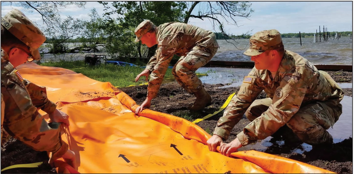
New York Army National Guard Soldiers deploy the Tiger Dam flood control system along the shores of Braddock Bay in the Town of Greece, N.Y. in response to rising waters on Lake Ontario. The system consists of flexible fabric tubes which are connected and filled with water. The tubes replace sandbags as a flood control mechanism.

Works. “We have also had teams going out into the field and building break walls.”