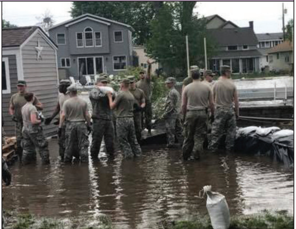
New York Army National Guard 105th Military Police Company Soldiers construct a sandbag barrier to protect property at Sodus Point, N.Y. from flooding due to rising waters on Lake Ontario on May 22.

Soldiers from the Army National Guard’s 642nd Aviation Support Battalion, the 105th Military Police Company, the 27th Infantry Brigade Combat Team and 427th Forward Support Battalion have supported the mission, along with members of the New York Air National Guard’s 107th Attack Wing and 174th Attack Wing. gt