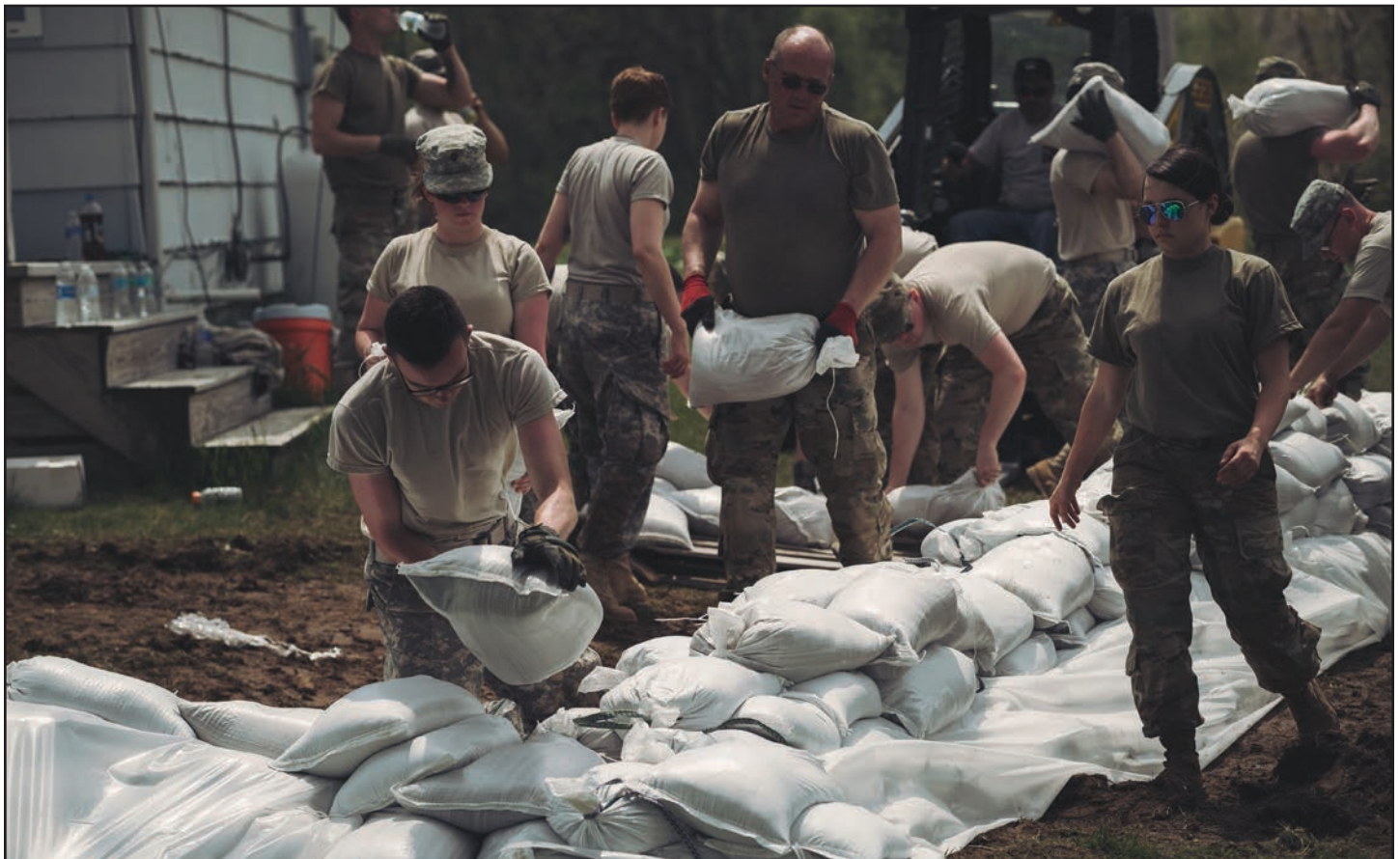
New York Army National Guard Soldiers emplace sandbag barriers along the Lake Ontario shoreline in Kendall, N.Y., on May 18 after rising water levels resulted in flooding and a state of emergency declared May 2 by Gov. Andrew Cuomo.