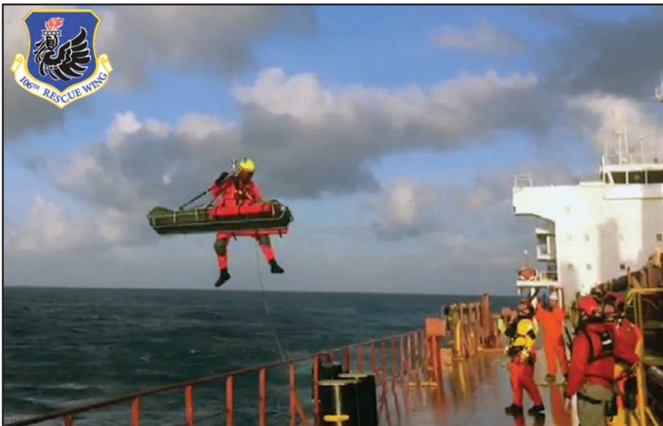
An airman from Esquadra 751, the Portuguese Air Force search and rescue organization, accompanies a litter carrying one of the injured Tamar crewman off the ship onto a hovering Merlin helicopter April 27, in the Atlantic Ocean after he and another badly burned sailor had been treated by members of the New York Air National Guard's 106th Rescue Wing for the past three days.

The HC-130 crew dropped two Zodiac boats into the water.