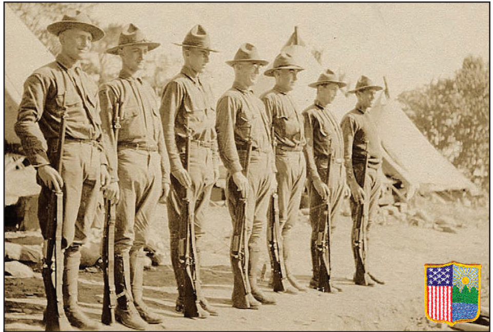
New York Guard members mount Guard near New Paltz, N.Y. in 1918.

By October 1917, Adjutant General Charles H. Sherrill recruited 10,600 men. Because all able-bodied men between 18 and 45 had to register for the draft, the New York Guard con-