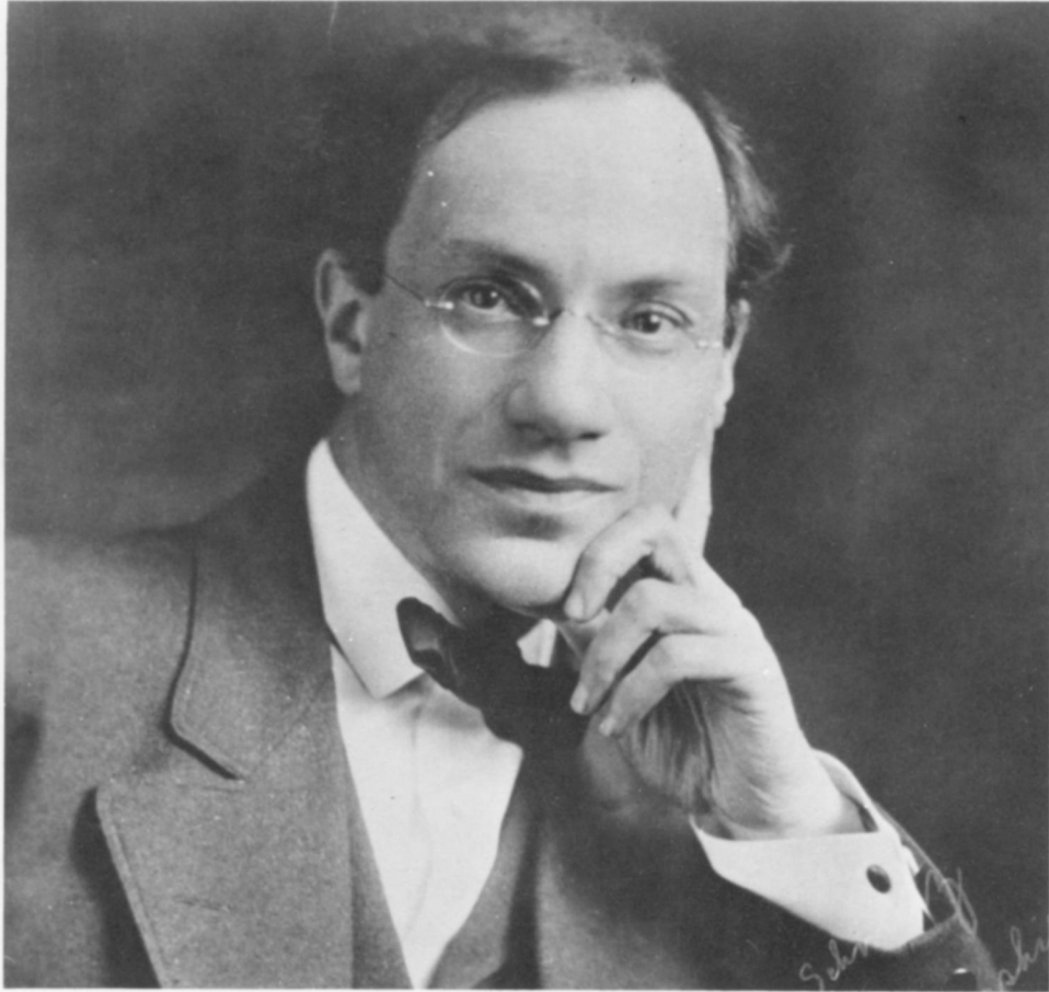
Raphael Zon as director of the Lake States Forest Experiment Station, ca. 1926.