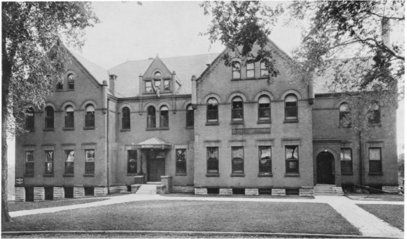
Original headquarters of the Lake States Forest Experiment Station at the University of Minnesota Farm in St. Paul.