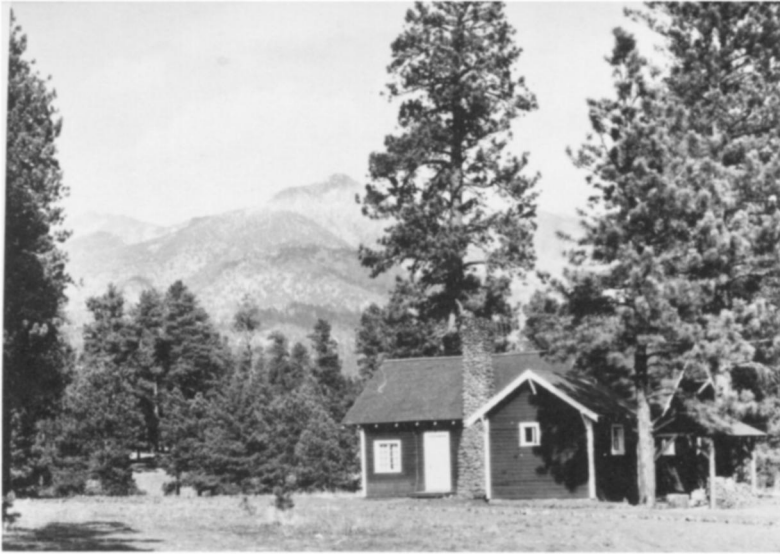
Fort Valley Experiment Station, Arizona, 1912.