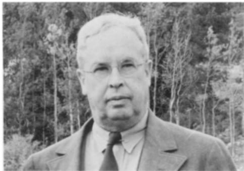
Acting Chief Earle H. Clapp, 1941.

dismiss out of hand presidential candidate Franklin D. Roosevelt's call for linking reforestation and soil conservation with reduction of unemployment. It was even feasible, Zon suggested to Silcox, that the experiment stations could alleviate the "white collar" unemployment problem by opening up positions for botanists, physiologists, and economists. Once the New Deal was launched, some branches of the Lake States Station were used as training grounds for Civilian Conservation Corps foremen assigned to forest work. Zon also worked with other New Deal agencies; he wrote, for example, a detailed set of criticisms of the Tennessee Valley Authority's plan for forest conservation work. 54