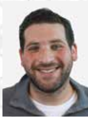
FRED KATZ NORMAN TRANSCRIPT