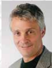
BERRY TRAMEL THE OKLAHOMAN