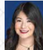
VIRIDIANA DIAZ VIDEO PHOTOGRAPHER & GRAPHICS EDITOR