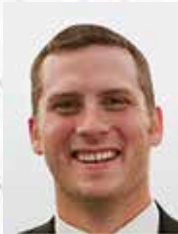
ROYCE YOUNG ESPN.COM