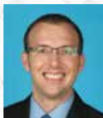
CLINTON CORLEY VIDEO PHOTOGRAPHER / EDITOR