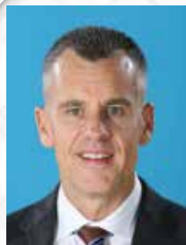
BILLY DONOVAN HEAD COACH