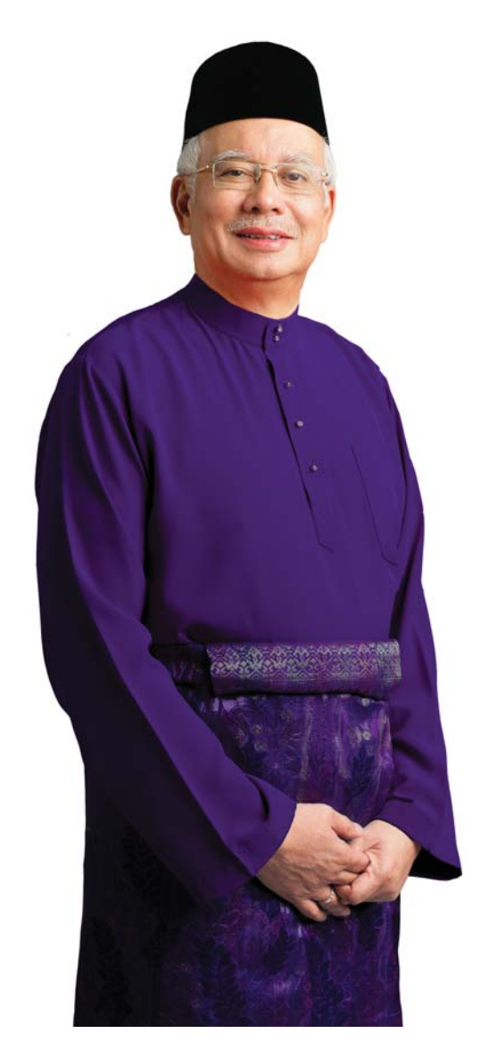
YAB Dato' Sri Mohd Najib Tun Haji Abdul Razak Prime Minister and Minister of Finance Malaysia