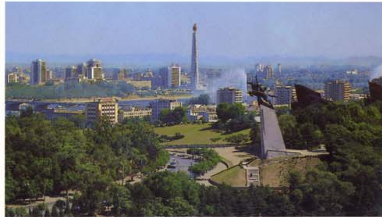
Korea Pictorial, Pyongyang, DPRK Juche 91(2002)