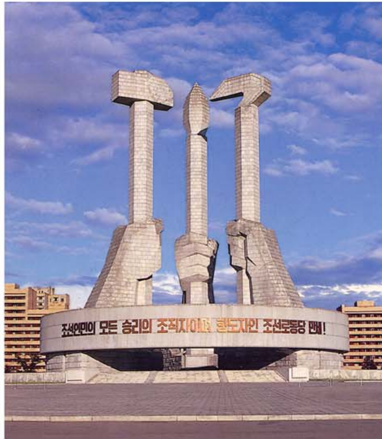
The Monument to Party Founding.

T he Monument to Party Founding was built to convey forever the great exploits accomplished by President Kim Il Sung in building a Juche-oriented revolutionary party. The grounds of the monument cover an area of over 250,000 square metres.