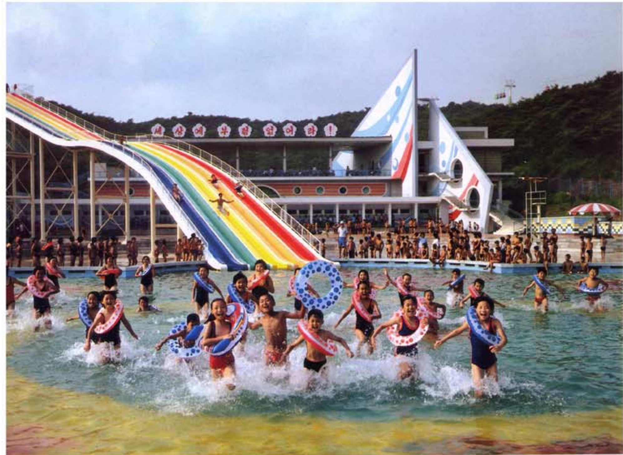
The Mangyongdae Swimming Pool.