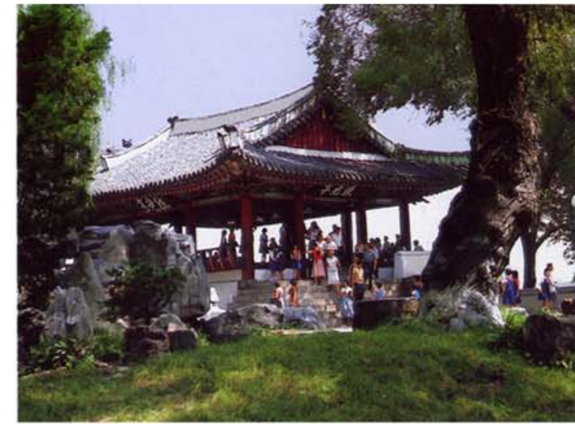
The Ryongwang Pavilion.

T he Taedong Gate on the banks of the River Taedong in the heart of Pyongyang is the eastern gate of the inner fort of the Walled City of Pyongyang. It was erected in the mid-6th century in the period of Koguryo.