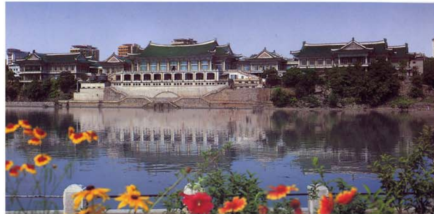
The Okryu Restaurant.

T he Okryu Restaurant on the banks of the River Taedong in the heart of Pyongyang and the nearby Okryu Bridge, which links the area to east Pyongyang, were completed in August Juche 49(1960).