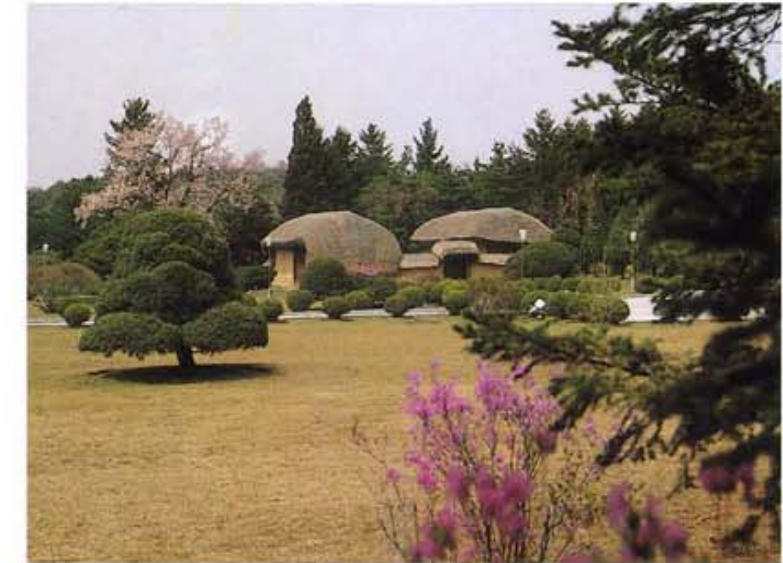
The Chilgol revolutionary site.

C hilgol is a historical site where President Kim Il Sung cultivated revolutionary ambitions during his childhood and the place where his mother, Kang Pan Sok, was born and spent her childhood.