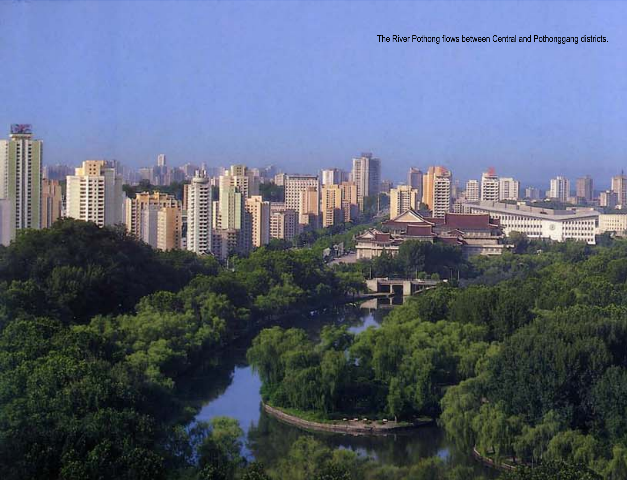
The River Pothong flows between Central and Pothonggang districts.