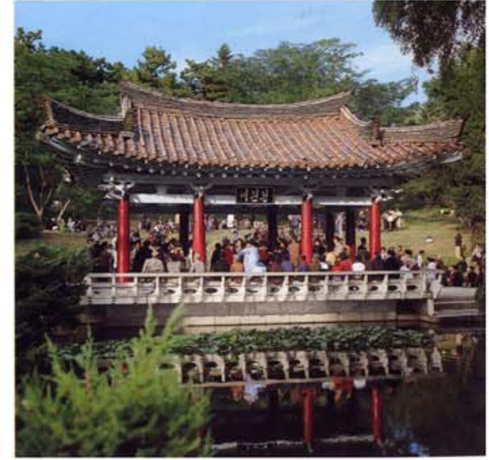
The Aeryon Pavilion.