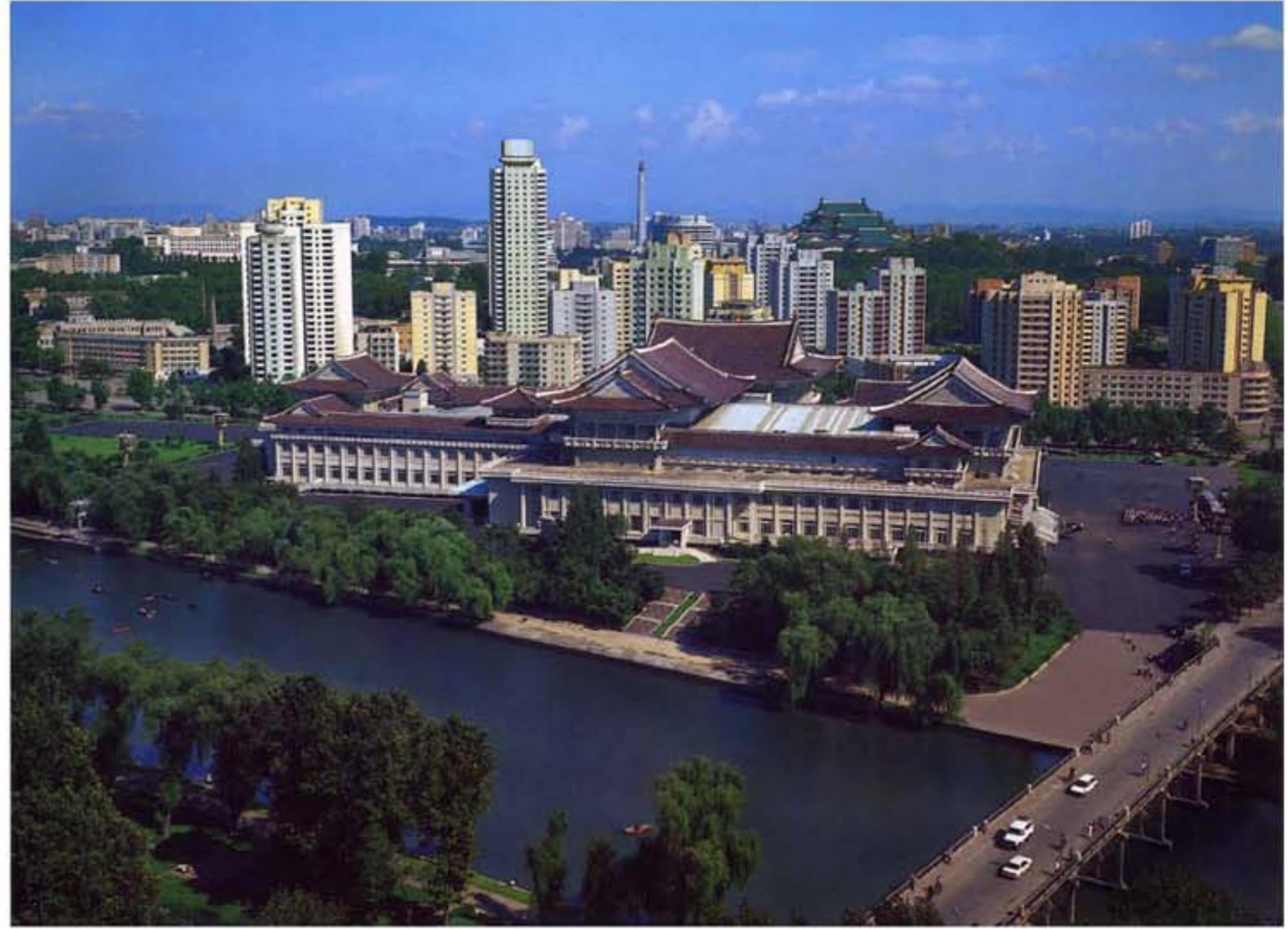
The People's Palace of Culture.