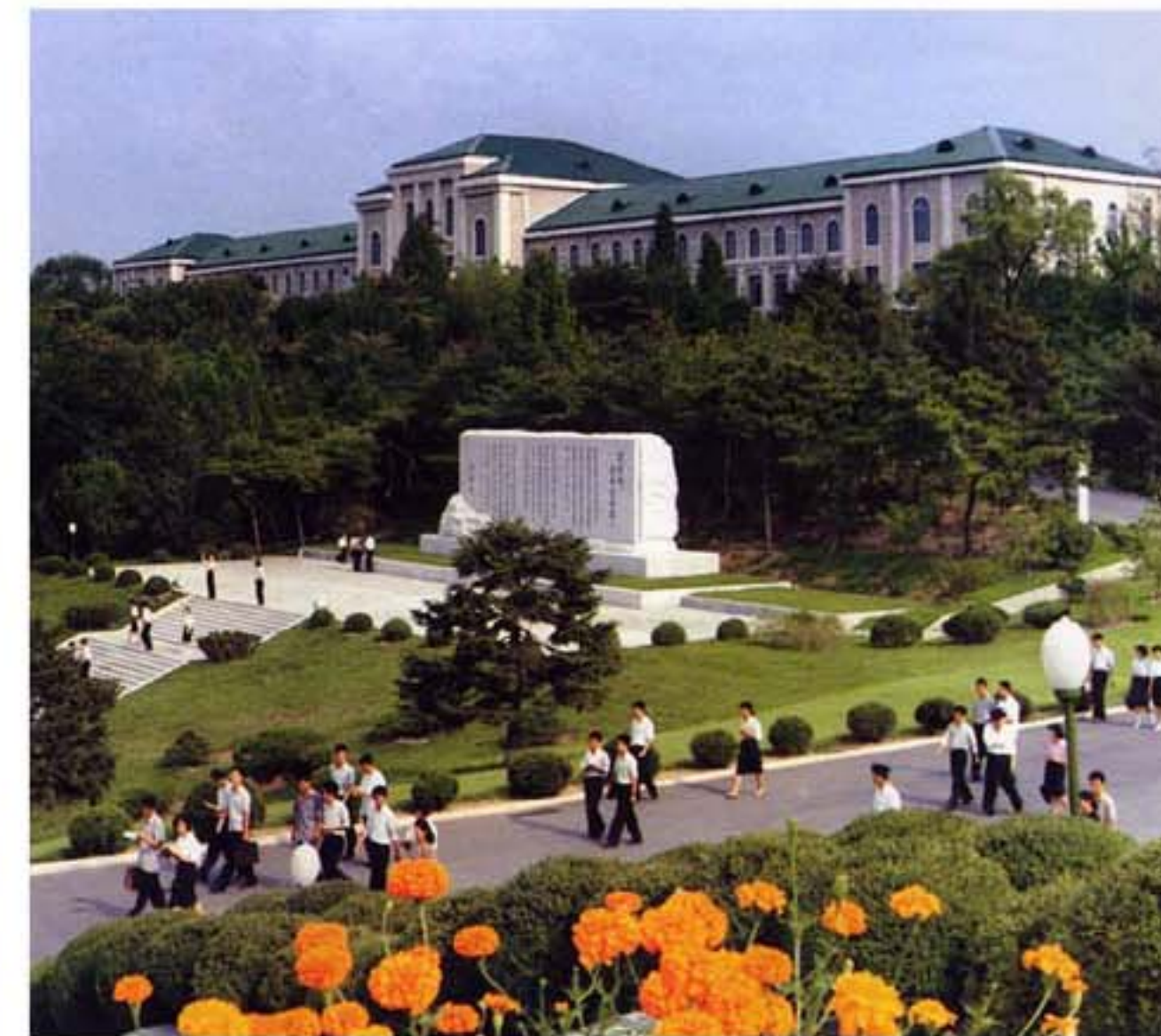
Kim Il Sung University.