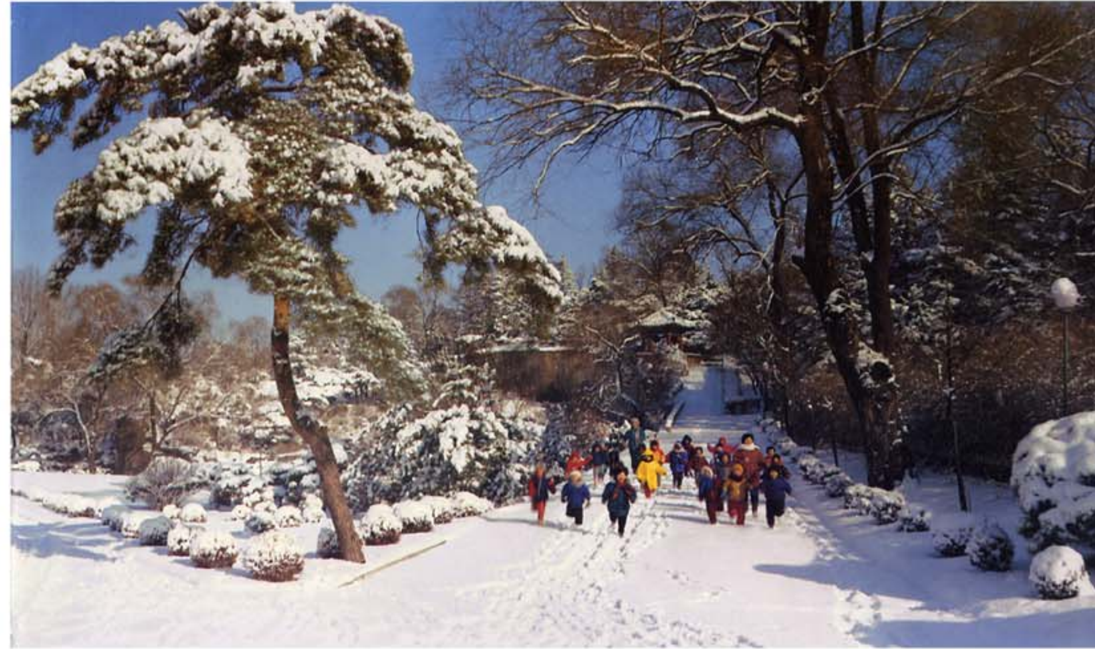
Moranbong Youth Park in winter.