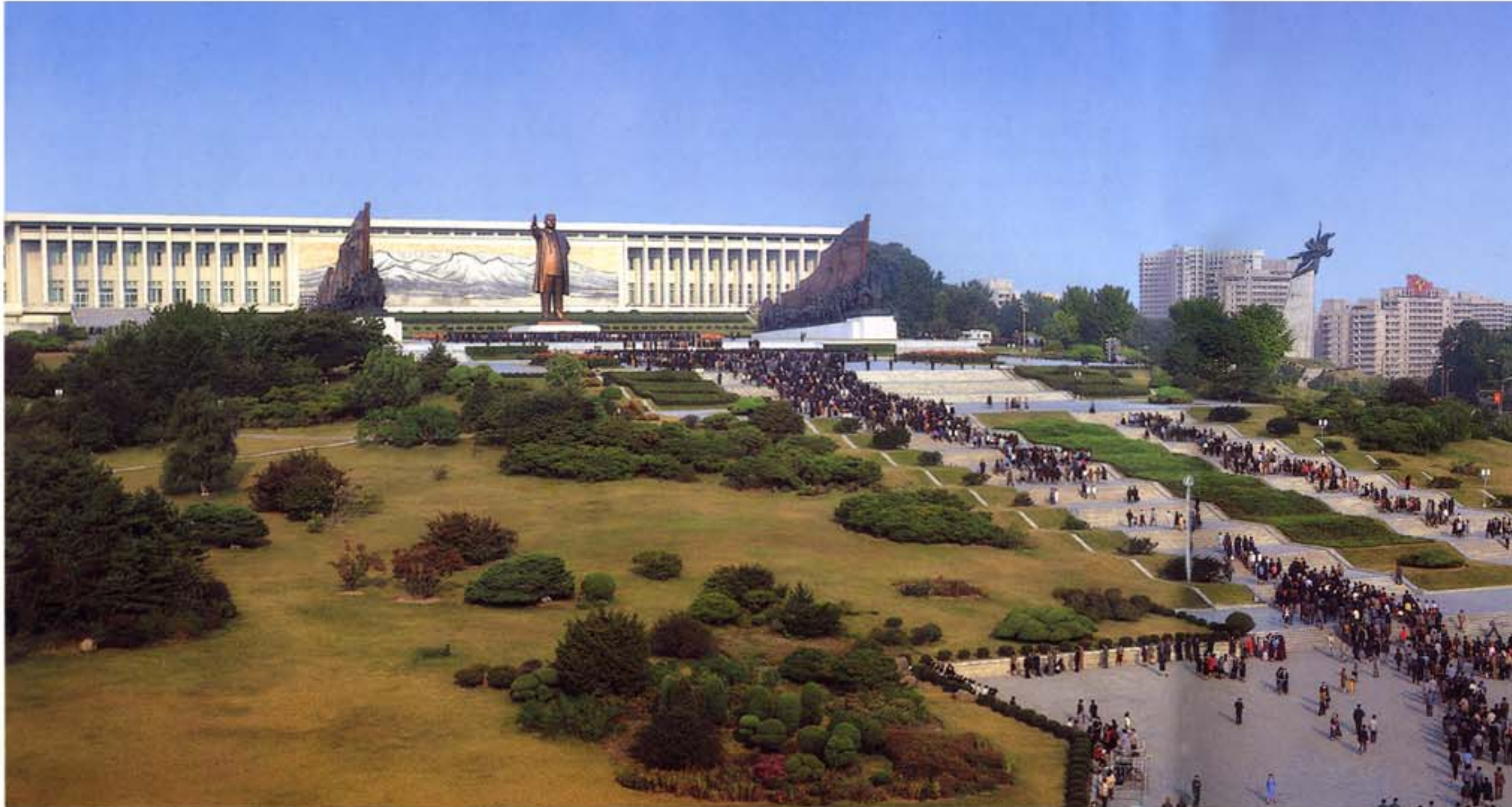
Mansu Hill, on which President Kim Il Sung's statue stands.

M ansu Hill, dear to the hearts of the Korean people, is in the center of Pyongyang.