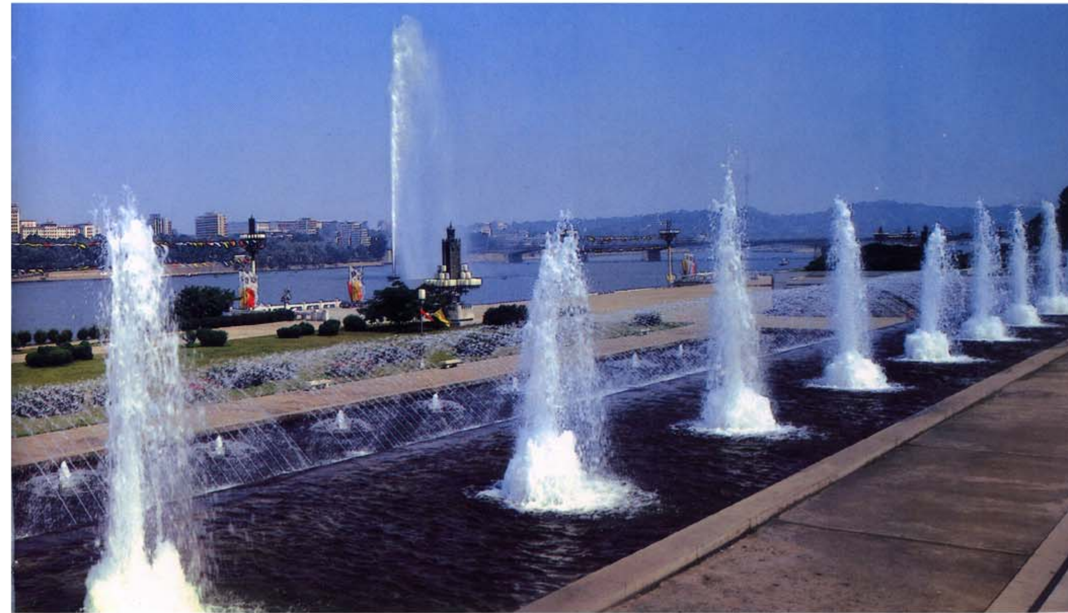
The park and fountains around the Tower of the Juche Idea.