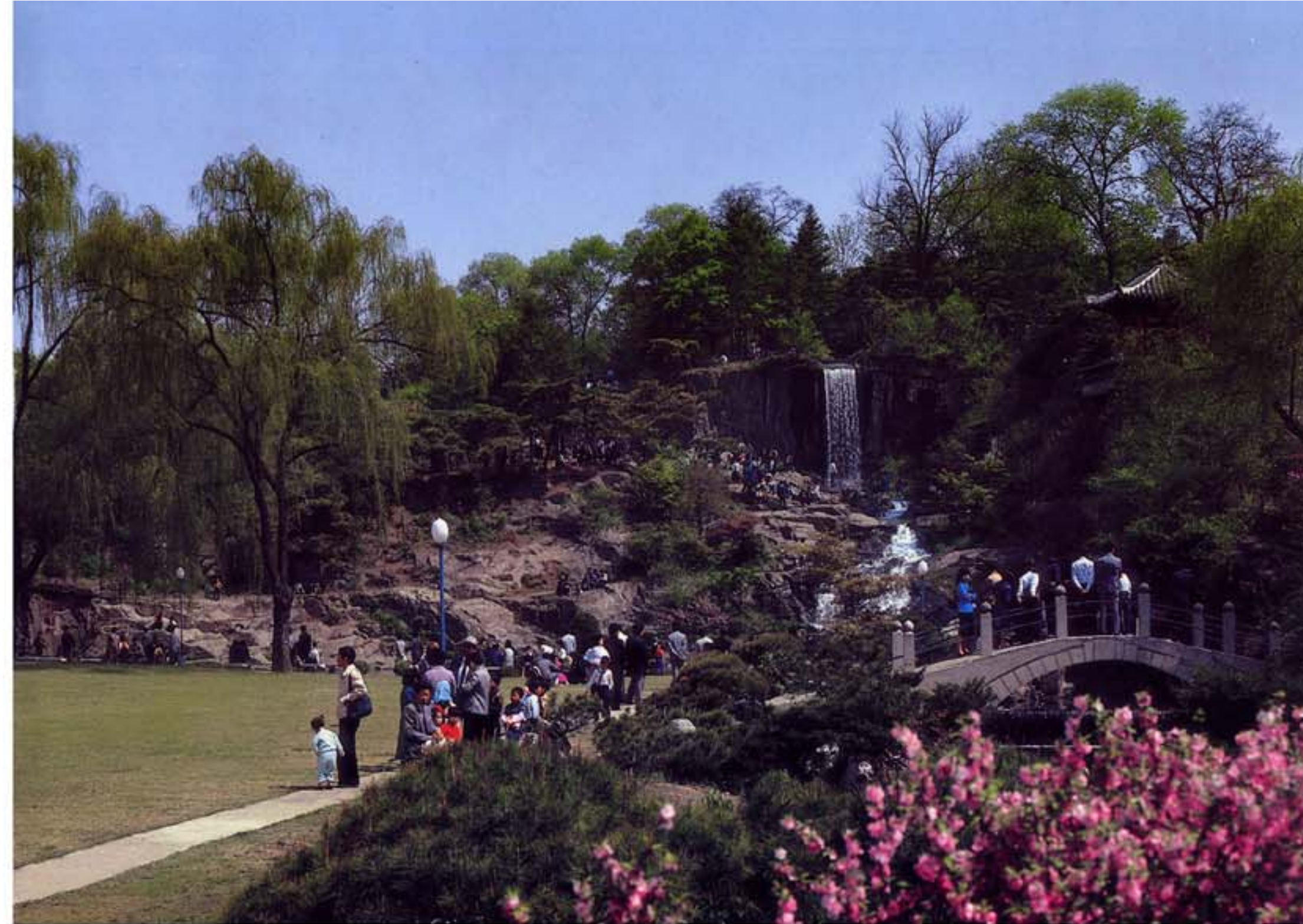
Moranbong Youth Park.