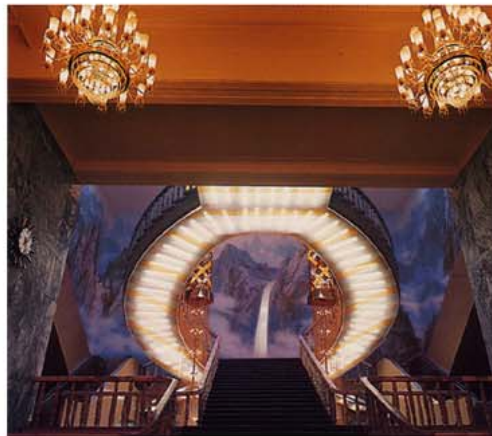
Circular staircases in the theatre.