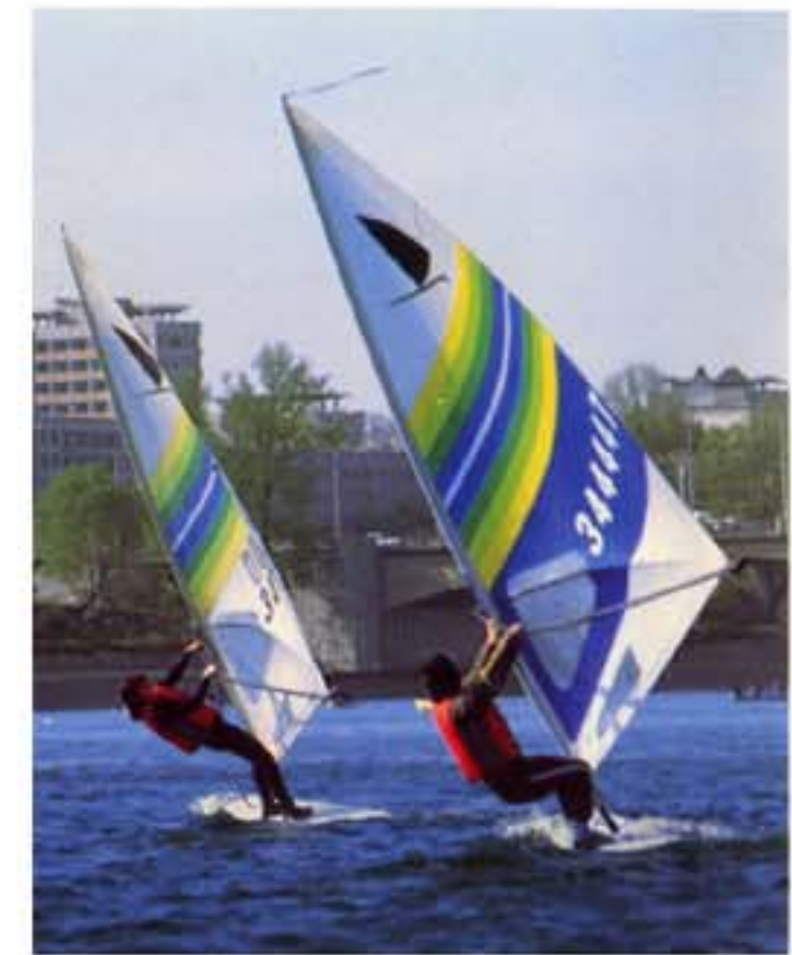
Boating on the River Taedong.