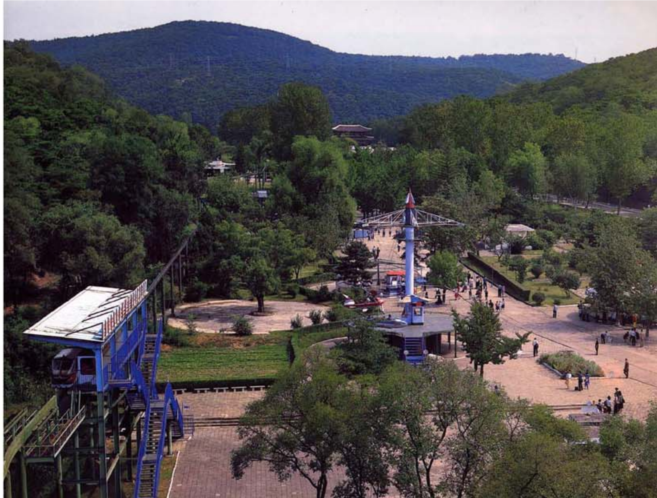
The Taesongsan Pleasure Park.

The park provides an excellent range of modern amusement facilities and various public service facilities.