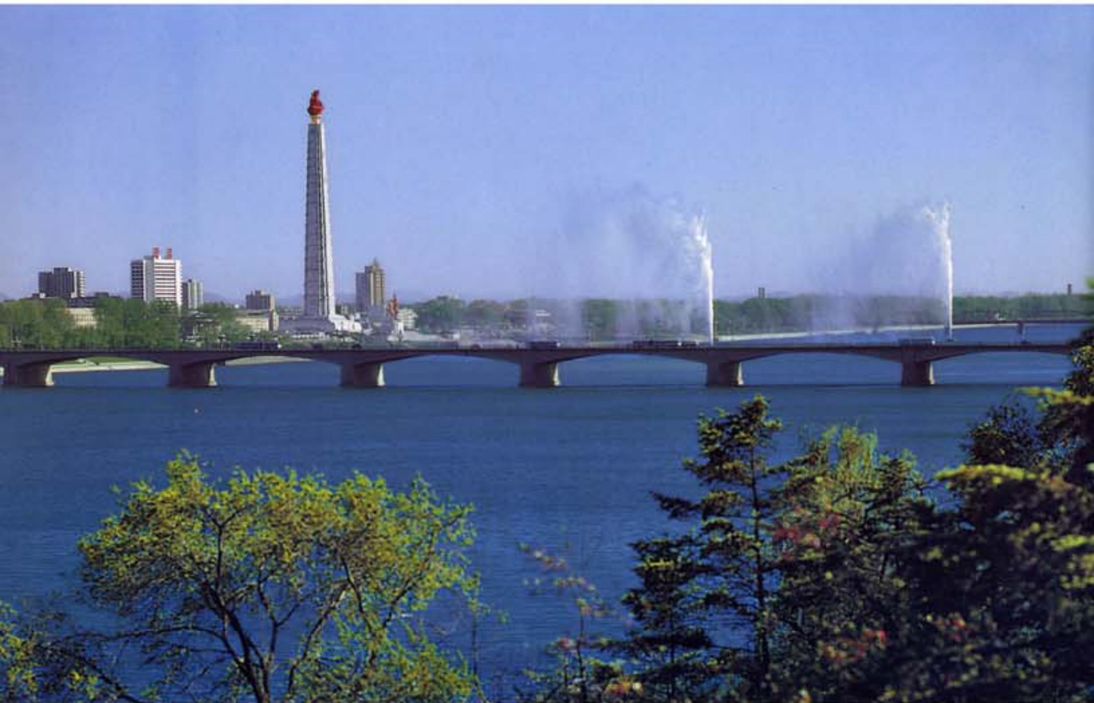
The Okryu Bridge.