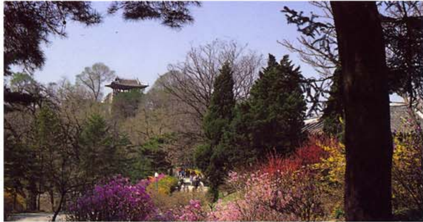
The Ulmil Pavilion in spring.