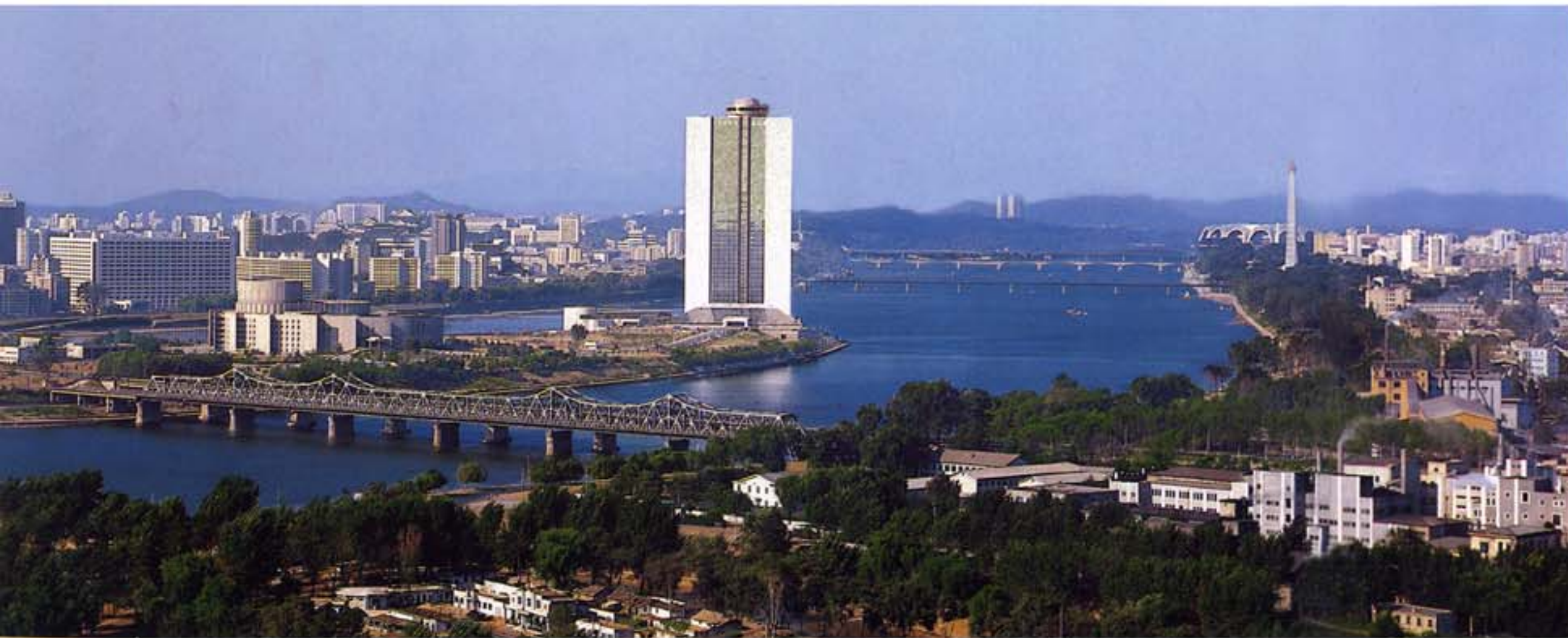
The River Taedong flows through the centre of Pyongyang.

The River Taedong has flowed together with the trying history of Korea. Under the wise guidance of President Kim Il Sung and leader Kim Jong Il after the liberation of the country it has turned into a beautiful river giving