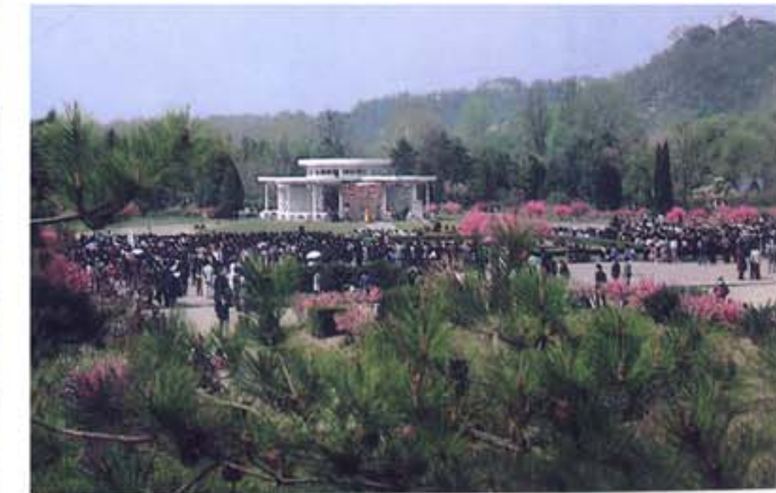
The Rungnado Pleasure Park.

Under the energetic guidance of leader Kim Jong Il, the island has become a place resembling a giant flower basket floating on the river and a major recreation centre.