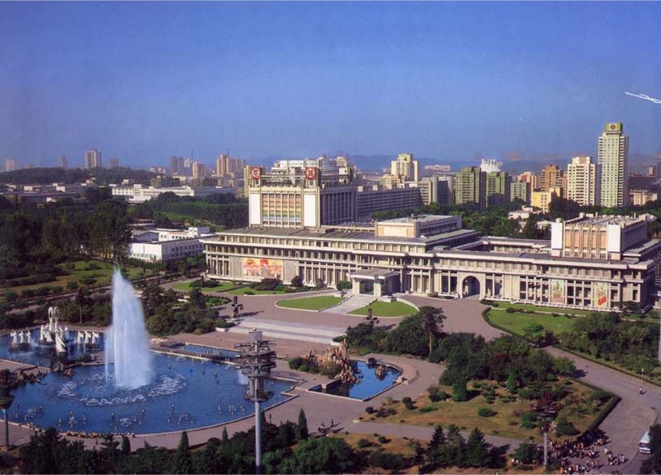
The Mansudae Art Theatre and the fountain park.