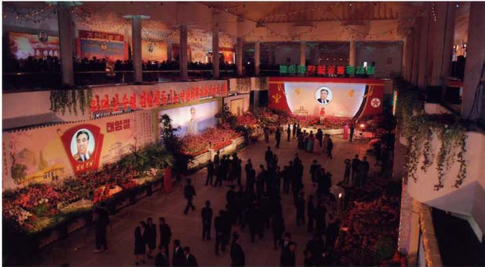
The Fourth Kimilsungia Show.