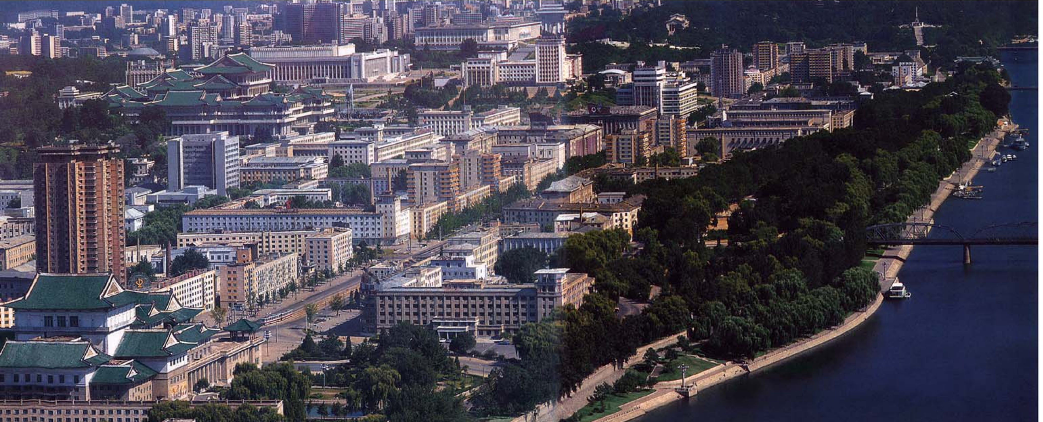
Partial view of Central District.