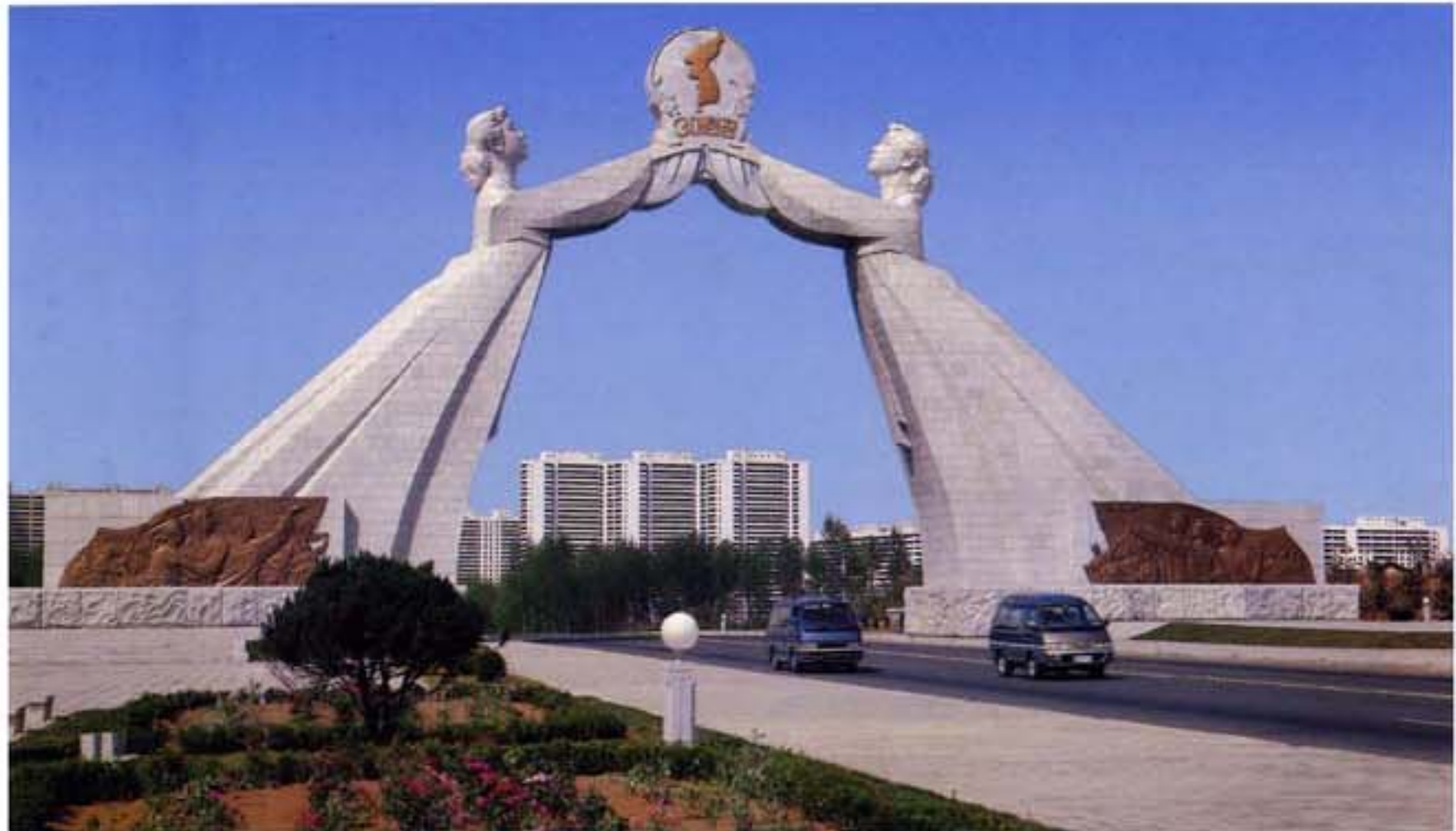
Monument to the Three Charters for National Reunification.