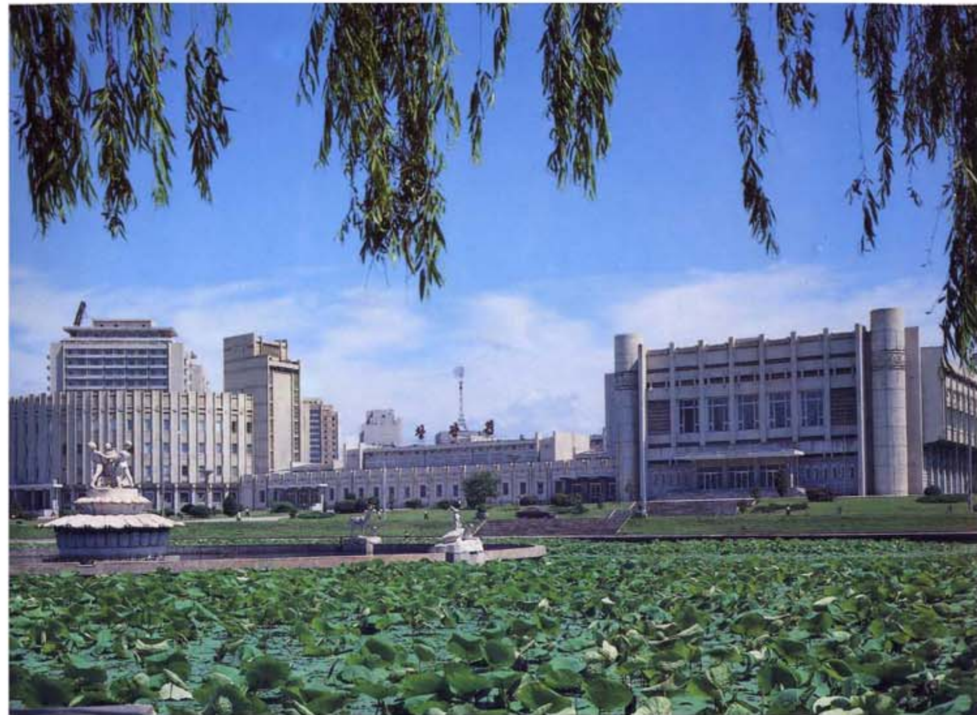
The Changgwang Health Complex.