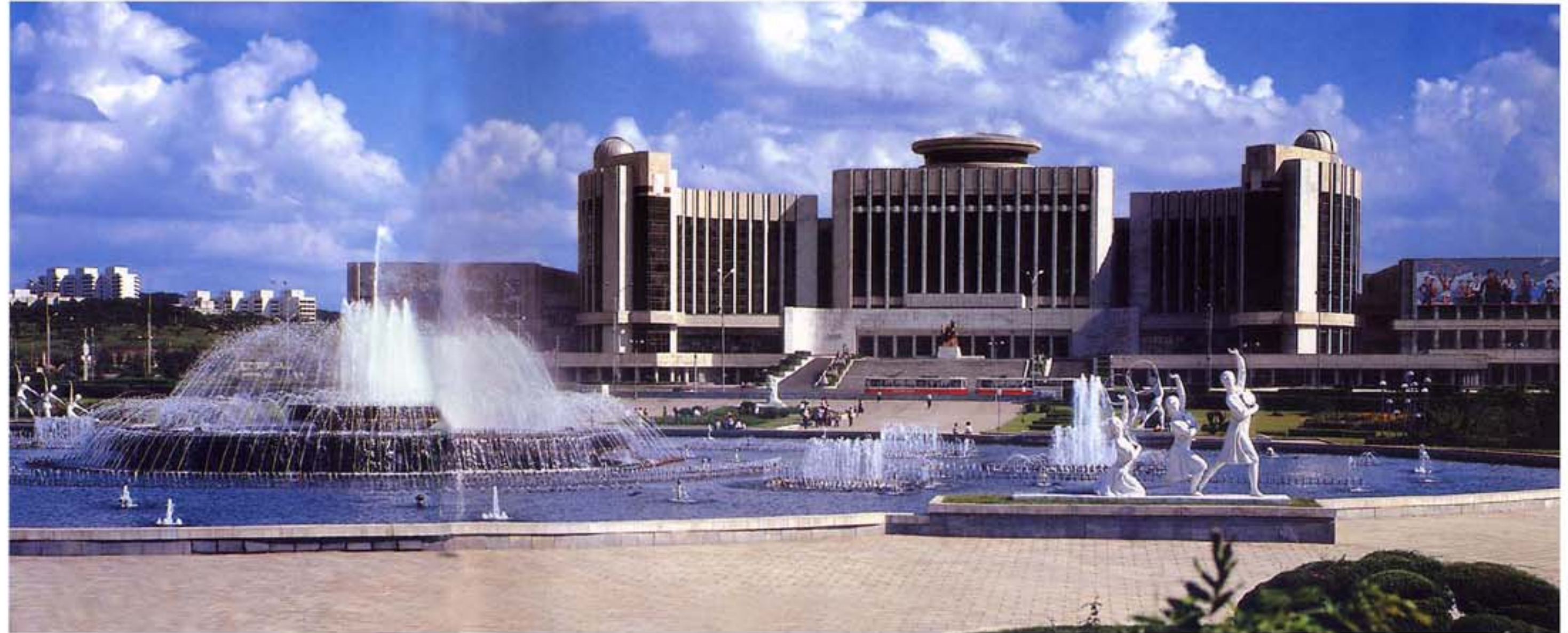
The Mangyongdae Schoolchildren's Palace.