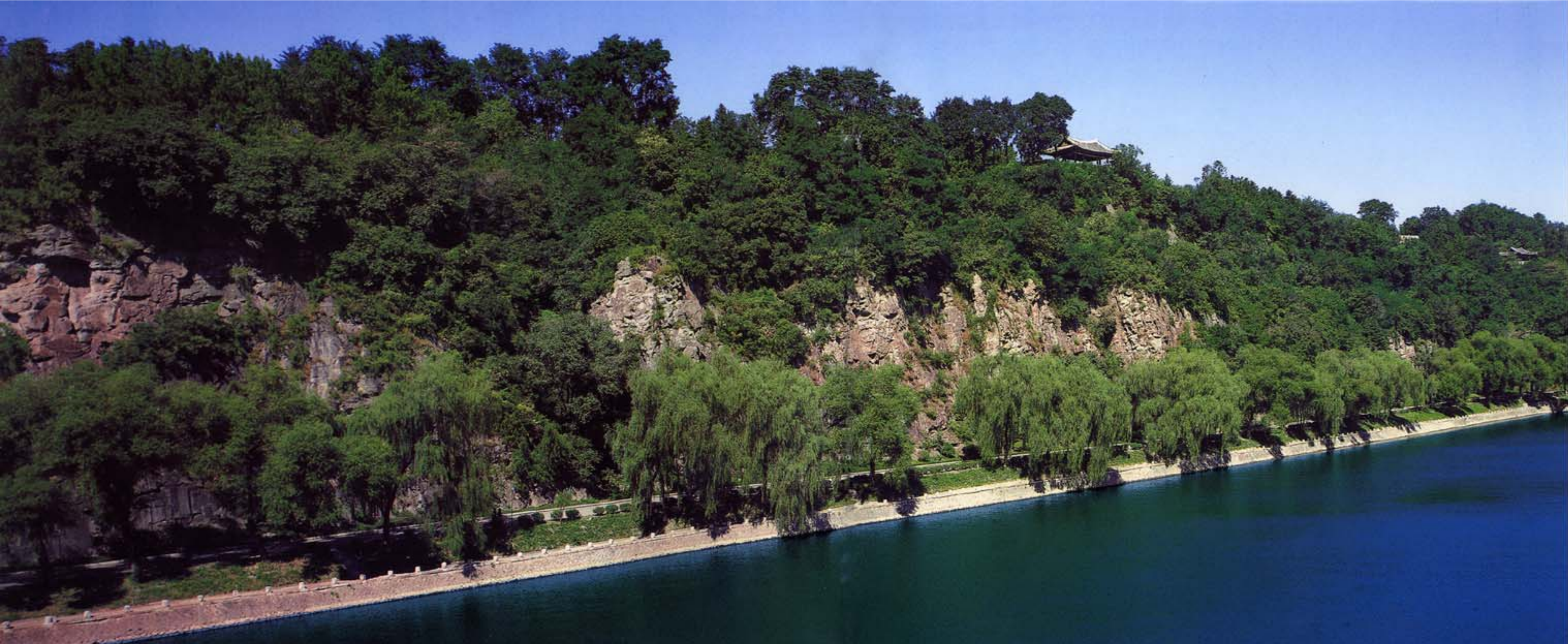
Chongryu cliff of Moran Hill.