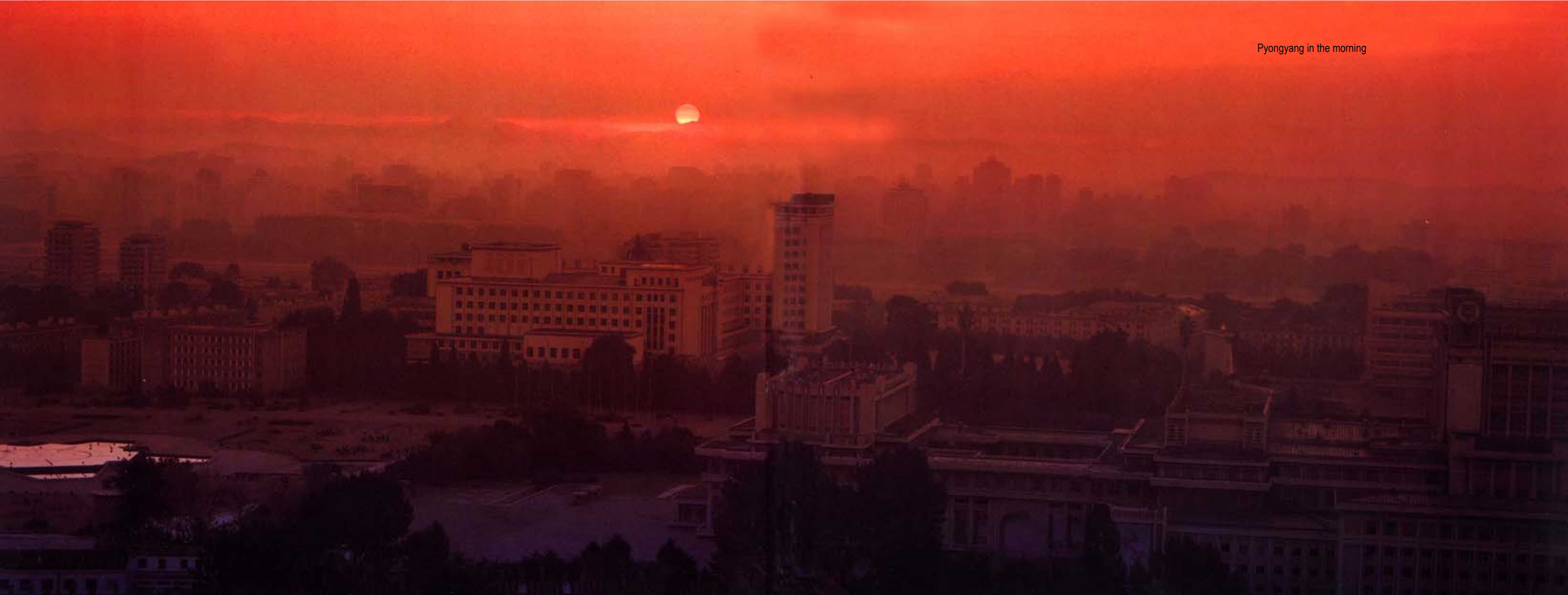
Pyongyang in the morning