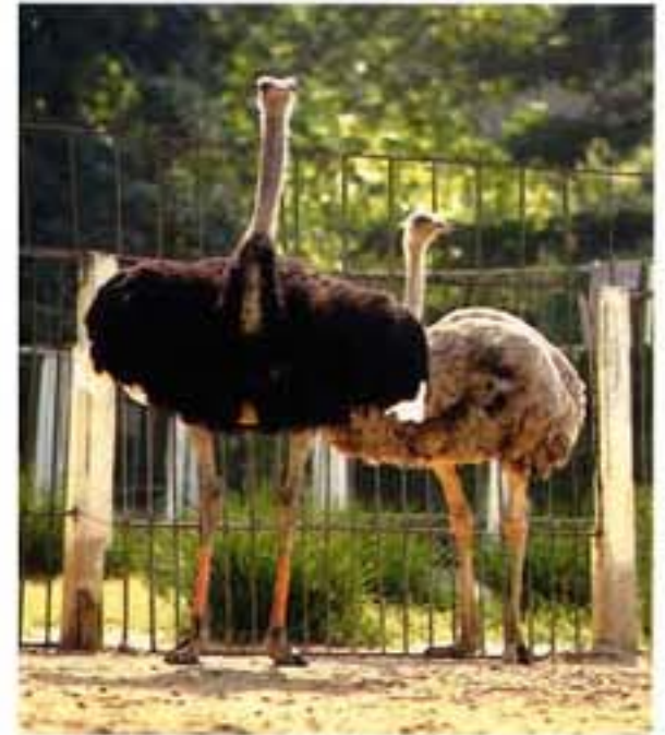
Some of the animals at the zoo.