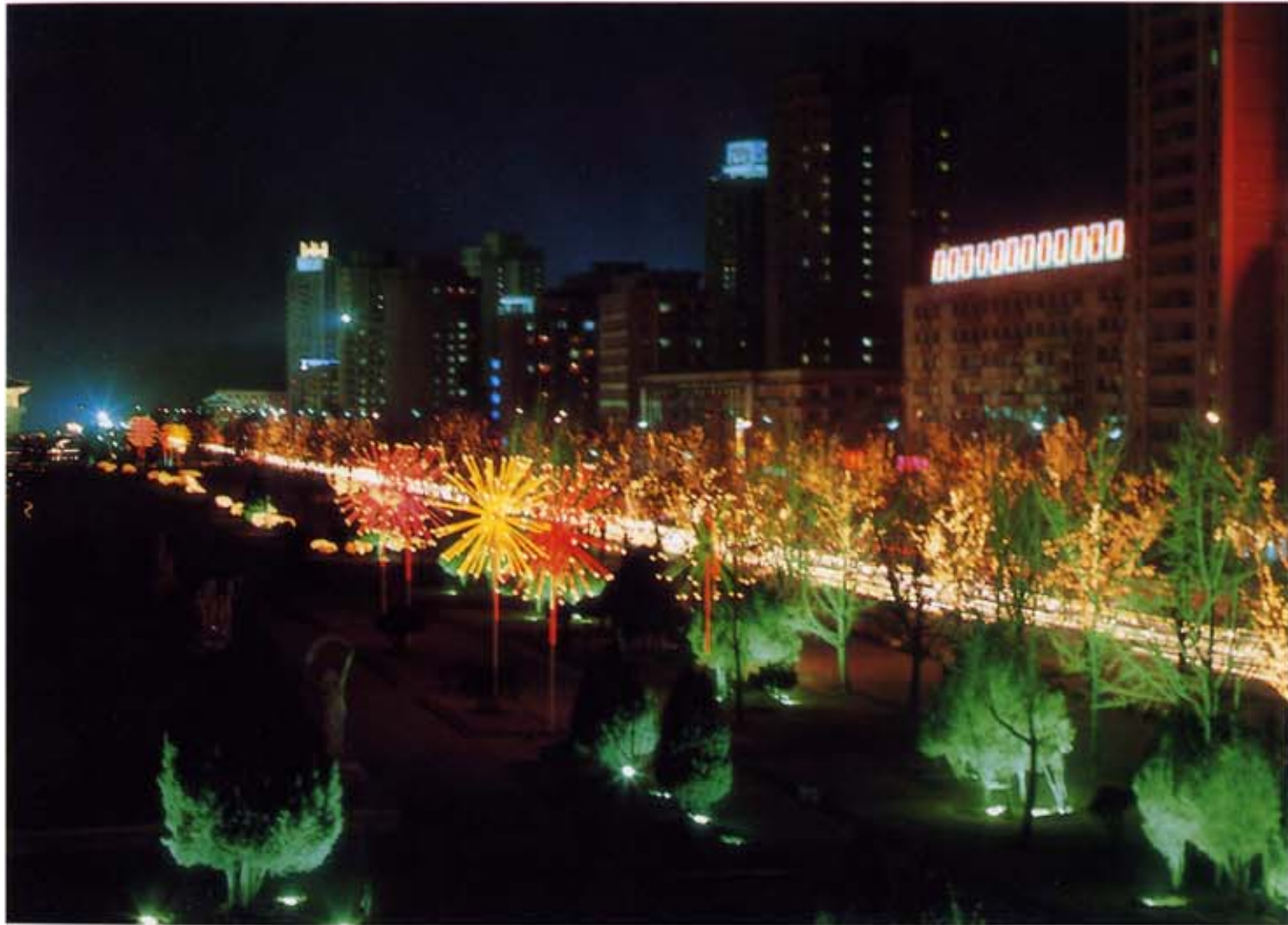
The banks of the River Pothong at night.