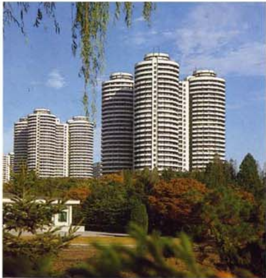
Apartment buildings on Kwangbok Street.

The main road is 100 metres wide and 6 kilometres long, featuring a number of flyovers. Tall modern apartment buildings of unusual curved or circular shapes stand in harmony with the surrounding scenery, creating a unique architectural attraction.