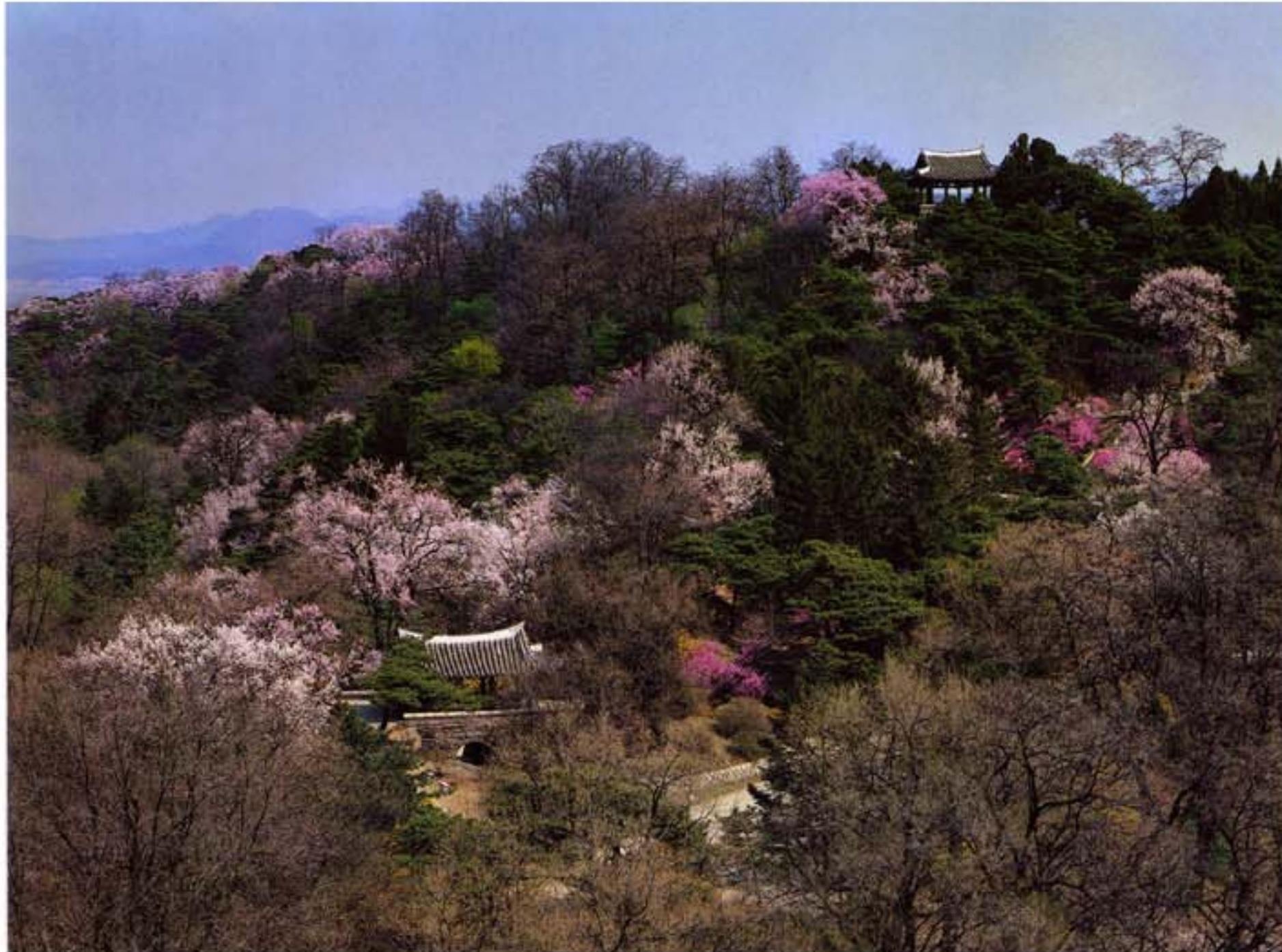
The Choesung Pavilion and the Hyonmu Gate on Moran Hill.

The peony-shaped Moran Hill is situated in the heart of Pyongyang. Its beautiful scenery attracts many visitors.