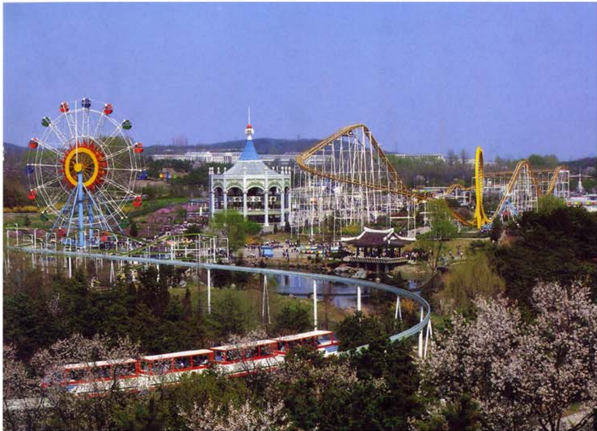
The Mangyongdae Fun Fair.