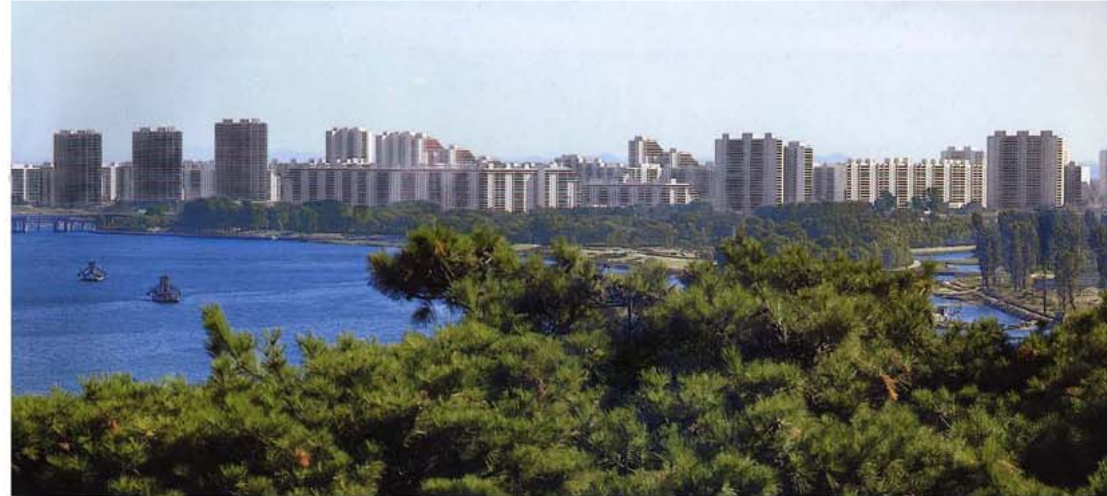
Decorative sculptures on Thongil Street.

T hongil street was built in the 1990s on a vast plain in Raknang District.