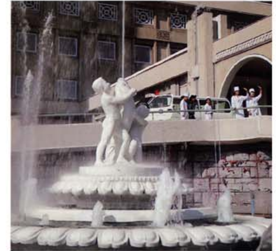
The Pyongyang Maternity Hospital.

T he Pyongyang Maternity Hospital is a comprehensive medical service center for women and an obstetrics and gynaecology research center. The hospital opened in March Juche 69(1980).