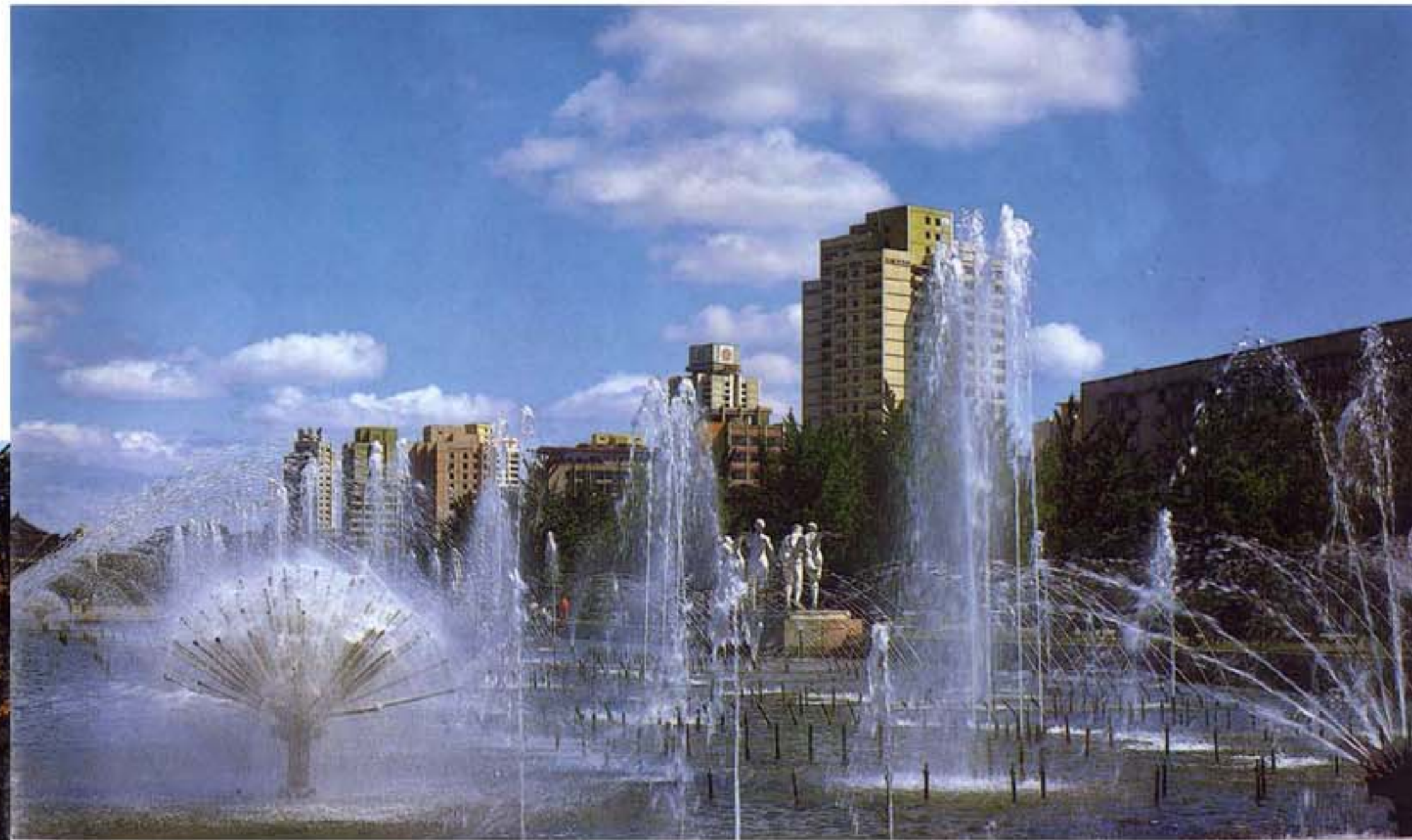
Chollima Street and fountain sculptures.