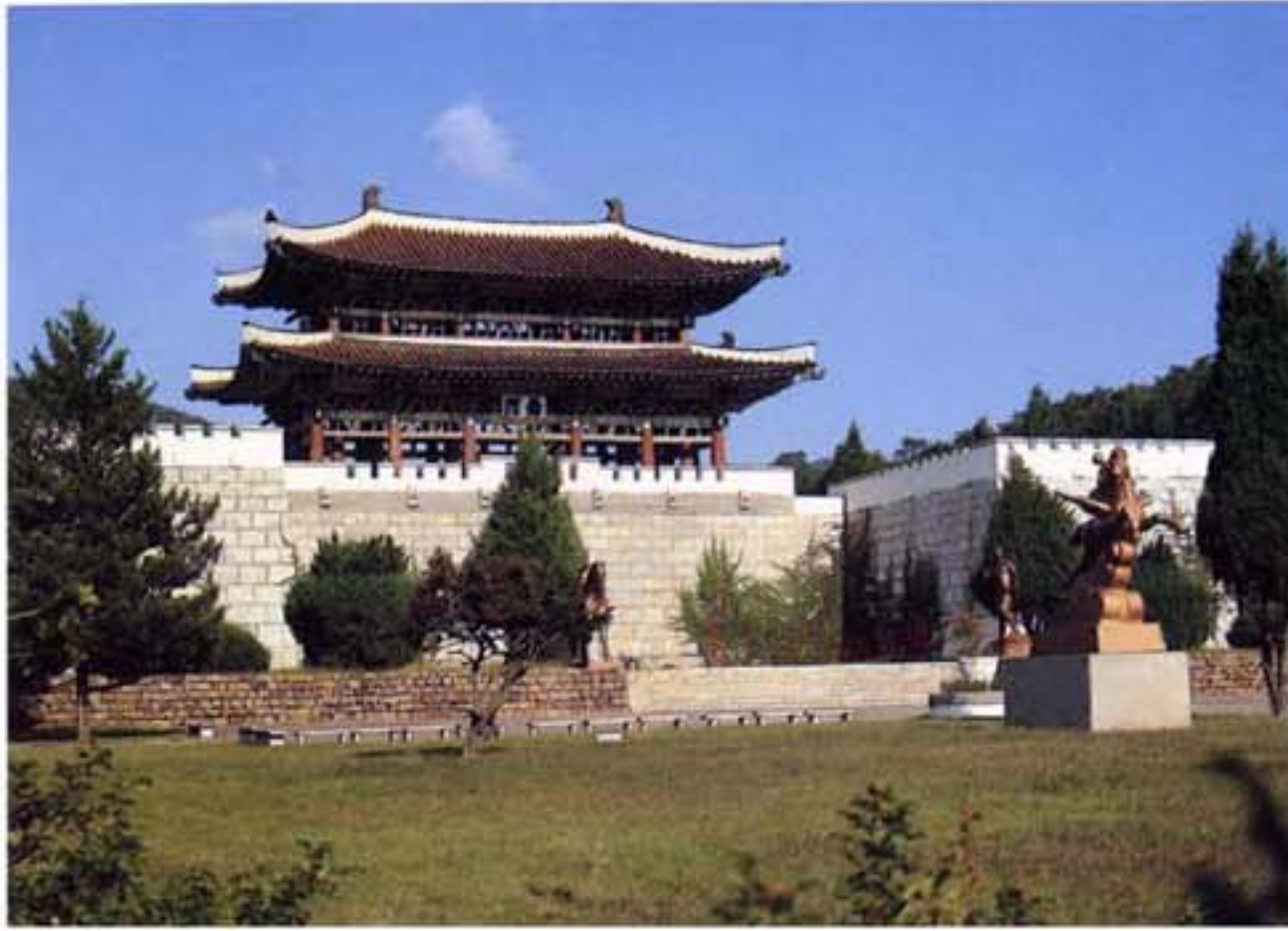
The South Gate of the Fort on Mt. Taesong.