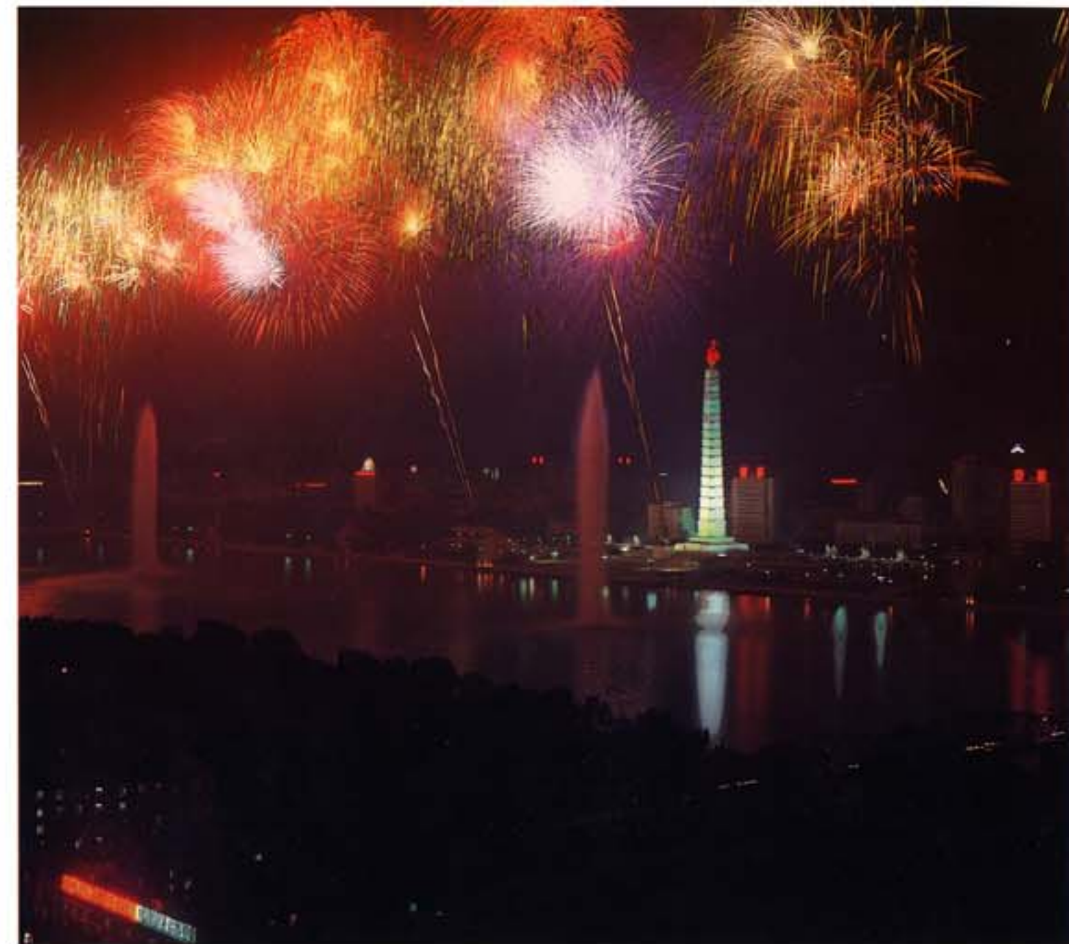
A night of celebration.