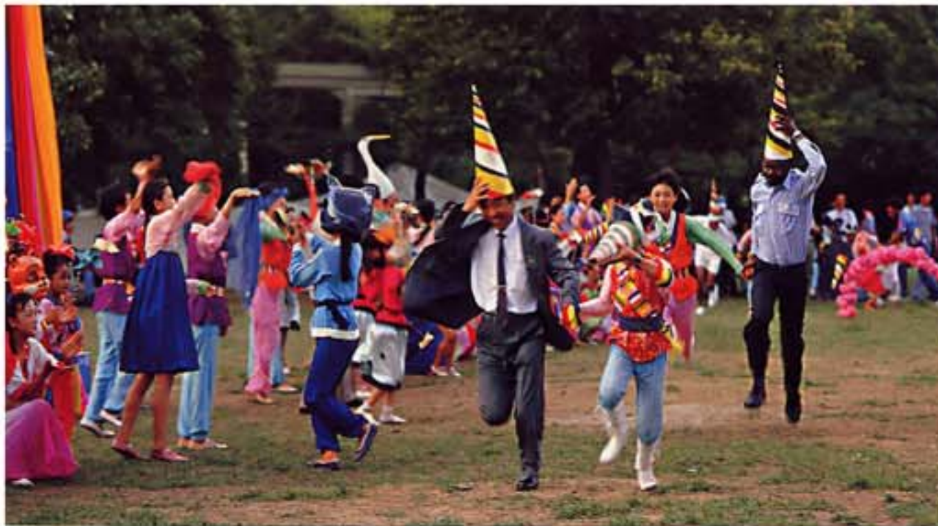
At the Moranbong Pleasure Park.