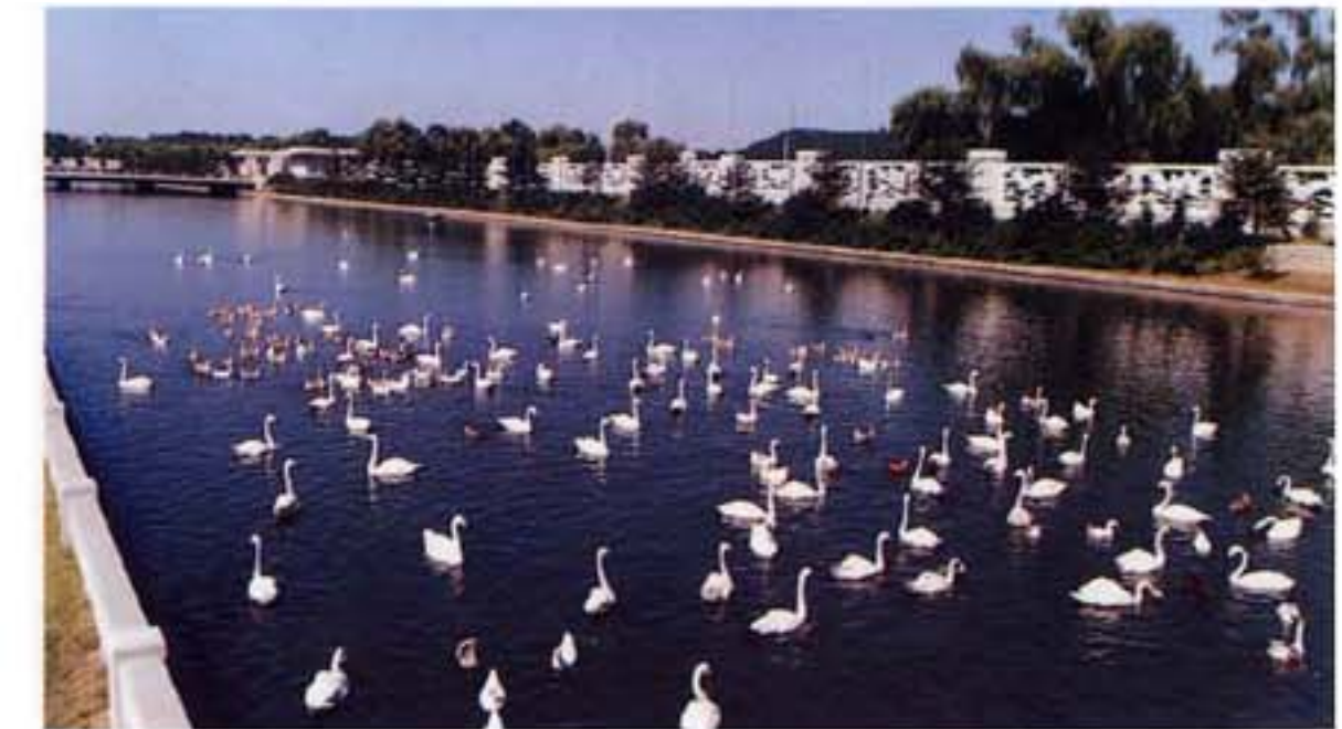
A canal of the Kumsusan Memorial Palace.