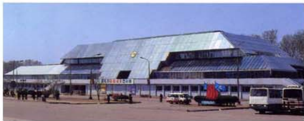
The kimilsungia-Kimjongilia Exhibition House.