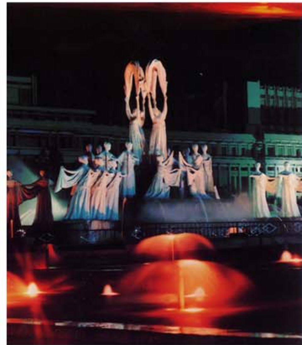
Sculptures in the fountain park.