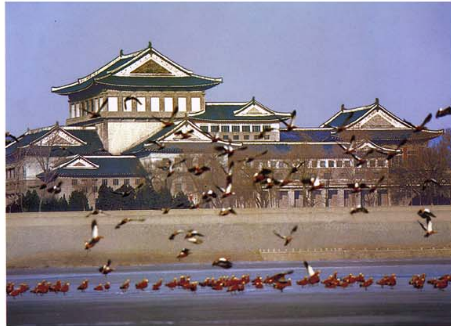
Wild ducks on the River Taedong.

happiness to the people, a river which displays the nation's wisdom and dignity.