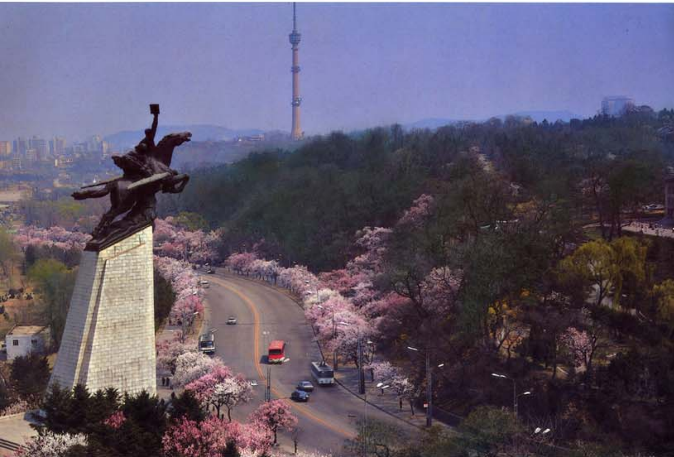
The Chollima Statue and Chilsongmun Street.

The Chollima Statue symbolizes the heroic mettle and indomitable spirit of the Korean people in the era of the Workers' Party of Korea. They are making ceaseless innovation and continuous advance in the spirit of Chollima, a legendary horse that was said to cover a thousand ri (400km) in a day.