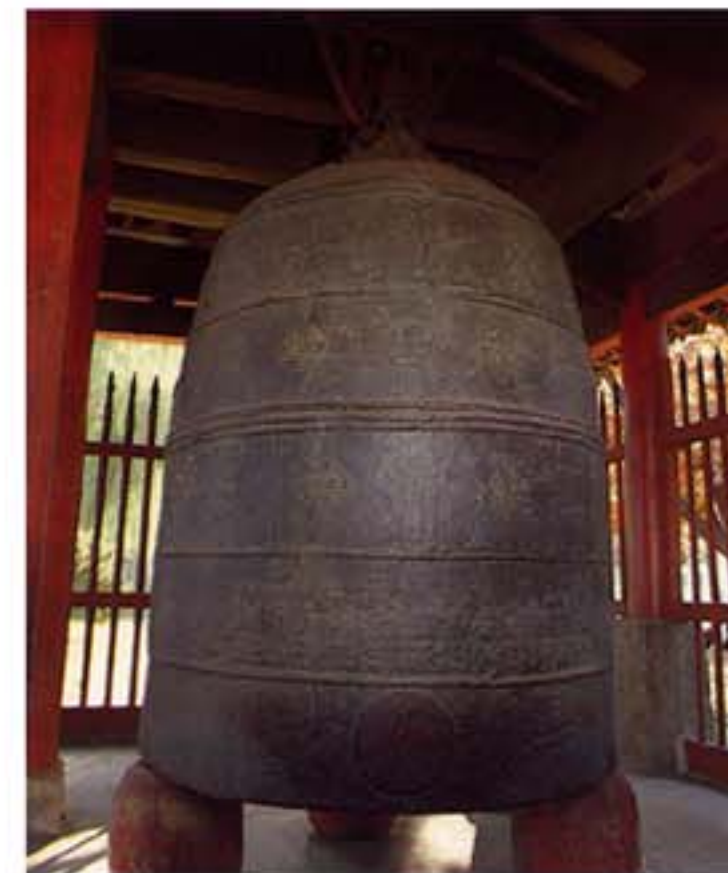
The Pyongyang Bell.