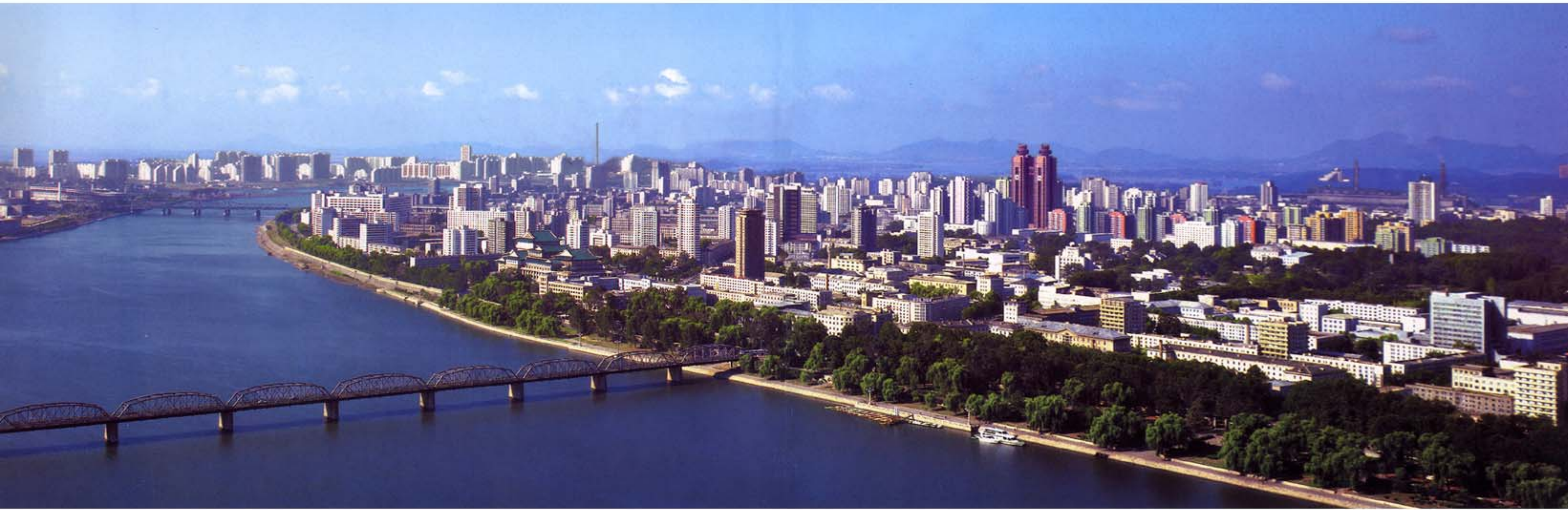
Central District, Pyongyang, viewed from the River Taedong.