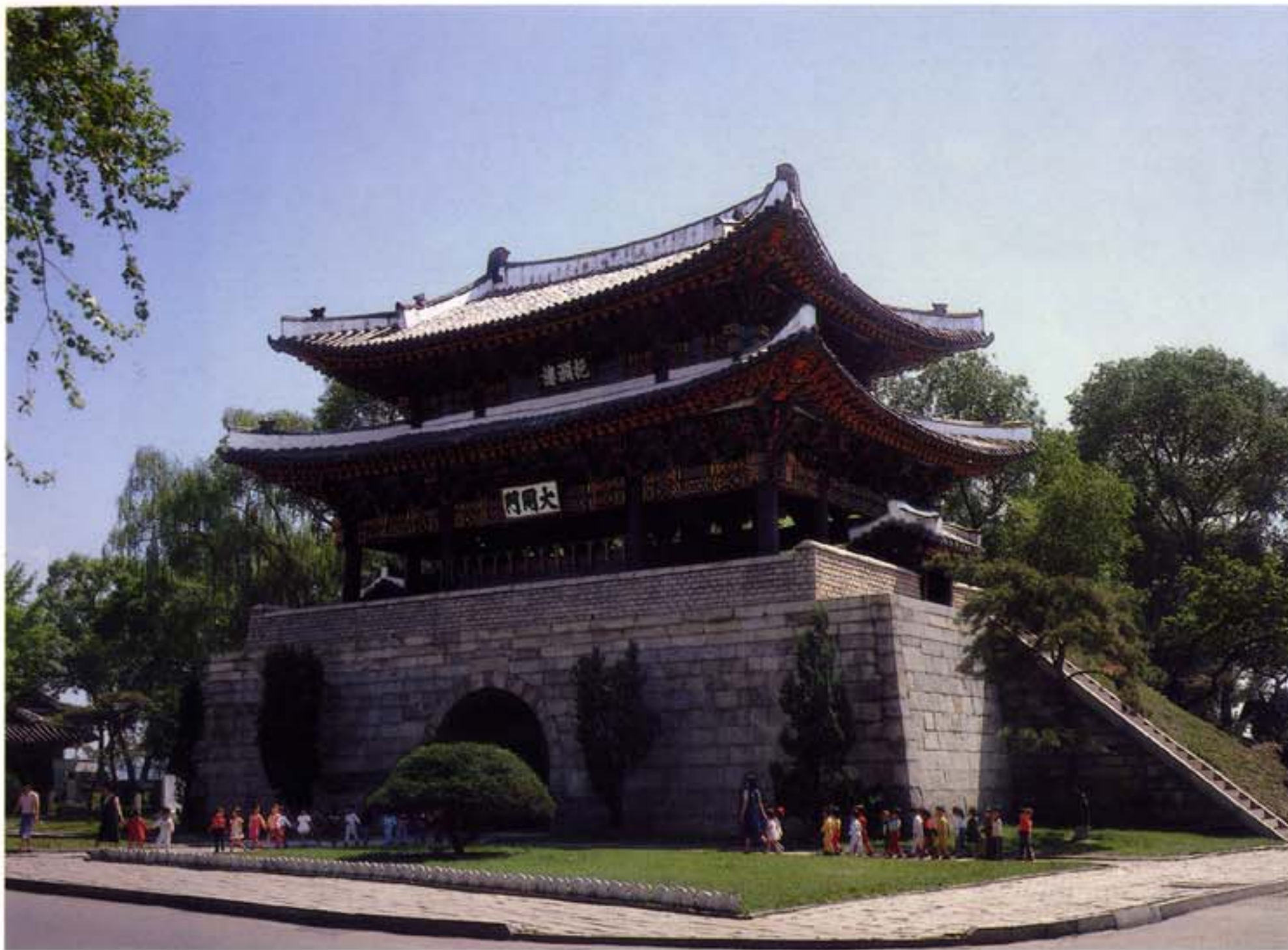
Taedong Gate in summer.