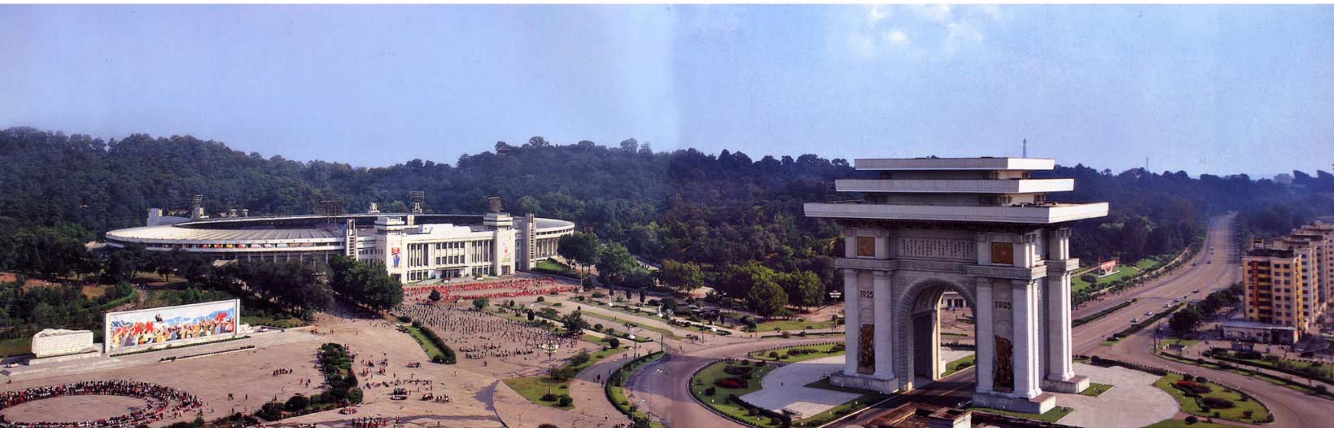
Kim Il Sung Stadium and the Arch of Triumph.