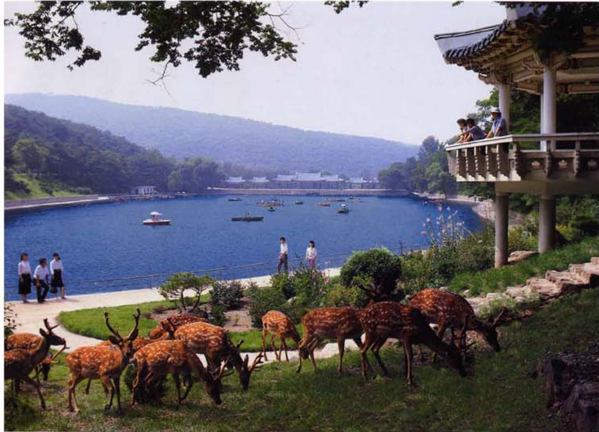
Lake Michon in the Taesongsan Pleasure Park.