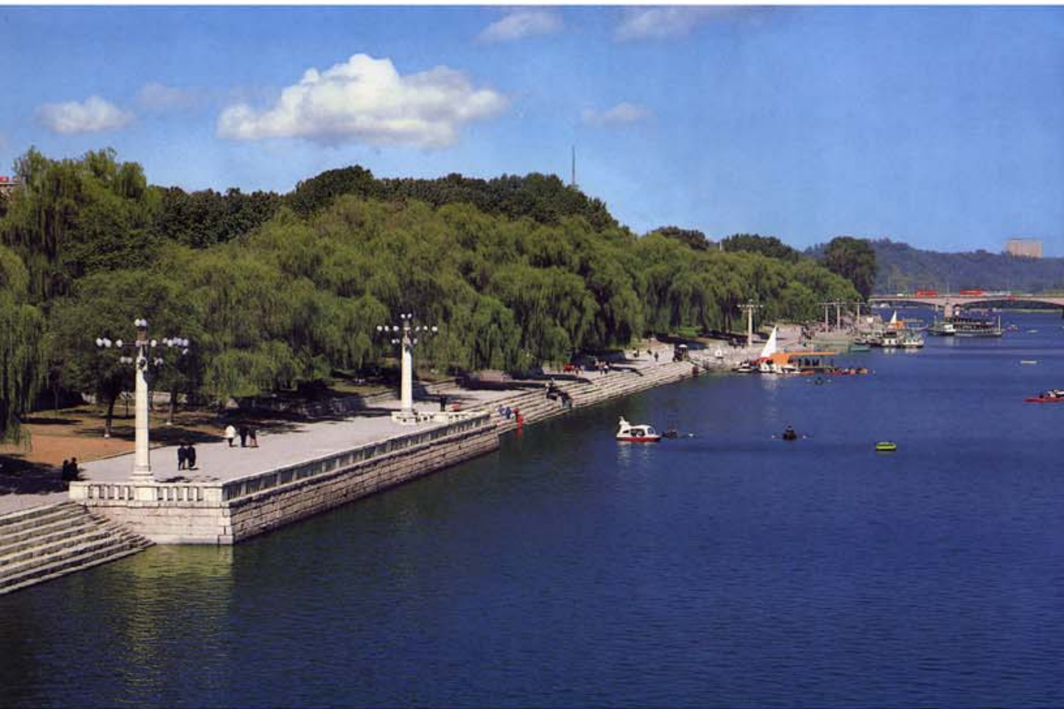
The promenade along the River Taedong.