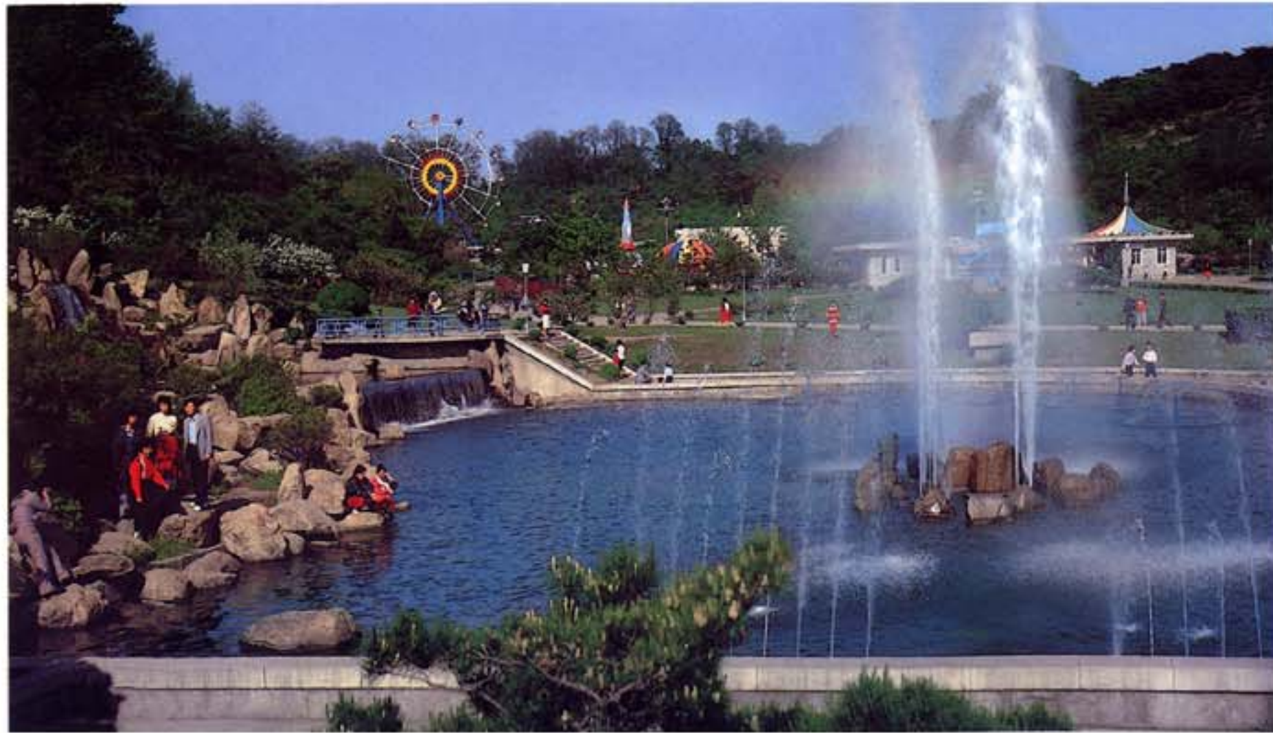
Kaeson Youth Park

This distinctive park covers an area of over 40 hectares, combining modern amusement facilities with a forest-garden environment.