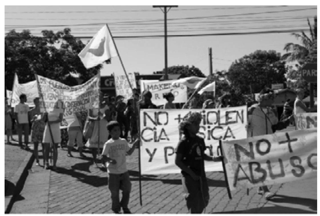
Demonstration in support of the Hitorangui clan and their land claims, February 26, 2011.

members of special police forces were sent from Chile in October and another 90 were sent in December. The number of detectives on the Island was also increased. The Attorney General appointed a Deputy Prosecutor specifically for the criminal cases arising from the land claims.