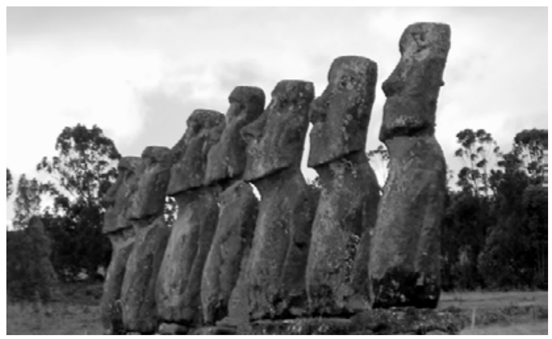
Moais in the Rapa Nui National Park, material and cultural heritage of the Rapa Nui people, administered by Corporación Nacional Forestal (CONAF).