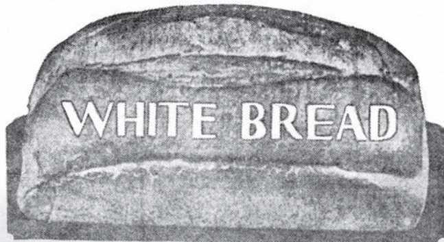
This kind of bread, which food experts say is devitalized, may be the reason for the growth and development of criminal minds, scientists now assert.