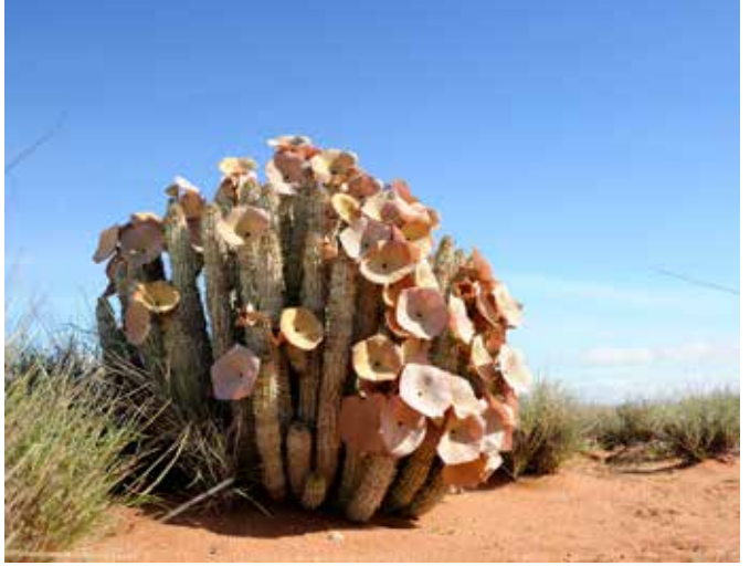
The Hoodia plant

Indigenous healers in the western Amazon use the Ayahuasca vine to prepare various medicines, imbued with sacred properties.