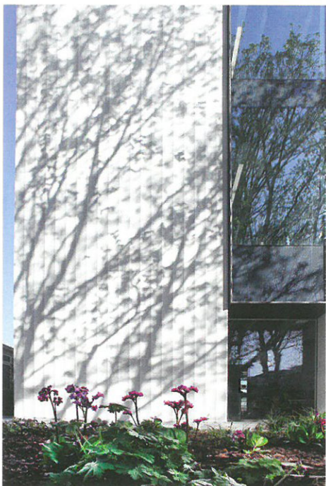
American School, London