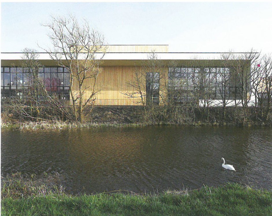
Lairdland Primary School