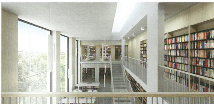
St Paul's School