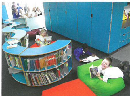
Towers Junior School

When we set up Walters and Cohen in London in 1994, well-meaning friends told us we were too young, too foreign and too female and that failure was inevitable. More than 20 years later Michal and I run a successful practice, as well known for its ethos as for its consistently high quality of work. Walters and Cohen has always been at least 70% female, thus bucking national trends. We are often asked whether our work is different because the practice is led by women: of course not. We currently employ two people who have moved out of London due to escalating house prices and in pursuit of a better quality of life. At the time of winning the Woman Architect of the Year award we employed two people who worked a short week in order to balance the demands of work and child care. Both happened to be men. We are proud of the small part we are playing in the changing culture of architectural practice.