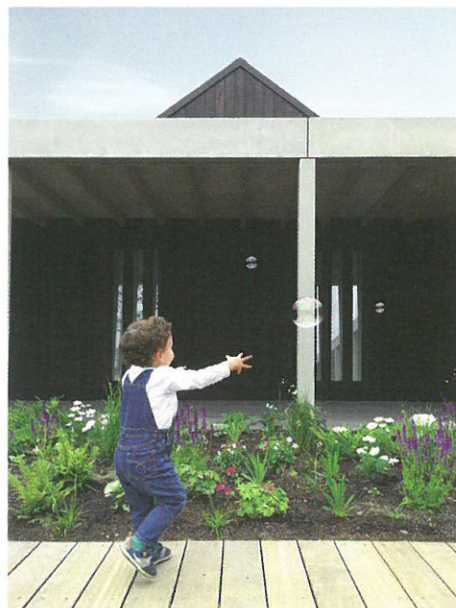
Vajrasana Buddhist Retreat Centre, Suffolk