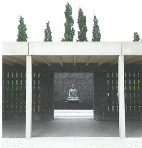
Vajrasana Buddhist Retreat Centre, Suffolk