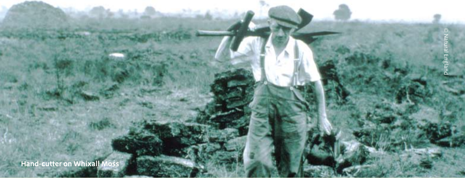
Hand-cutter on Whixall Moss