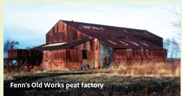
Fenn's Old Works peat factory

Peat was milled and baled here from 1938 until 1963 when the main-line railway through the Moss was