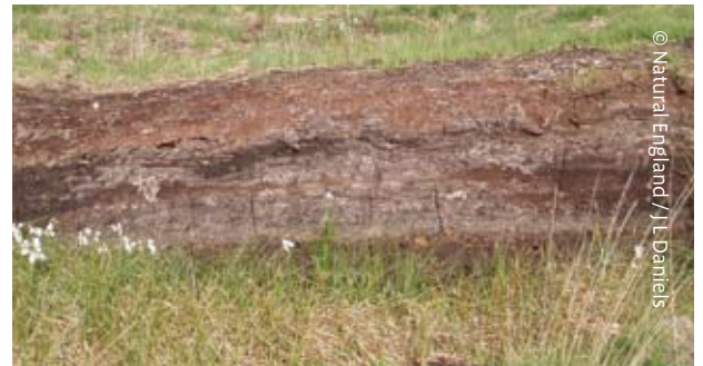
A thousand years of peat

A Bronze Age axe found in a layer of 3,400 years old Scots pine stumps in the peat, and the discovery of three preserved Bronze Age and Romano-British bog bodies, tell us that people have lived and worked here for a very long time.