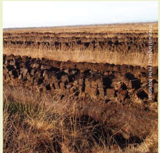
Peat cutting destroys the past

Mechanised commercial cutting of peat began in 1968, but when the rate of cutting quadrupled in 1989, a campaign was launched to rescue the Mosses. The central area was acquired as a National Nature Reserve, and in 1990, large-scale cutting was brought to an end.