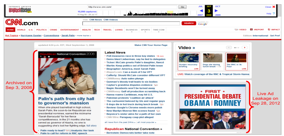
Figure 1: Live Ad Zombie Leaks into an Archived Page

When an archived page is replayed, both the domain name and the root path are changed. To correctly route all the resource references, web archival replay systems (such as Open-Wayback<sup>2</sup>, PyWB<sup>3</sup>, Memento Reconstruct<sup>4</sup>) perform static analysis of HTML pages, CSS, and JS files to rewrite href and src attributes in a way that points to their archival versions. Alternatively, a proxy can be configured or a browser add-on can be installed to reroute requests appropriately.