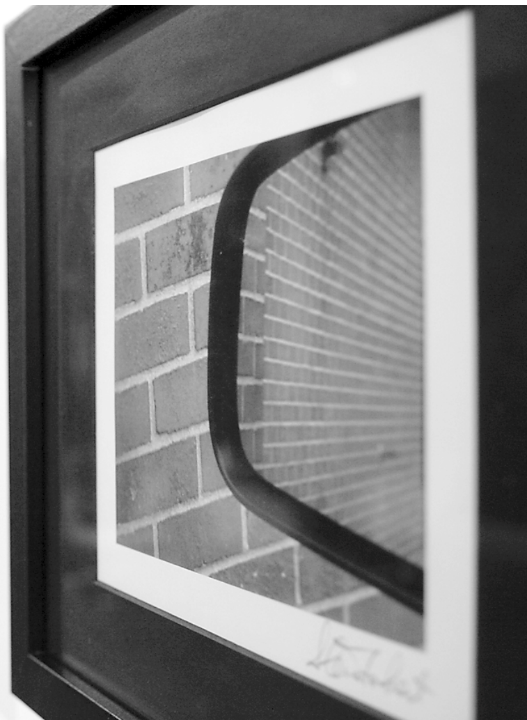
All the images in the "Highway of Sight" exhibit at Art629 Gallery in Asbury Park, including "Rear View Bricks" shown here, were taken with a 2005 LG camera phone.

Forbert said of his photography, which can veer into the compulsive. "I see things and they speak to me and I have to- if possible- try to shoot them at the angle that allows them to speak the loudest."