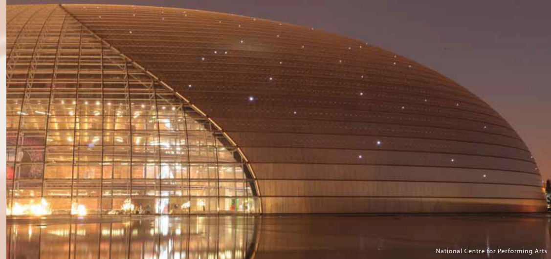
National Centre for Performing Arts