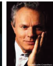
Yan Pascal Tortelier