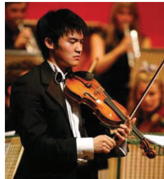
Ray Chen at the Senior Finals, Cardiff 2008

To reserve tickets: 2012menuhin@ccom.edu.cn