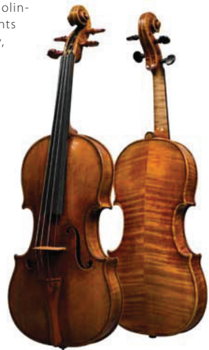
Willemotte 1734 Stradivari (front) and a Bower Soames Ricci 1734 Guarneri del Gesu (back)