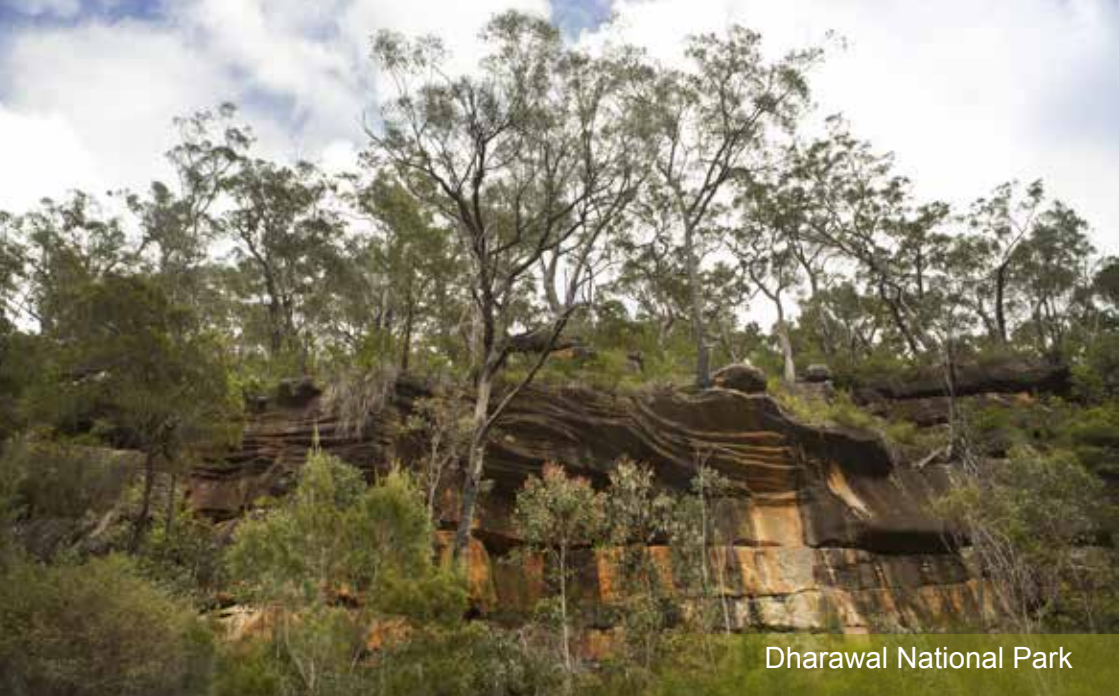
Dharawal National Park