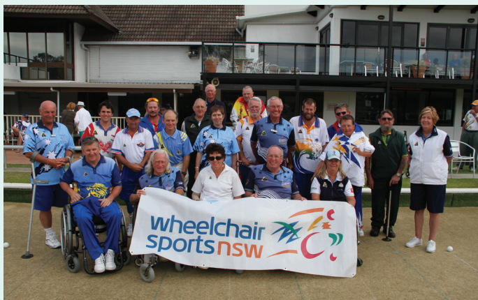
Competitors in the 2014 State Championships