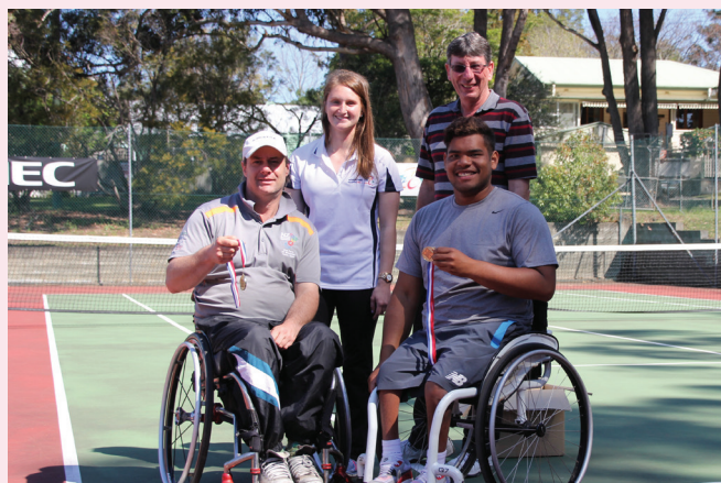
South Pacific Open Doubles winners