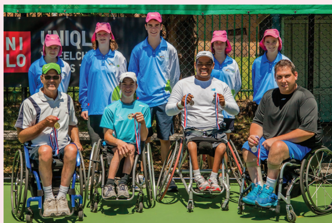
Winners and the ball kids at the NSW Wheelchair Open