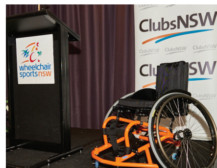
More of these wheelchairs able to be purchased with proceeds from the Luncheon