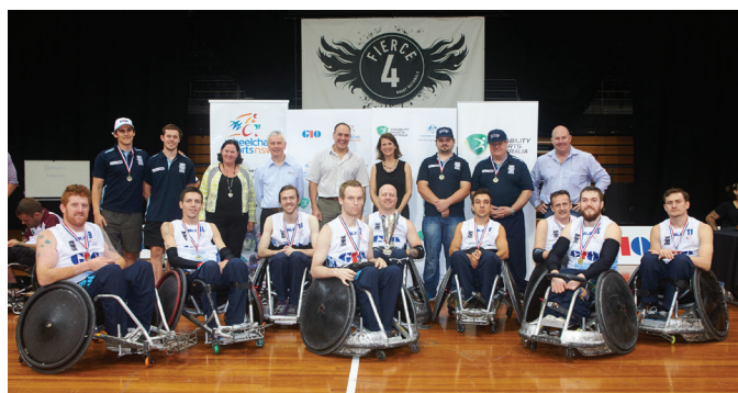
Winners of the 2014 Fierce 4 Rugby Nationals - the GIO NSW Gladiators