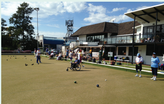
Underway in Taree at the 2014 State Championships

once again proved itself as one of the most hospitable clubs in NSW.