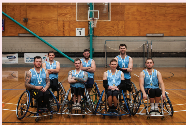
Division 1 Winners: NSWIS