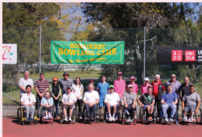
Players, volunteers and staff at the South Pacific Open