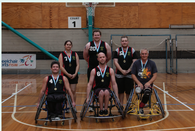
Division 2 Winners: Illawarra Hawks

Winner – Illawarra Hawks Runner Up – Coffs Harbour 3rd – NSW Juniors 4th – Illawarra Eagles 5th – Rolling Thunder