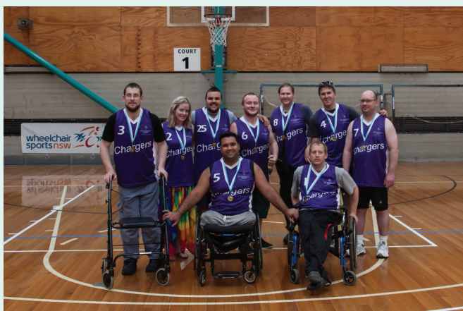
Division 3 Winners: Canberra Chargers

Winner – Canberra Chargers Runner Up – Illawarra 3rd – Sutherland