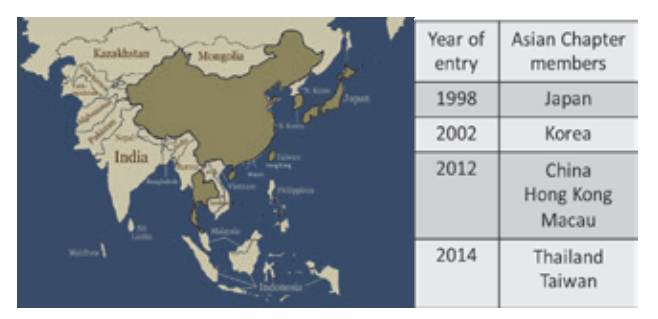
Fig.4 DOCOMOMO Asian chapter members

In Asia there are seven members, namely, Japan, Korea China, Hong Kong, Macau, Thailand and Taiwan (Fig.4). Japan is not only the first Asian DOCOMOMO's member, but it has also supported other countries in Asia to establish their own DOCOMOMO, DOCOMOMO Thailand, for example.