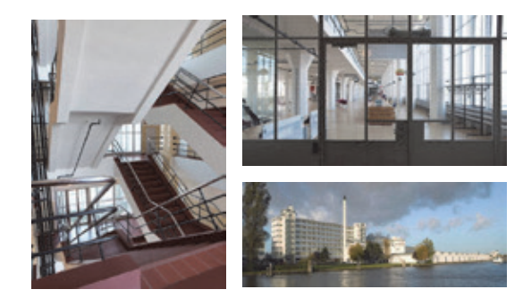
Fig.3 Van Nellefabriek, Netherlands: the World Heritage List of Modern Heritage in 2014

There have been many conservation organizations aiming to save the heritage of Modern movement internationally. One of the most influential conservation institutions is DOCOMOMO International which was established in 1988. Secondly, ICOMOS formed an advisory committee on the 20<sup>th</sup> century heritage (ICOMOS: ISC20C) in 2005. Another prominent committee is UNESCO's World Heritage. The collaborative project among these three main organizations was to achieve inscription of Modern monument on the World Heritage List (WHL). The latest WHL inscribed Van Nellefabriek, Netherlands in 2014 (Fig.3)<sup>31, 32)</sup>. It is clear that the conservation of Modern heritage has called for its important nearly three decades since DOCOMOMO International was established and some exceptional Modern buildings have been recognized their significance at international level.