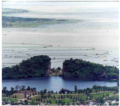
Figure 5. Tadlac Lake before and after the successful concerted efforts to ban aquaculture.