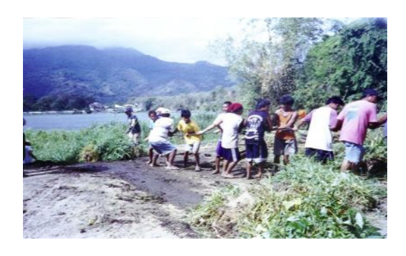
Figure 4. The "bayanihan" spirit of cleaning the lake.

Thus, what the LLDA and the FARMC have been trying to achieve in the past years, which is the reduction of fish cage area to only 30,000 m<sup>2</sup>, was surpassed by totally getting rid of any aquaculture structure in the lake (Figure 5). The determination of all sectors, particularly the Barangay Council and the FARMC made the big difference. The fish kill problem became an opportunity towards working for the sustainable management and development of Tadlac Lake.