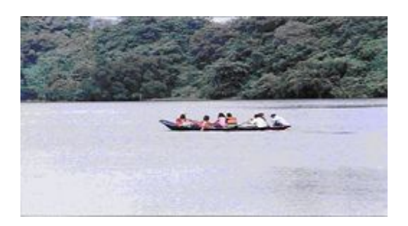
Figure 8. A clean and tranquil Tadlac Lake

Since the massive fishkill in 1999, Tadlac Lake has been transformed into a clean and tranquil lake and people are now enjoying its aesthetic beauty (Figure 8). What is more impressive and appealing is the important role played by the community leaders in convincing the fish cage operators to leave the lake. The case of Tadlac Lake has become a favorite example of a successful community based resource management approach and a classic case of the importance of partnership among the different stakeholders in lake conservation, development and management.