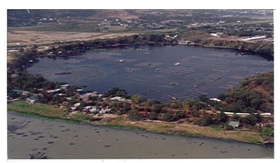
Figure 2. Tadlac Lake with aquaculture structures