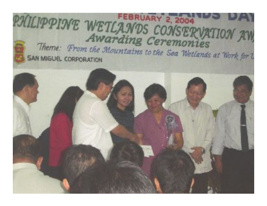
Figure 9. The President of the Barangay Tadlac FARMC receiving the Philippine Wetlands Awards from the Secretary of the Department of Environment and Natural Resources and Unilever Philippines.

The barangay is also visited by different local government units and people's organization from different parts of the Philippines to learn about their achievement in co-managing with the government a small lake, with the prospect of replicating what they have done in their respective town or community.