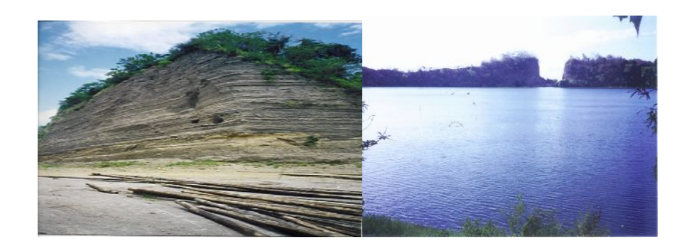
Figure 3. Quarried hill found at the northeastern side of the lake.

During this period, the privately-owned hill found at the northeastern side of the lake was quarried and went on almost unopposed by the community (Figure 3). There was no serious intervention on the part of the government to stop the activity due to the lack of presence of the LLDA and the recognition of the local government of Los Baños of the right of the land owner to develop his property. Likewise, the Philippine Environmental Impact Assessment System was not yet fully in placed at that time. About 7,000-8,000 m<sup>2</sup> of land was flattened and the quarried earth was used as filling materials for the development of the private recreational facilities along the lake and as raw material for the manufacture of hollow blocks used in the construction of buildings and houses. The "broken mountain," as it is conveniently referred to, has some beneficial use since it allowed easy access to the neighboring barangay.