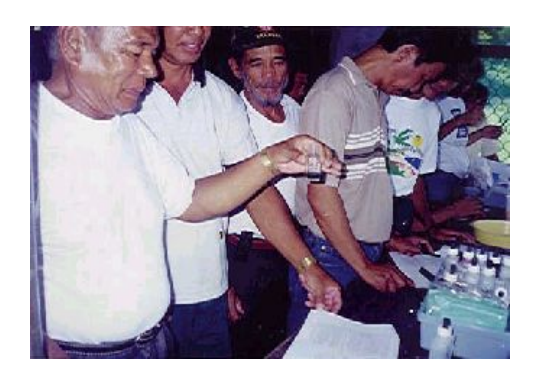
Figure 7. FARMC members were trained on water quality monitoring & analysis.

Various species of trees were planted along the lake to prevent erosion and discourage temporary human settlement. Regular lake clean up activities are being undertaken, the most recent of which was from May 4-6, 2004. The LLDA, the FARMC and the Tadlak Barangay Council shared their resources to clean the lake of "floating island," which consists of grass (locally called baret ), wood and other materials where the grass could grow.