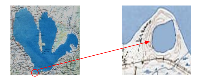
Figure 1. Map of Tadlac Lake

The lands surrounding the lake are privately owned. There are recreational facilities with swimming pools along the shore. Swimming in the lake is not so popular due to the sudden drop in its depth. Likewise, the legend of the lake speaks of a lady deity and it is a common belief that human life is taken as the lady pleases.