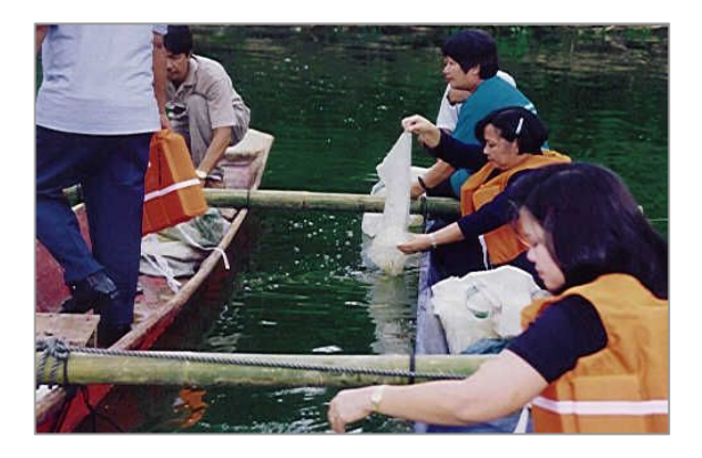
Figure 6. Lake seeding

Lake seeding (Figure 6) was done on 26 July 2000 with the slogan " Punla sa Lawa " (Seed in the Lake). This was widely supported and participated by the officials of the LLDA, the Provincial Governor, the town mayor and representatives of other government agencies. The occasion was also taken as an opportunity to witness the signing of the deed of donation by the owner of the quarried mountain of a 4-m right of way from his property to the lake.