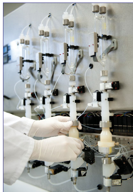
Automation of lab-scale peptide synthesis

Solvent recycling is also another approach to consider. Most of the peptides currently used in pharmaceutical products are produced at relatively small (kilos) scale, due to the potency of therapeutic peptides and their typically low therapeutic dose. This is the reason why solvent recycling is far from systematic.