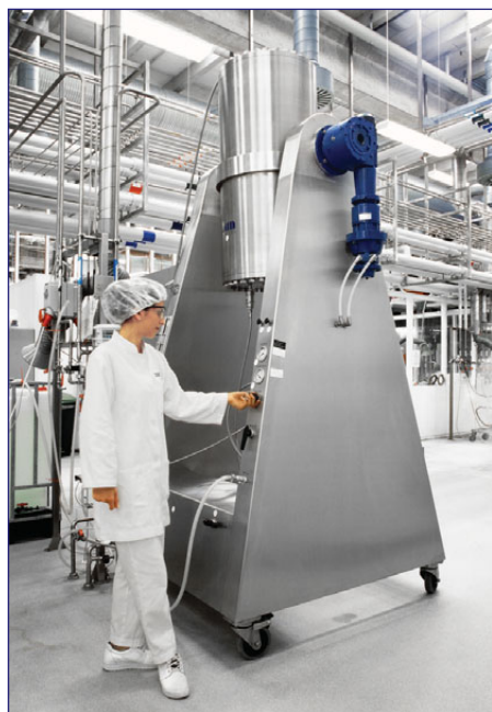
Preparative HPLC module

Solvent recycling should be considered, not only at large scale, but also at smaller scales in the future. The environmental constraints and the desire for sustainability, combined with cost pressures - for the solvent, but also for its destruction - make this increasingly attractive and necessary. Chemistry should also move to 'greener' solvents and research efforts should be conducted in this direction.