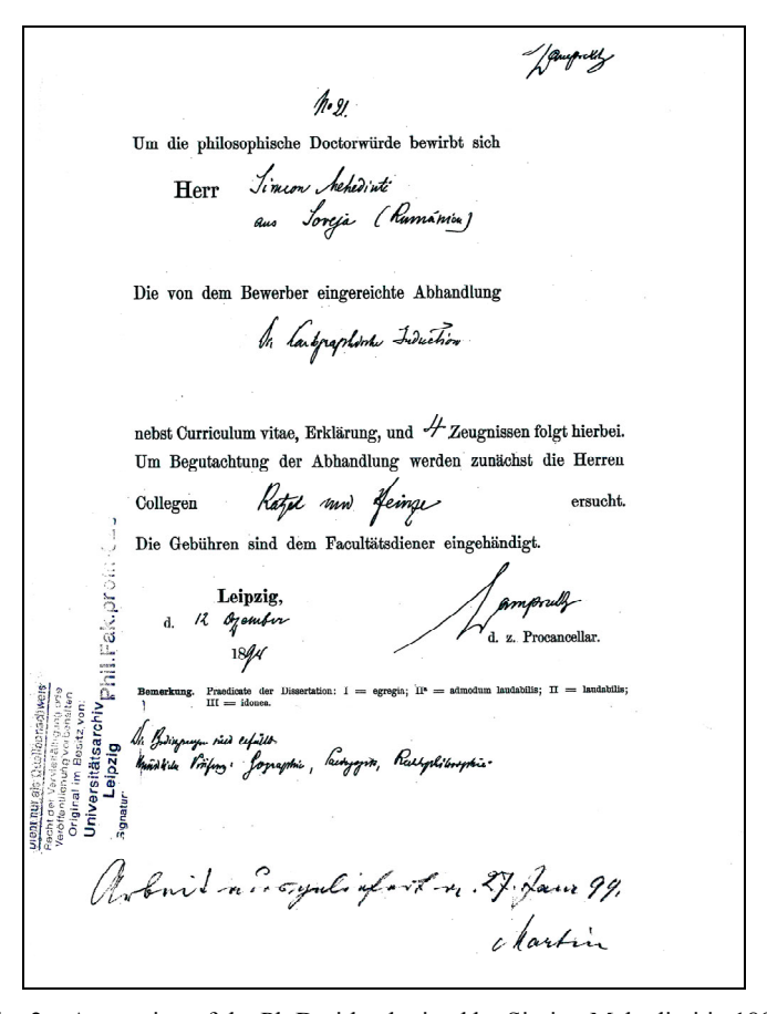
Fig. 2 – Attestation of the Ph.D. title obtained by Simion Mehedinți in 1899 (Source: Archives of the Leipzig University Library).

In early 20<sup>th</sup> century, the object of geographical study was just going to be defined, but many diverging ideas on the relationships between General Geography and Regional Geography were in the air.