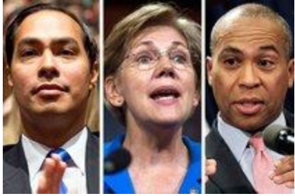
Figure 8: