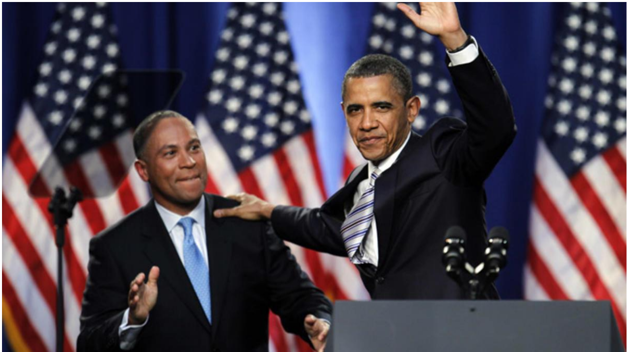
Figure 7: