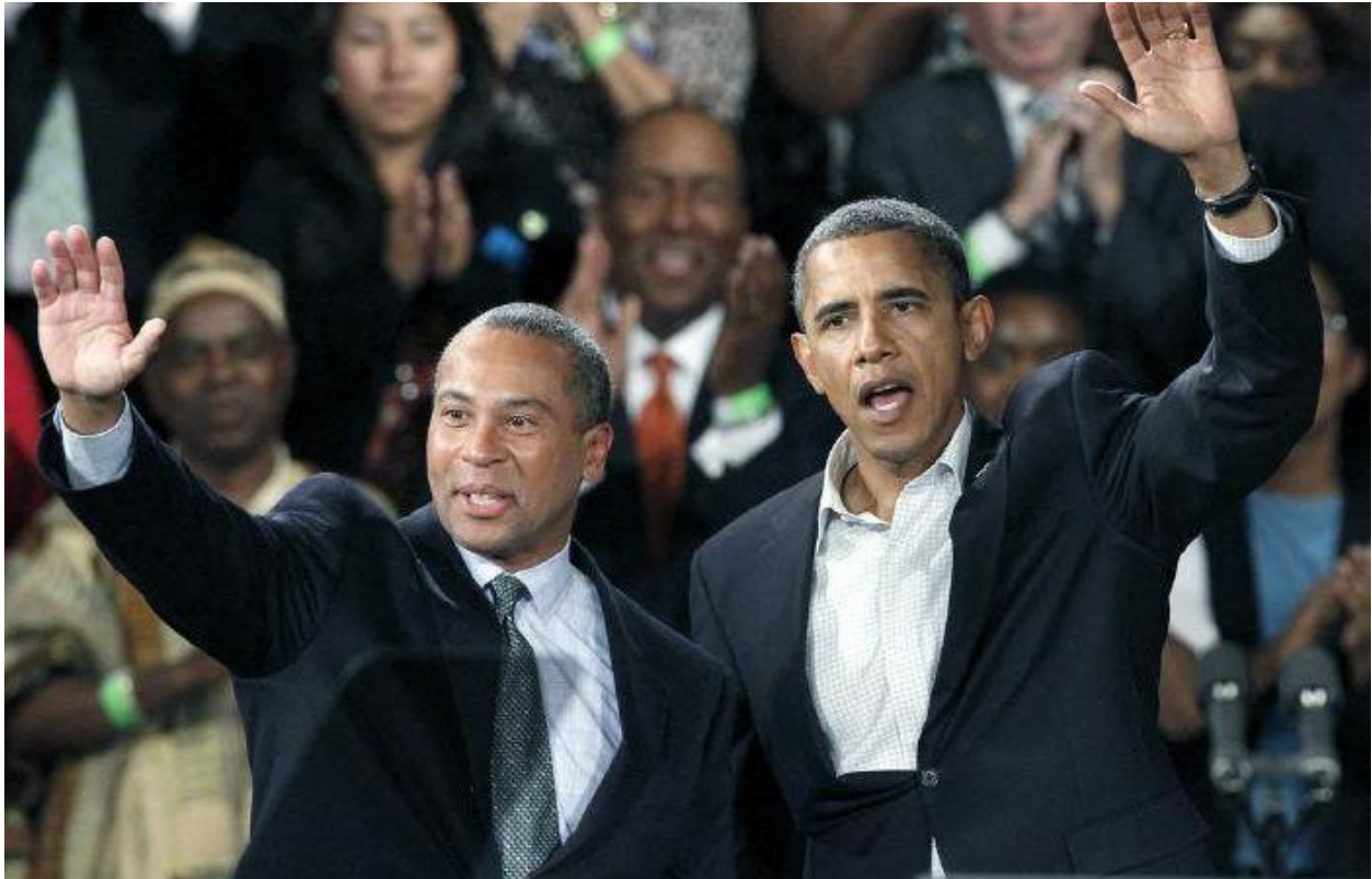
Figure 9: