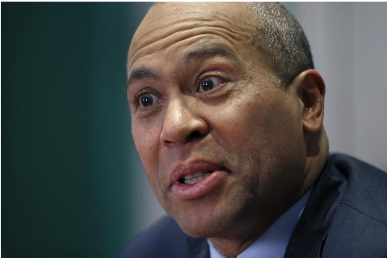
Figure 5: