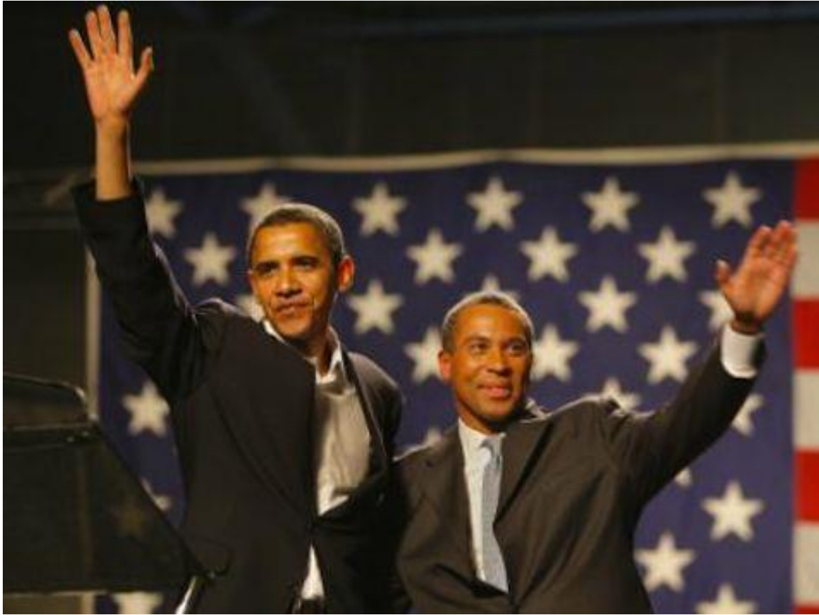
Figure 6: