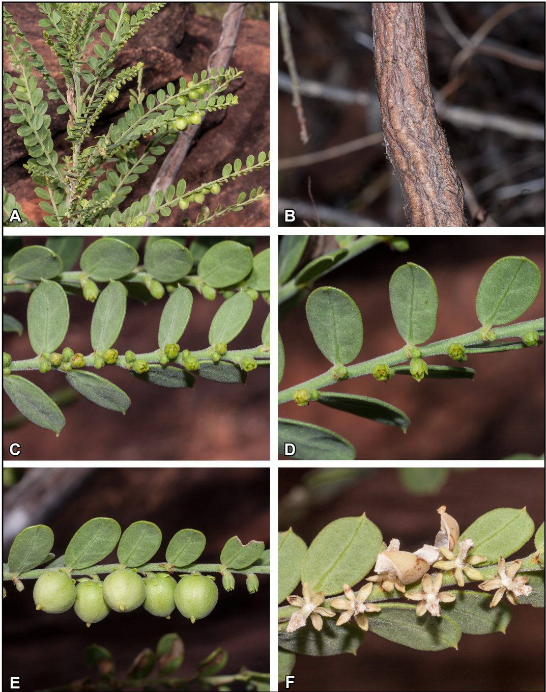
Figure 3. Sauropus rigidulus . A – fertile branches; B – woody stem showing slightly peeling bark; C – male flowers (lower branchlet); D – female flowers; E – fruit; F – dehiscent fruit with persistent axis. Images from M.D. Barrett, R.L. Barrett & B.M. Anderson MDB 4259.