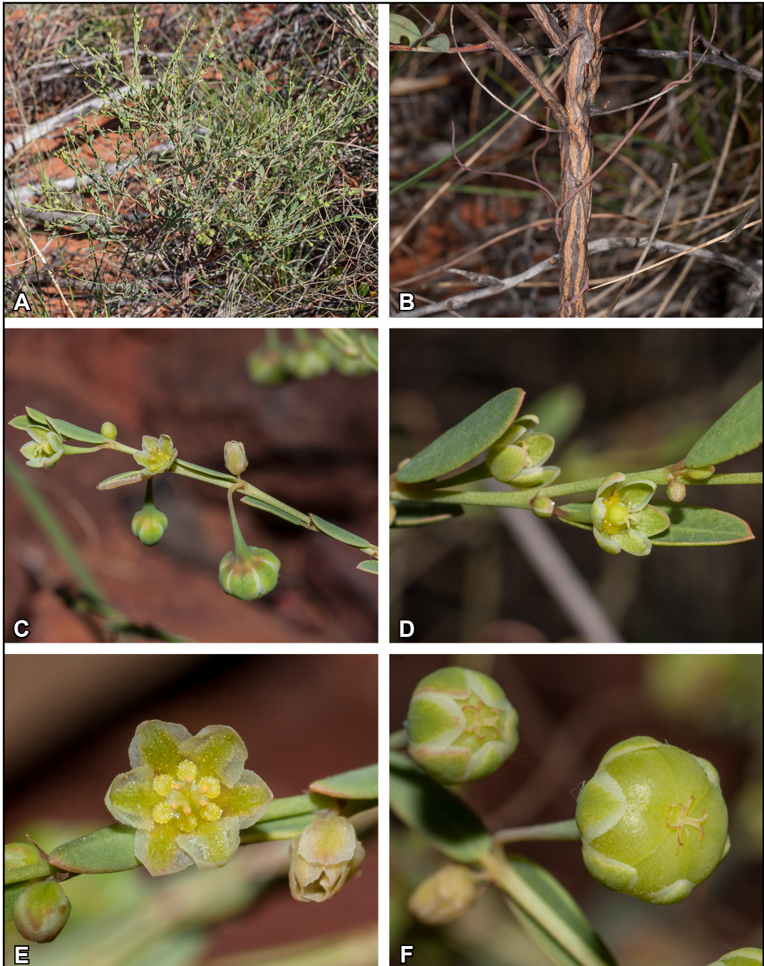
Figure 1. Phyllanthus eremicus . A – habit showing single stem and many branches; B – woody stem showing slightly peeling bark; C – flowering and fruiting branchlet with both female and male flower; D – female flower; E – male flowers; F – fruit and partially enclosing sepals. Images from R.L. Barrett RLB 8250.

cartilaginous, smooth, glabrous, grooved septically; column persistent, angular-ovoid, 1.2–1.6 mm long. Seeds pale brown, prismatic, laterally compressed, 2.2–2.3 mm long, 1.4–1.7 mm diam., smooth to very minutely transversely striate, appearing scaly; hilum slightly depressed, ovate, unbordered, cavity more or less basal. (Figure 1)